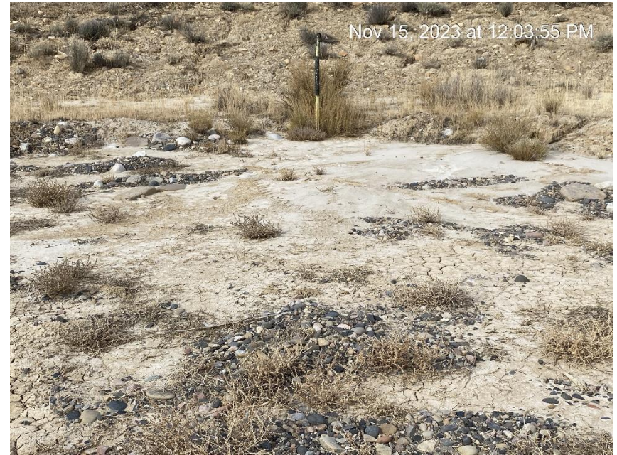
Sediment migration entering location