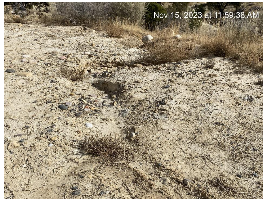
Erosion and sediment migration exiting location