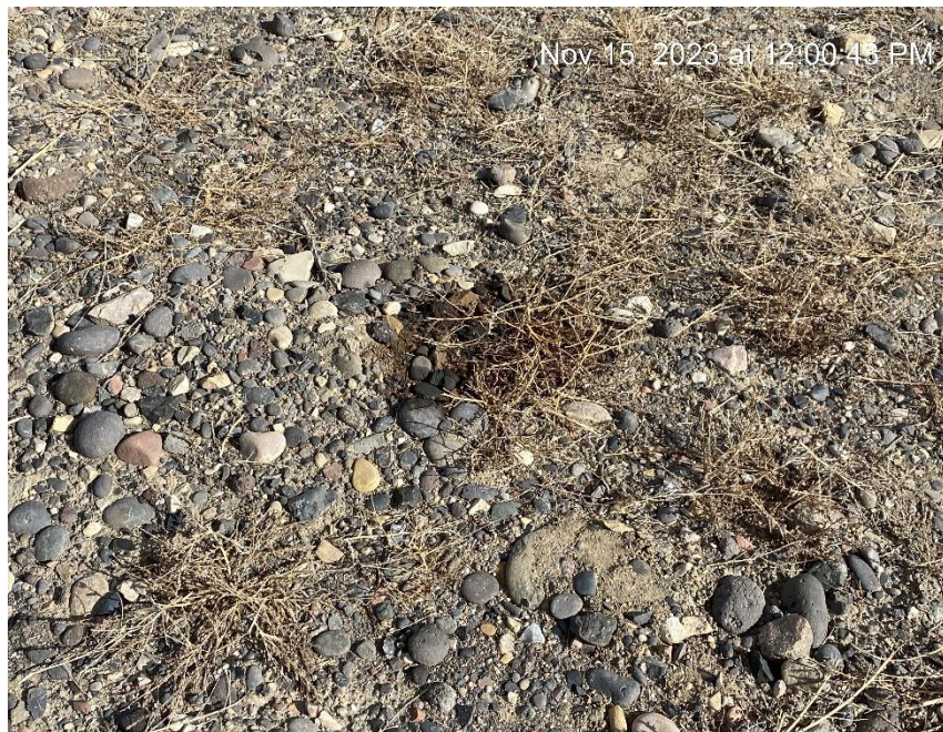
Oily waste and staining