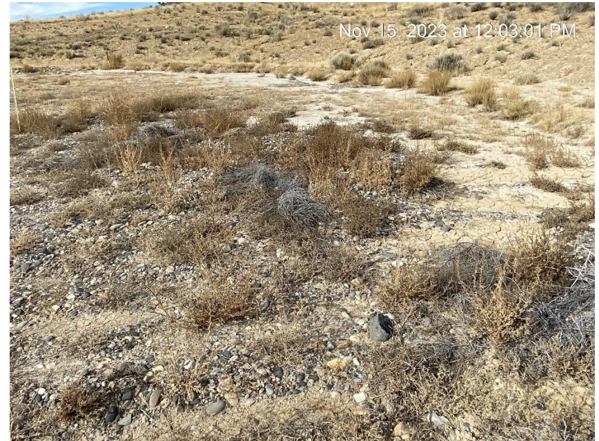
Sediment migration entering location