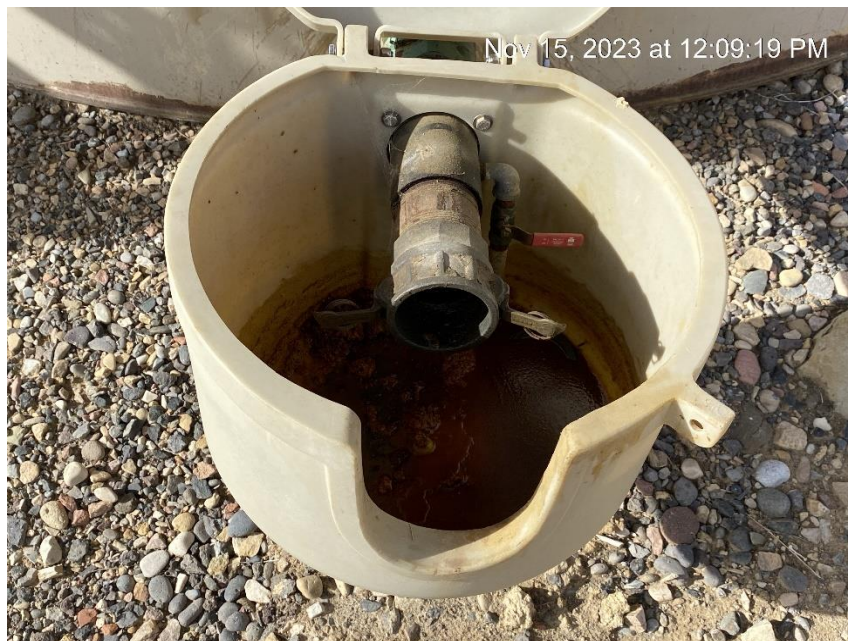
Open end load line