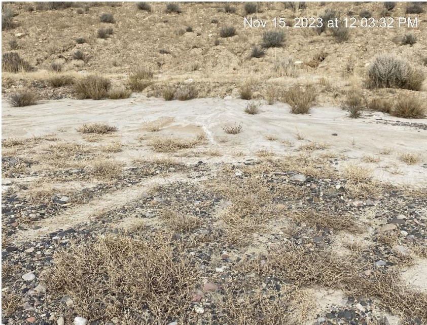
Sediment migration entering location