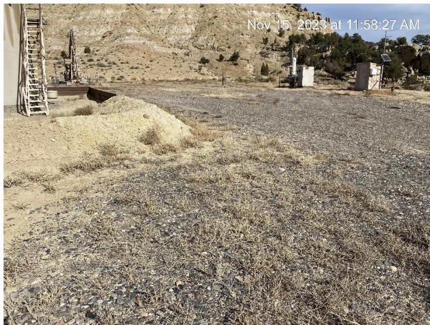
Location from Souhwest corner