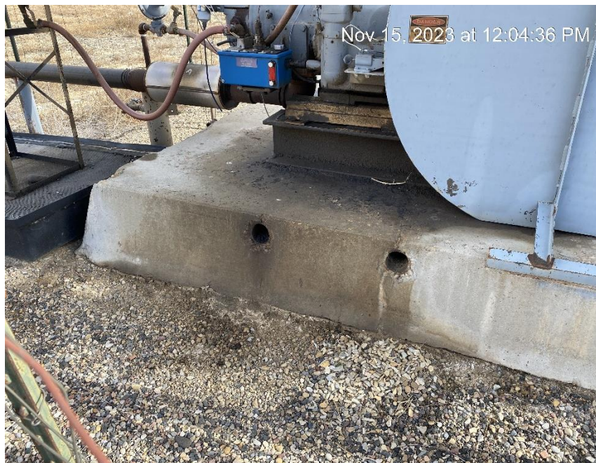
Oily waste and stained soil