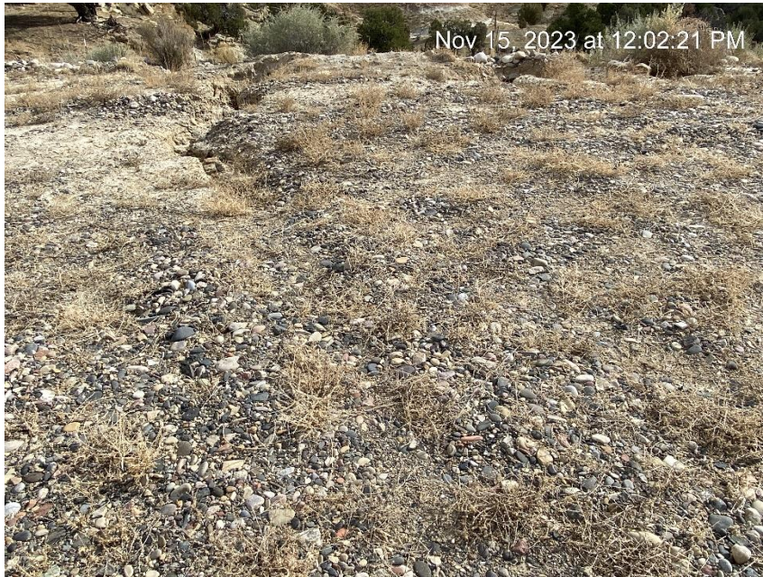
Erosion and sediment migration exiting location