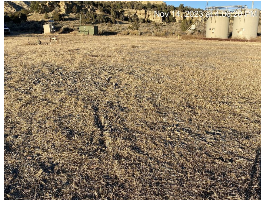
Location from Southwest corner