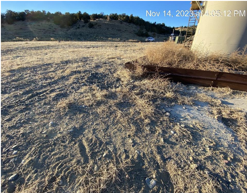
Location from Southeast corner