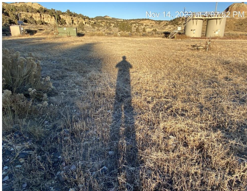
Location from Northwest corner