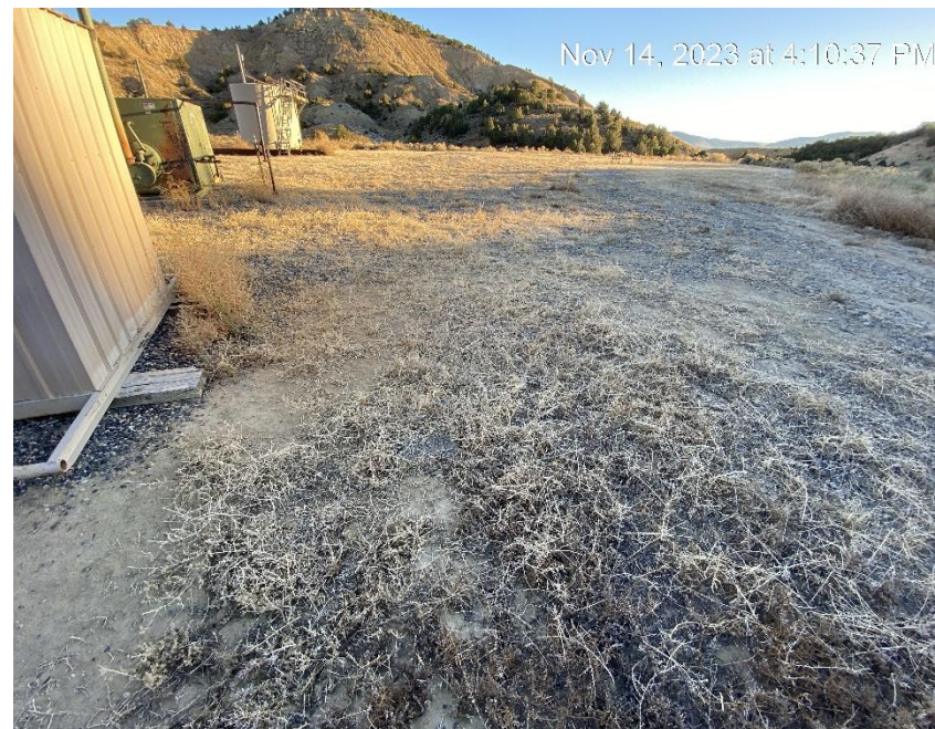
Location from Northeast corner