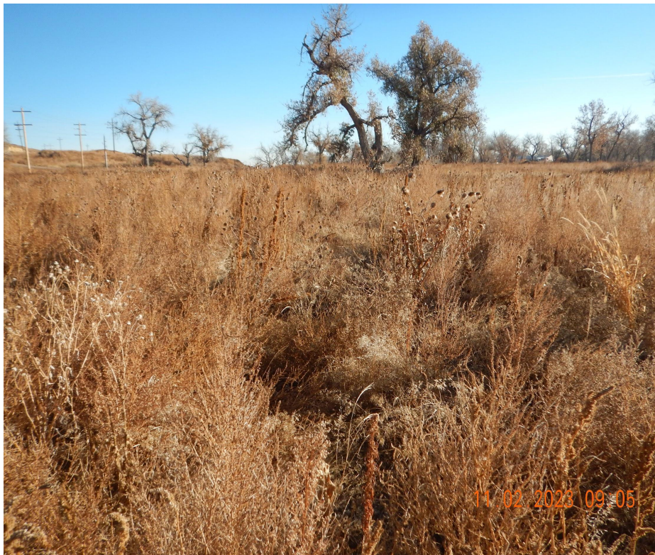
Photo 5. Reference photo taken just north of the off location tank battery, facing North. Photo illustrates a dominance of annual vegetation that appears to have established after a recent stormwater run-on evident.