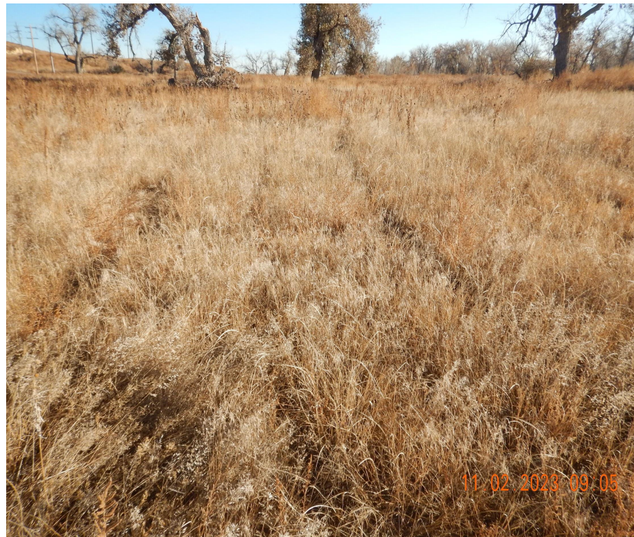
Photo 6. Another reference photo taken east of the off location tank battery, facing North. Photo illustrates a high density of cheatgrass mixed with sand dropseed.