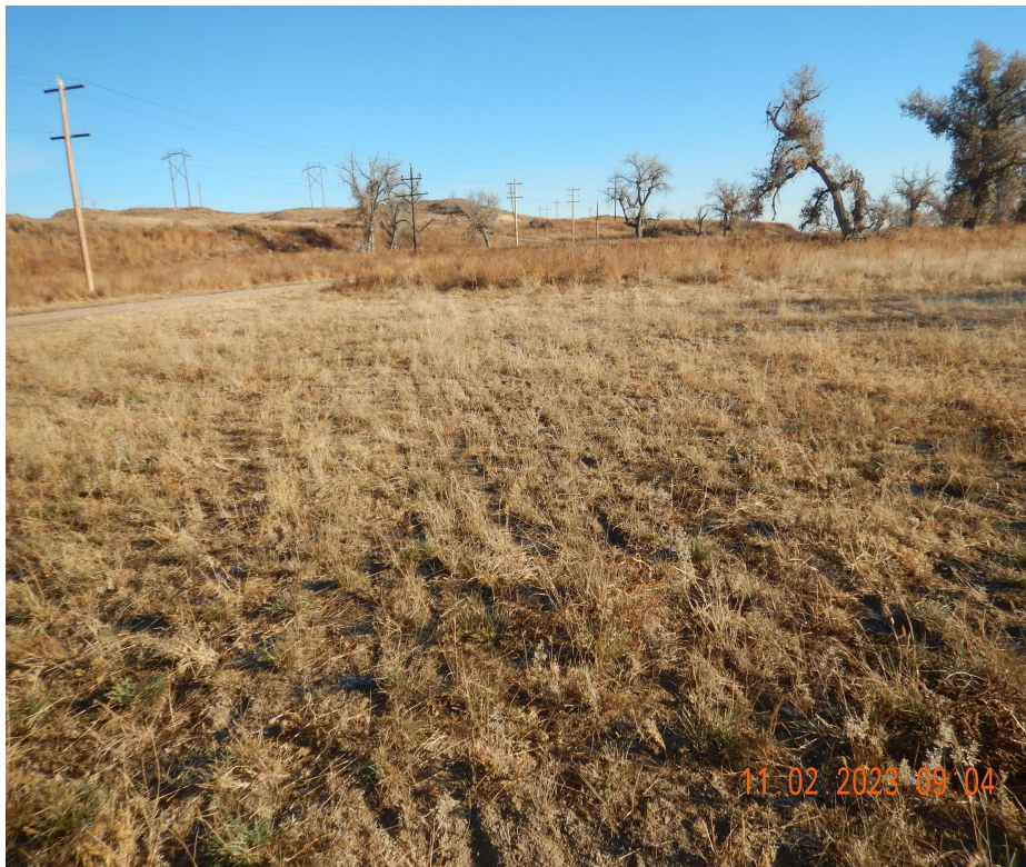
Photo 1. Photo taken from the off location tank battery, facing North. Photo illustrates the establishment of perennial vegetation, which has a higher percentage of perennial vegetation cover than the nearby reference areas.