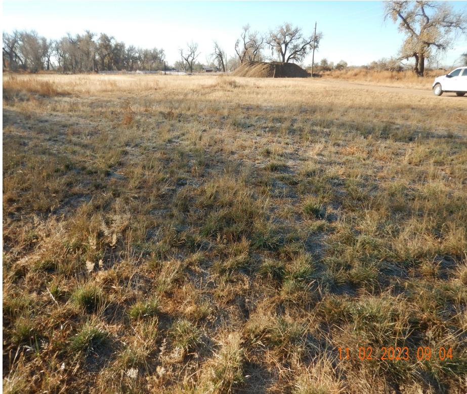
Photo 3. Photo taken from the off location tank battery, facing South. See comments under Photo 1.