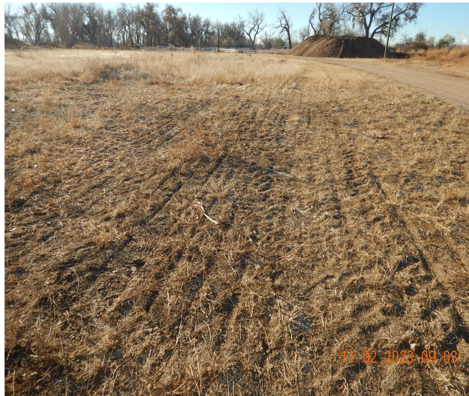
Photo 2. Photo taken from the off location tank battery, facing South. See comments under Photo 1.