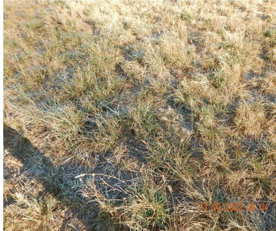
Photo 4. Close up photo taken from the off location tank battery. Photo illustrates the establishment of perennial vegetation.