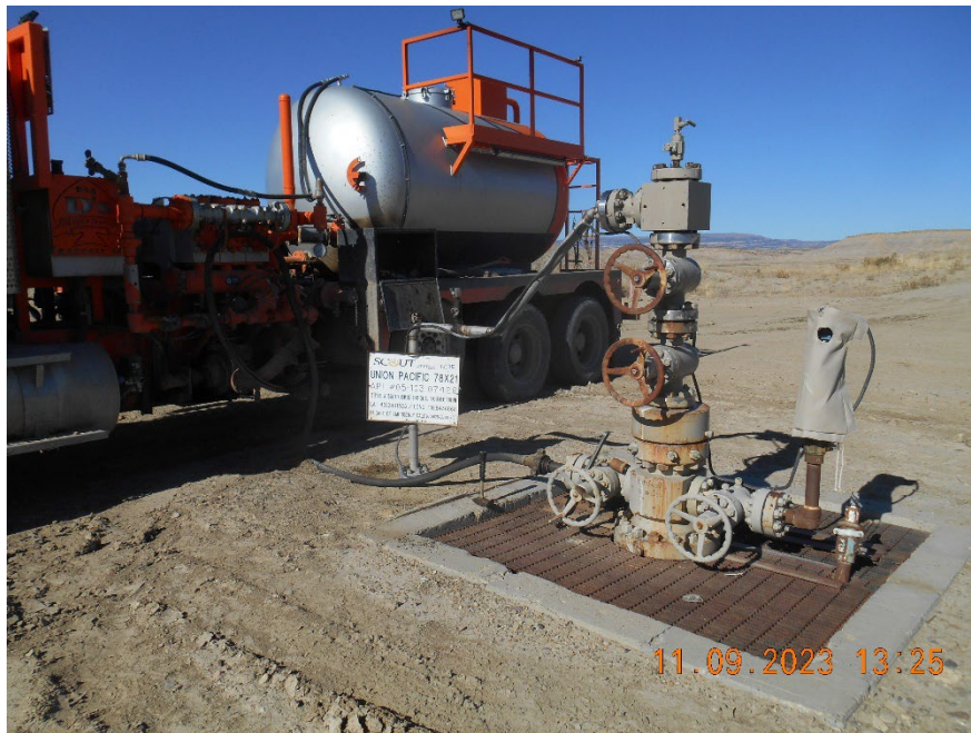
Injection well during MIT

Inspection Date: 11/9/2023 Inspection Doc#: 693806535