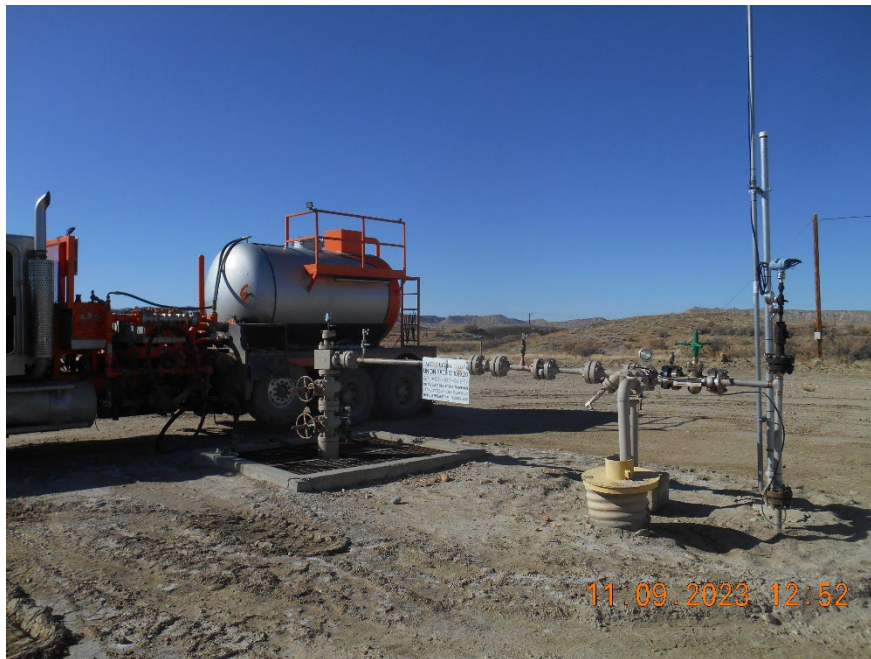
Injection well during MIT

Inspection Date: 11/9/2023 Inspection Doc#: 693806534