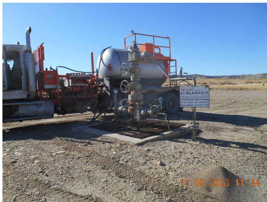
Injection well during MIT