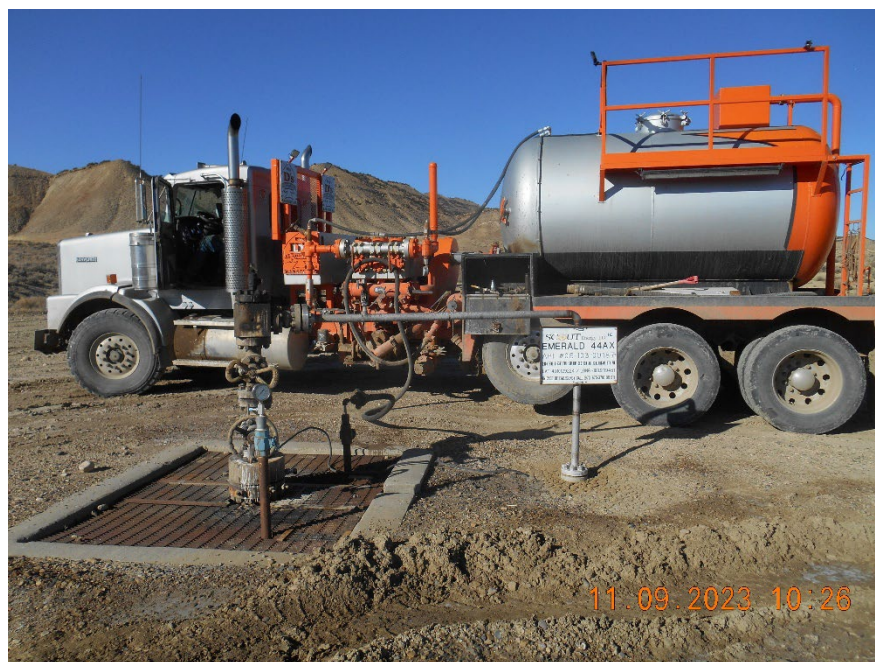
Injection well during MIT