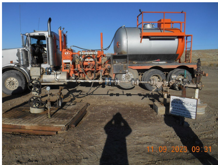
Injection well during MIT