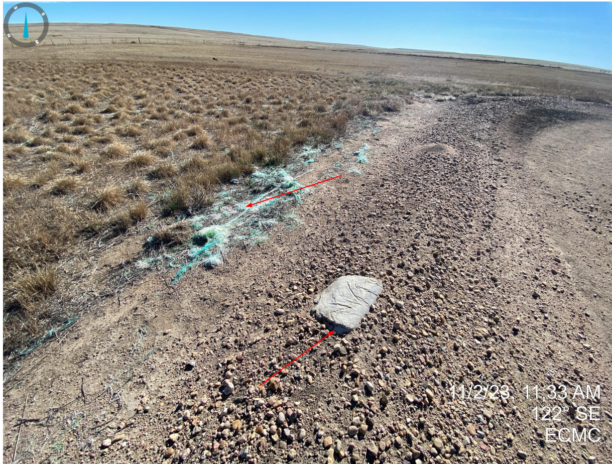
Photo 4. Previous inspection documented string/twine; this has not been removed since the previous corrective action inspection has been submitted.