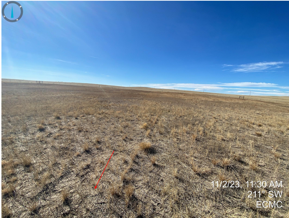
Photo 7. Non-uniform vegetative cover resulting in bare/exposed soils within the reclaimed pit. Undesirable vegetation (e.g. russian thistle, kochia and crested wheatgrass) observed throughout. Additional reclamation activities are required.