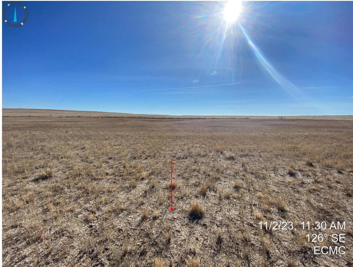
Photo 8. Continued from the previous photo, facing towards the southeast corner of the reclaimed pit.