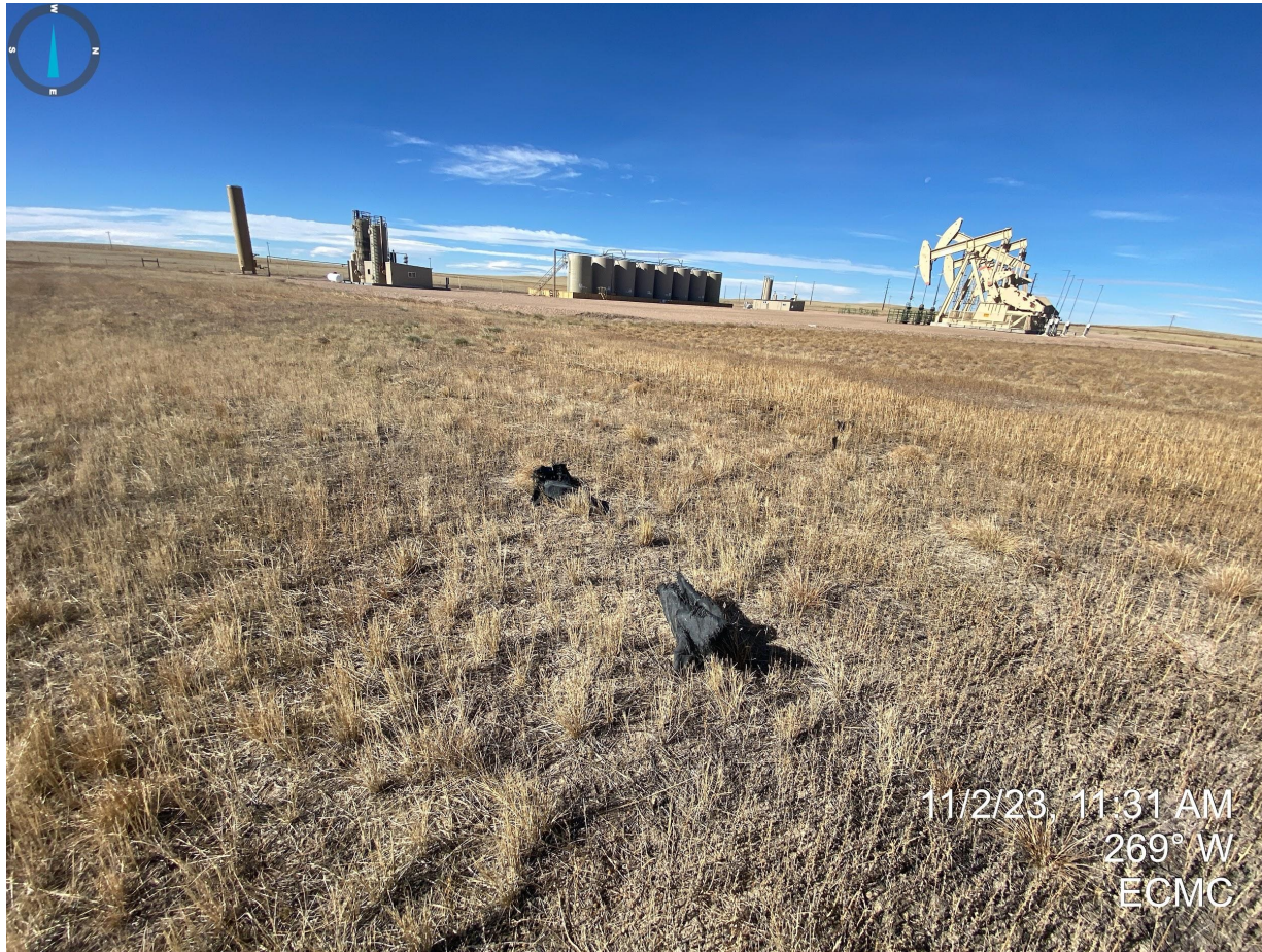
Photo 3. Trash observed in the eastern side of the interim areas.