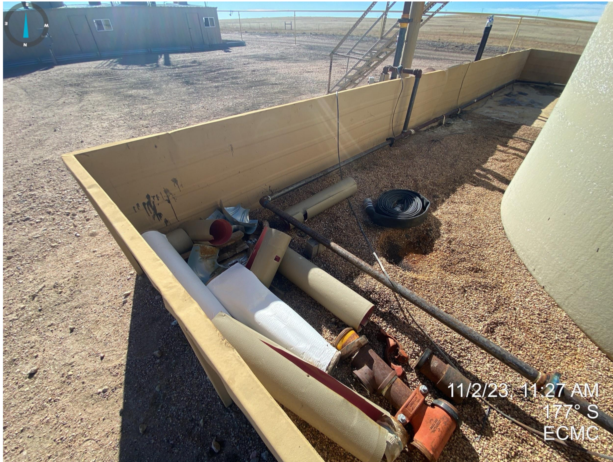
Photo 2. Unused equipment within the secondary containment of the tank battery.