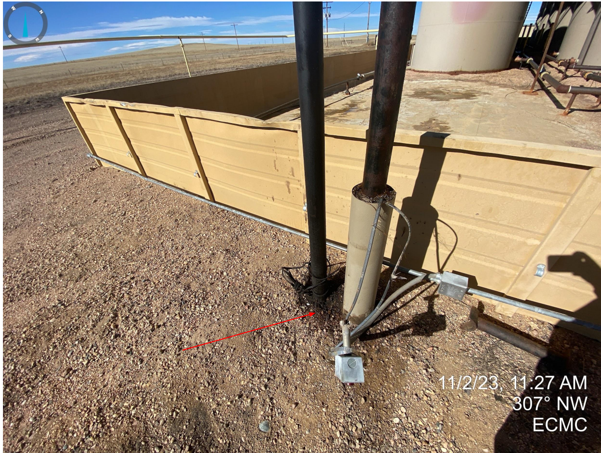
Photo 1. Stained soil observed on the south end of the tank battery facility.