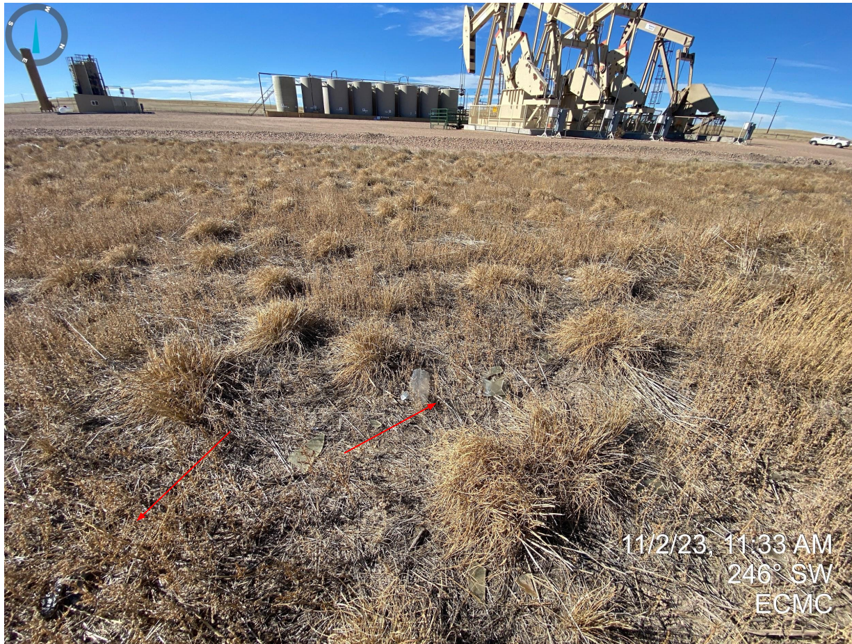
Photo 5. Trash and undesirable vegetation (e.g russian thistle, kochia, and crested wheatgrass) observed throughout the eastern interim areas.