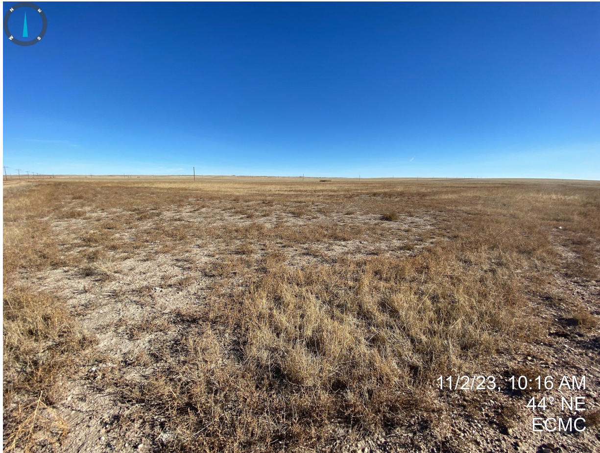
Photo 4. Taken near the southwest corner of the well location. Photo illustrates non-uniform vegetative cover resulting in bare soils and the presence of undesirable weedy vegetation (e.g. kochia and russian thistle).