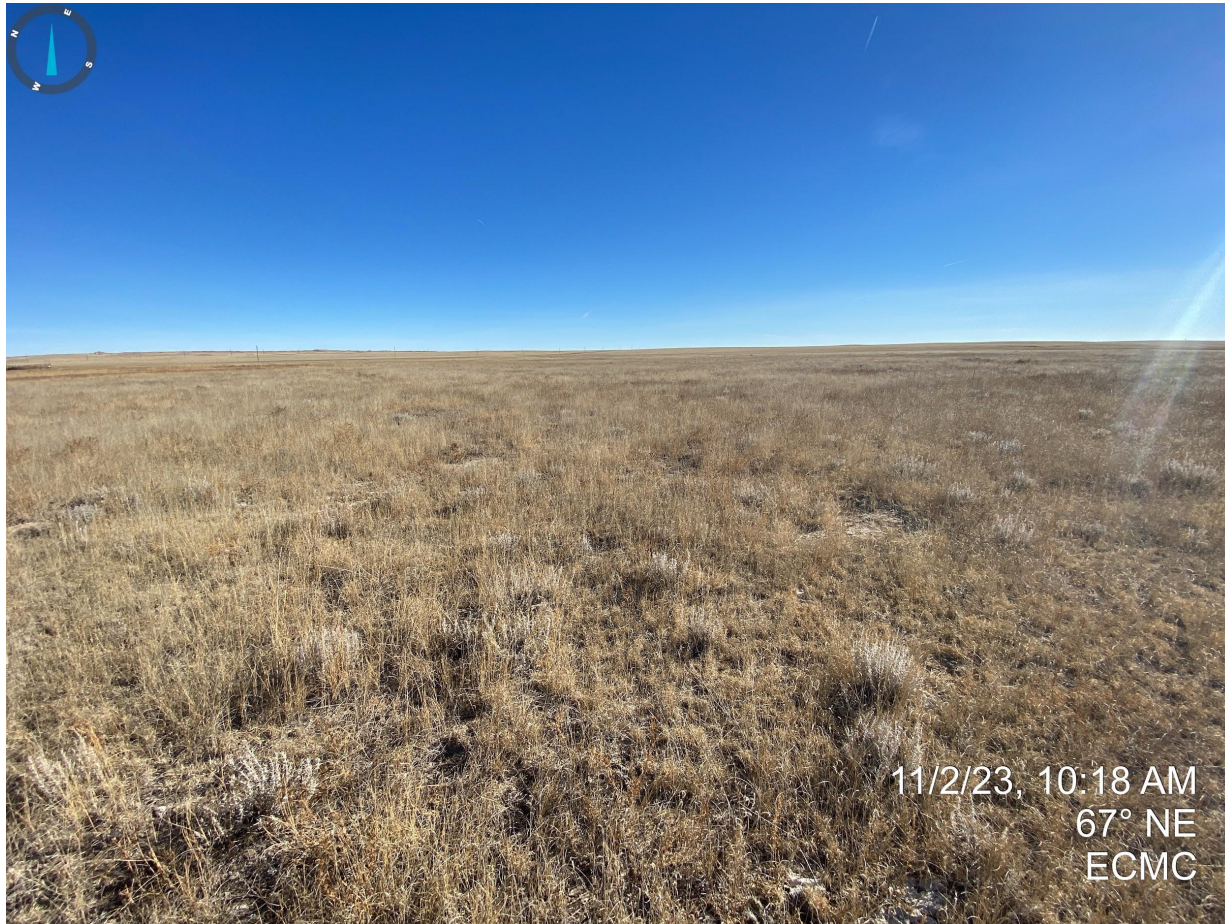
Photo 8. Photo of adjacent reference area taken east of the location. Buffalo grass, blue grama, etc observed.