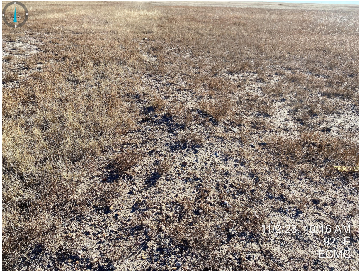
Photo 3. Taken from the southern portion of the well location. Photo illustrates gravel/road base material on location.