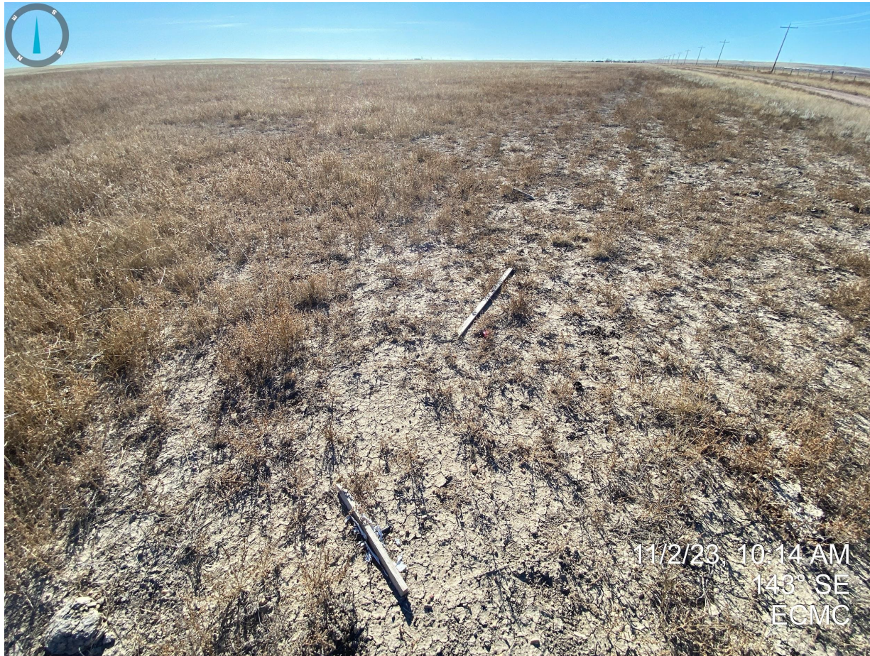
Photo 1. Taken near the northwest corner of the former well location. Photo illustrates debris on location.