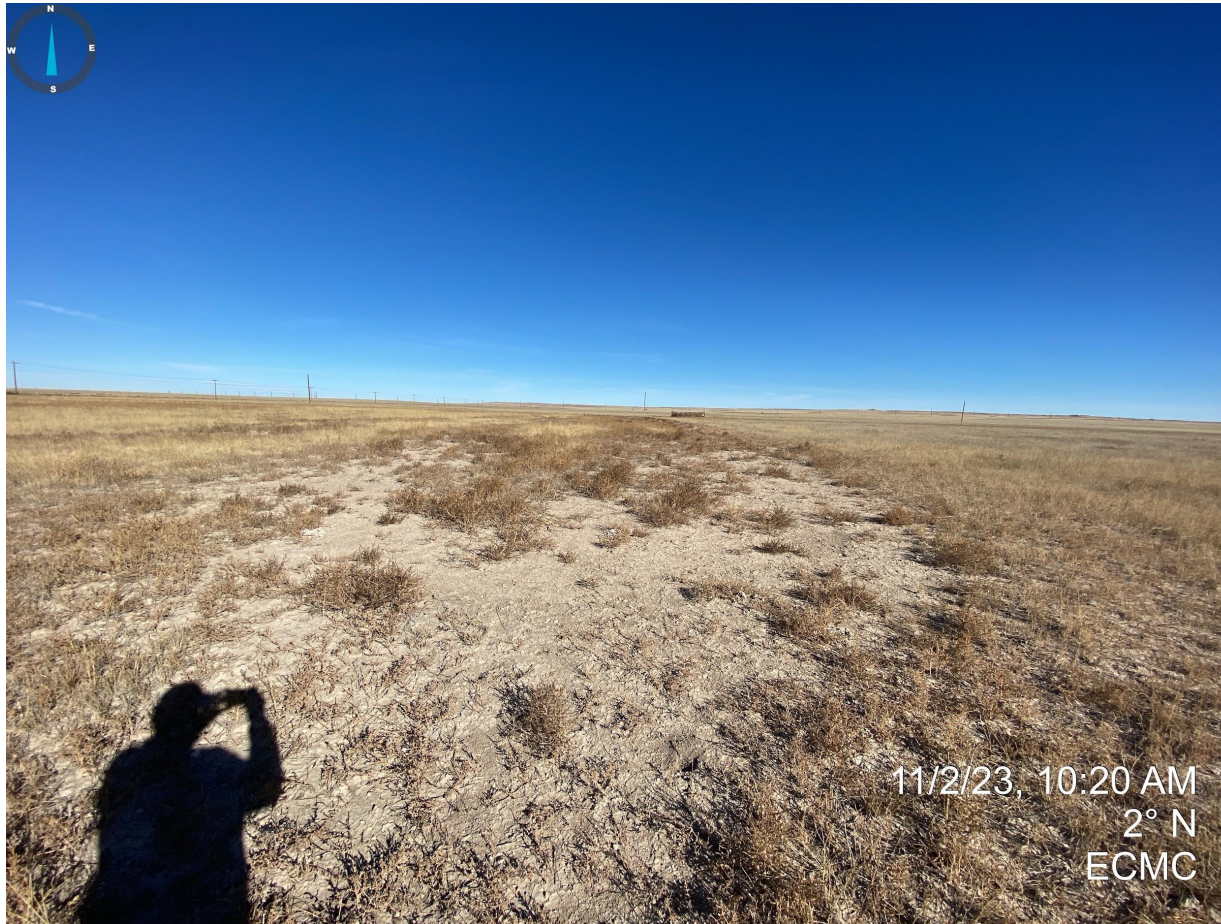
Photo 6. Taken near the southeast corner of the well location (former topsoil stockpile area). Photo illustrates non-uniform vegetative cover resulting in bare soils and the presence of undesirable weedy vegetation (e.g. kochia and russian thistle).