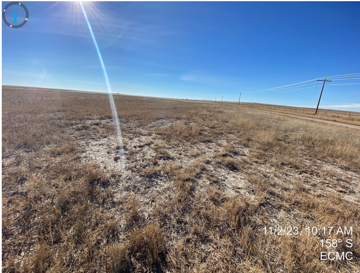
Photo 5. Taken near the northern portion of former tank battery location. Photo illustrates non-uniform vegetative cover resulting in bare soils and the presence of undesirable weedy vegetation (e.g. kochia and russian thistle).