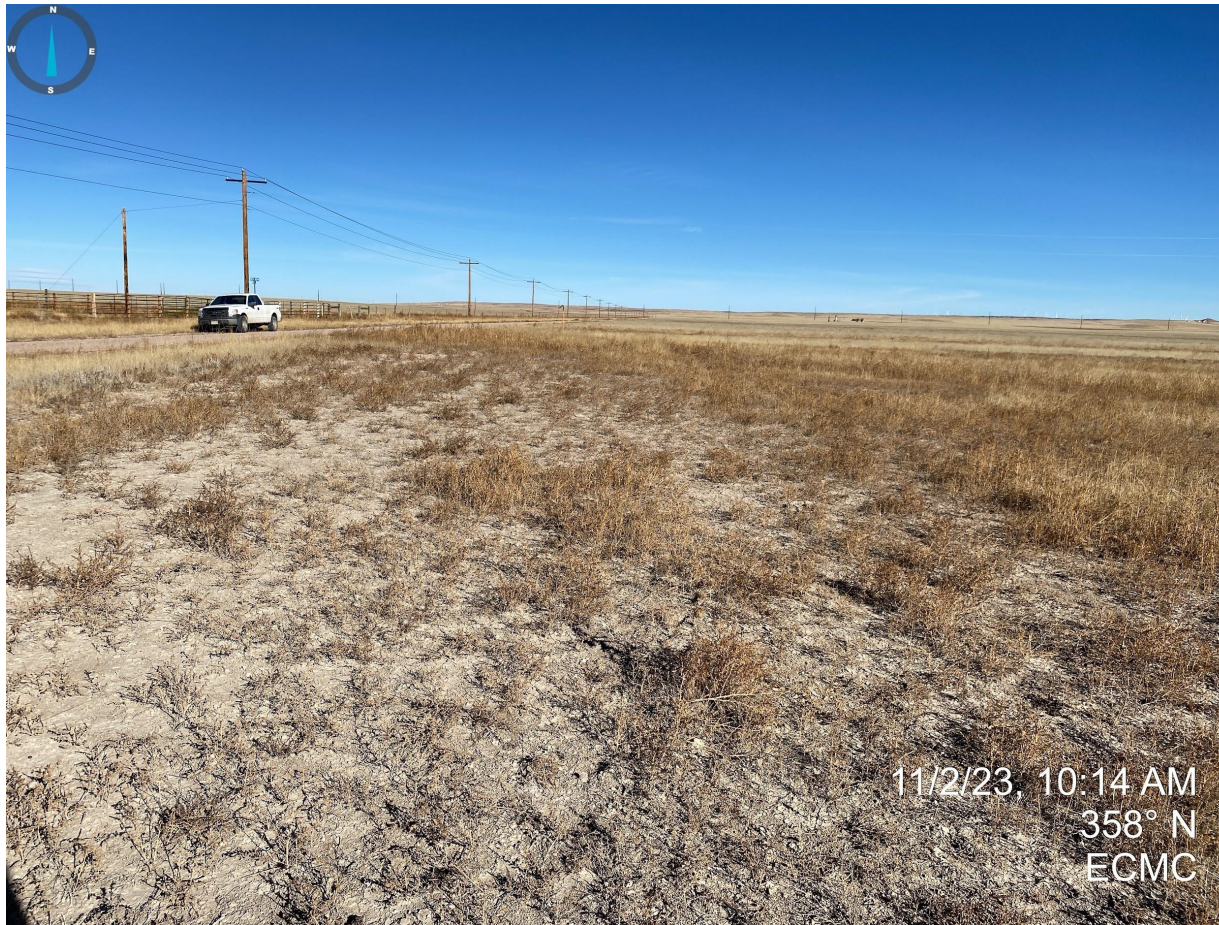
Photo 2. Taken near the northwest corner of the well location. Photo illustrates non-uniform vegetative cover resulting in bare soils and the presence of undesirable weedy vegetation (e.g. kochia and russian thistle).