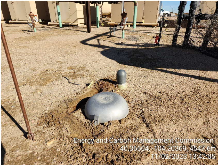
Photo 11 – Condensate Vault – Buried by Sand – Labels no longer visible