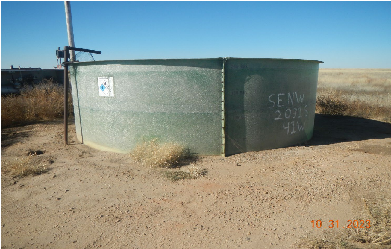
Photo 5. The open top tank does not have secondary containment or proper labeling..