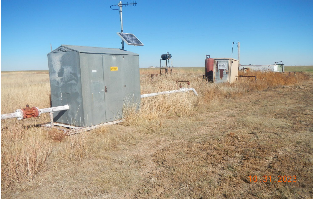
Photo 7. Facing northeast at the offsite meter facility Lat/Long: 37.33139, -102.06825.