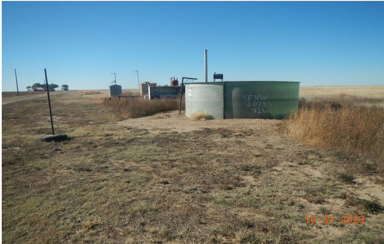
Photo 4. Facing toward offsite facility at Lat/Long:37.33139, -102.06825.