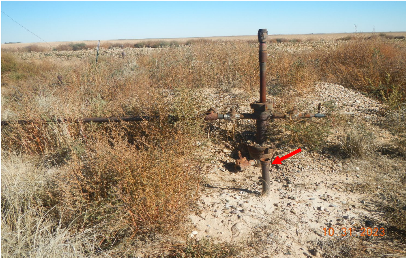
Photo 3. Facing toward the well head. There is a pipe riser at red arrow with no OOSLAT.