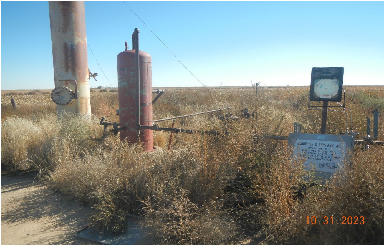
Photo 2. Well sign is posted at the location. There is dry weeds and vegetation around the equipment which is a fire hazard.