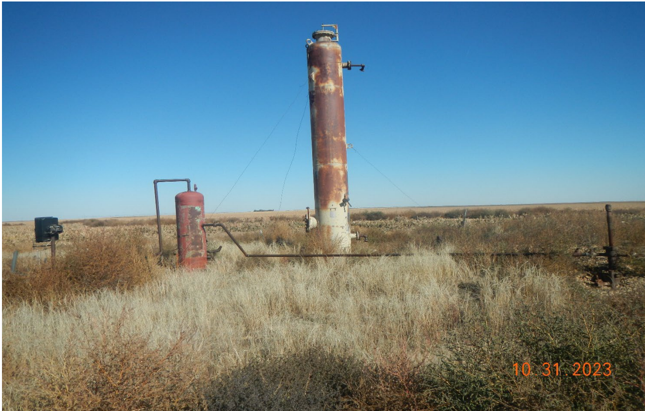
Photo 1. Facing east toward the wellsite. There is dry weeds and vegetation around the equipment which is a fire hazard..