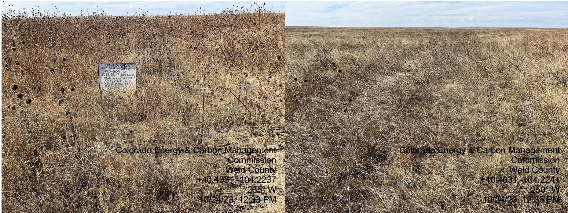
Photo 1. The photo was taken at the well location entrance facing West. The photo illustrates the well location sign.