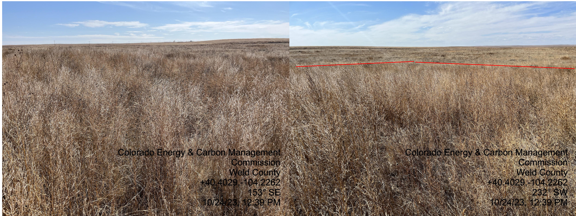
Photo 5. The photo was taken at the well location facing Southeast. See comment on photo 4.