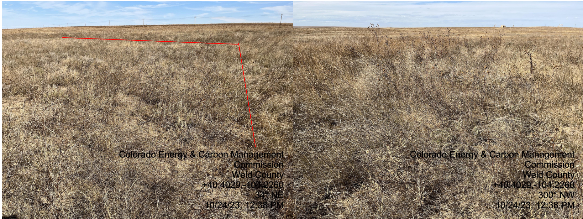
Photo 3. The photo was taken at the well location facing Northeast. The photo illustrates the the cut still apparent along the well location East and North edges.