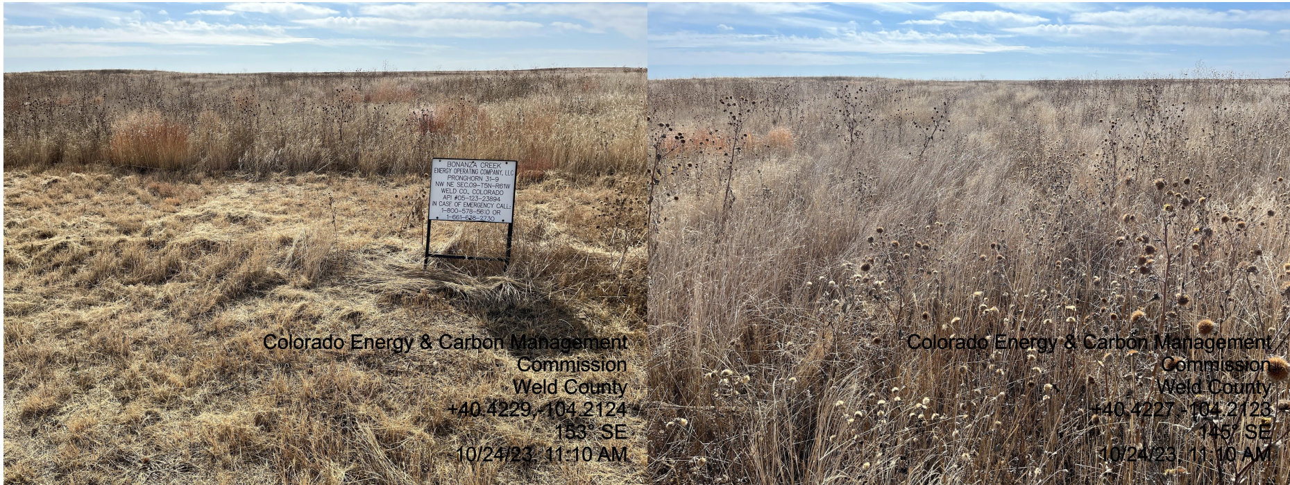
Photo 1. The photo was taken at the entrance to the well location facing Southeast. The photo illustrates the location information sign.