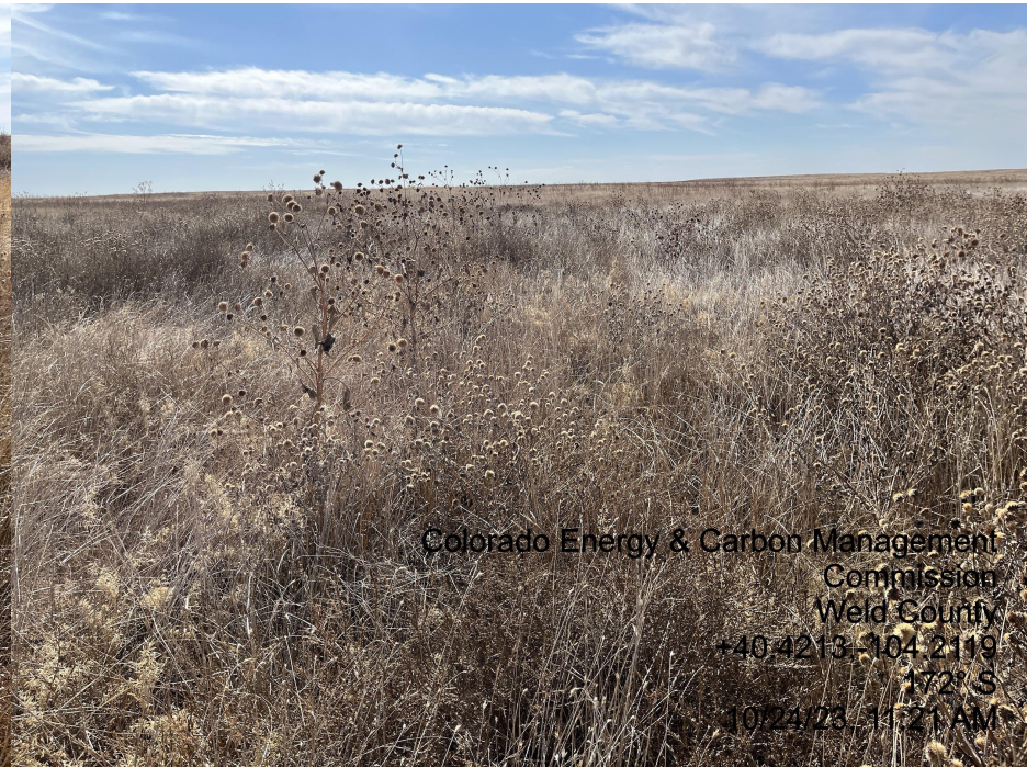
Photo 4. The photo was taken at the well location facing South. The photo illustrates the well location is dominated by russian thistle and cereal rye.