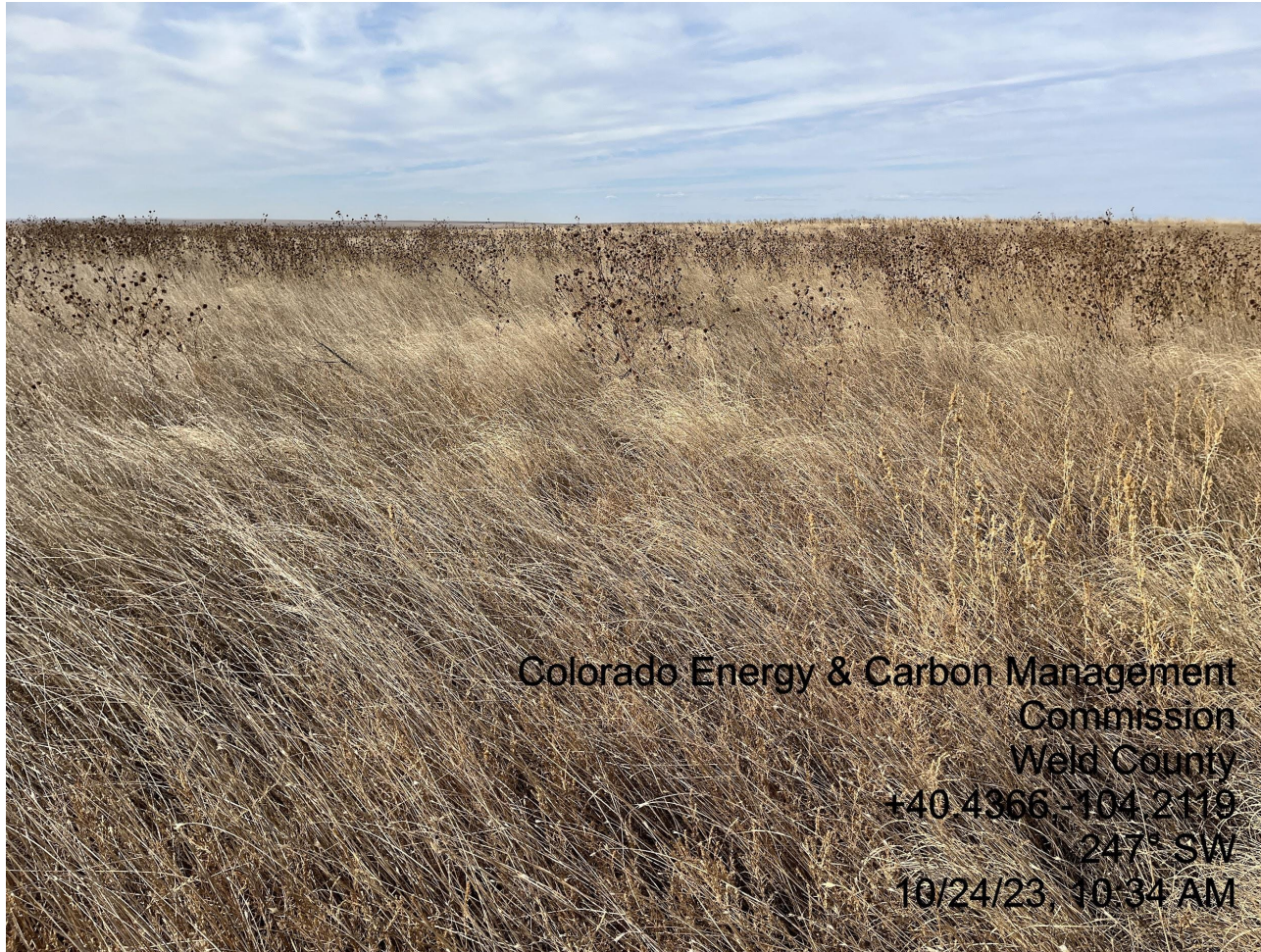
Photo 7. The reference photo was taken South of the well location facing Southwest.