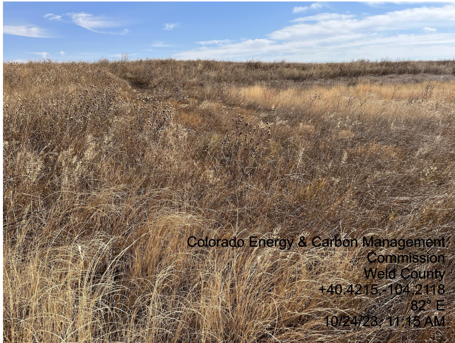
Photo 3. The photo was taken at the well location facing East. The photo illustrates the location is dominated by cereal rye and russian thistle. The photo also illustrates the cut is still apparent on the location.