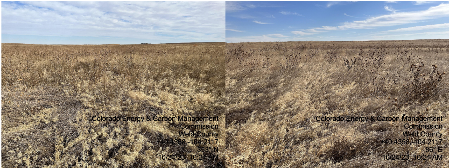
Photo 3. The photo was taken at the well location facing North. The photo illustrates the location is dominated by cereal rye, sunflower, russian thistle and lovegrass.

Photo 4. The photo was taken at the well location facing East. See the comment for photo 3.