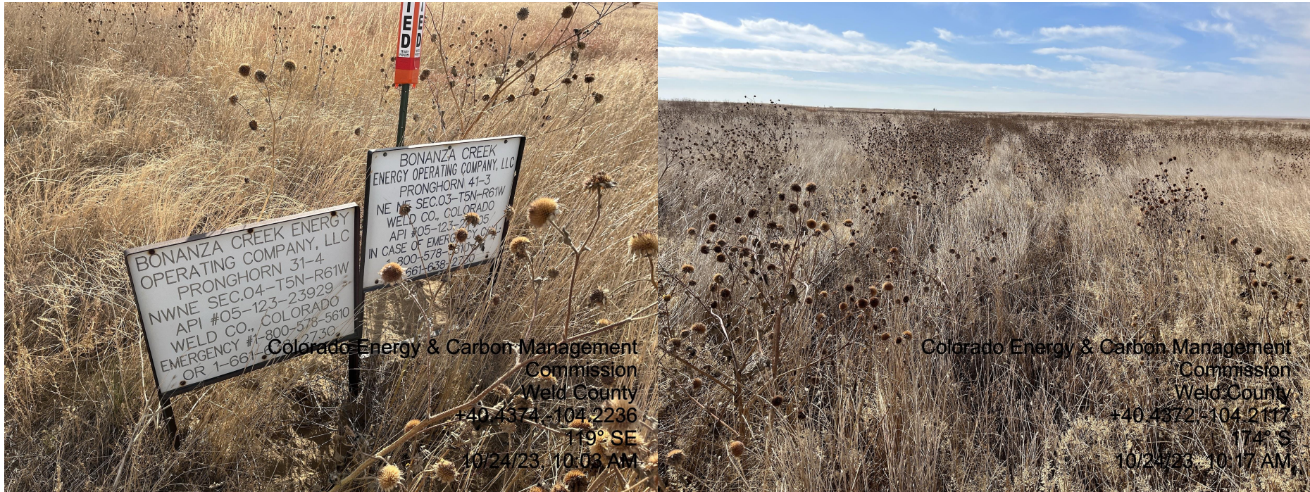
Photo 1. The photo was taken at the intersection of CR 89 and the main access road facing Southeast. The photo illustrates the location information sign.

Photo 2. The photo was taken at the entrance to the well location facing South. The photo illustrates the location access road.