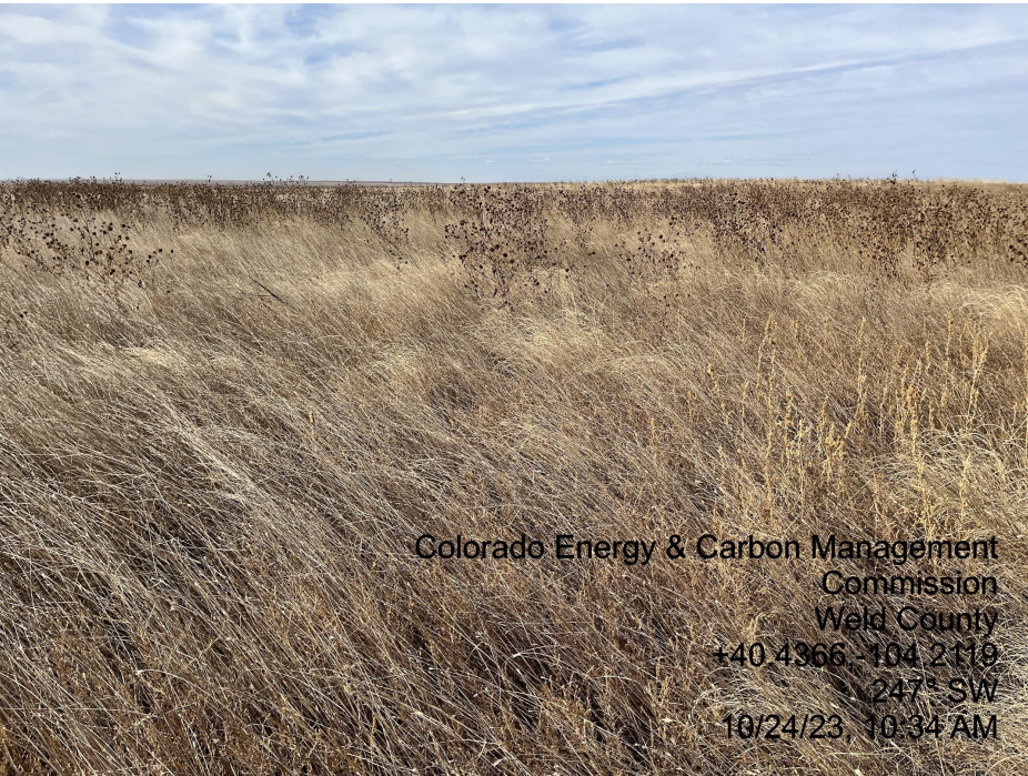
Photo 8. The reference photo was taken at the west of the access road facing Southwest.