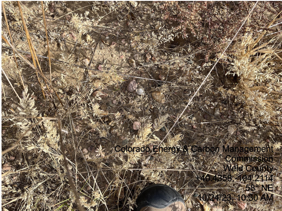
Photo 7. The photo was taken at the well location facing Northeast. The photo illustrates gravel still on location.