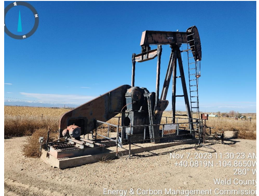
Photo 2 well head and equipment