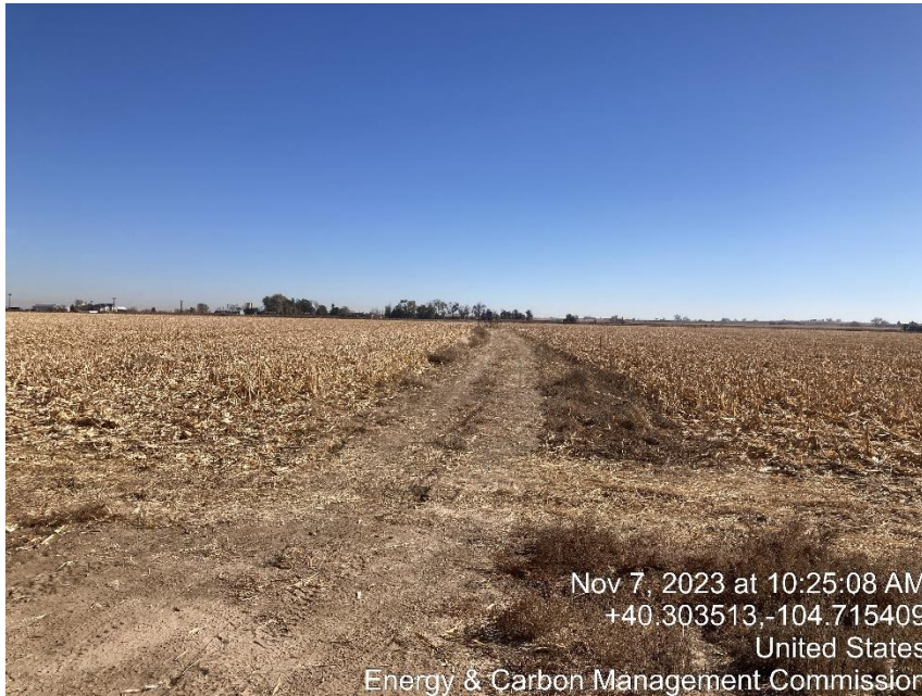
Entrance to location