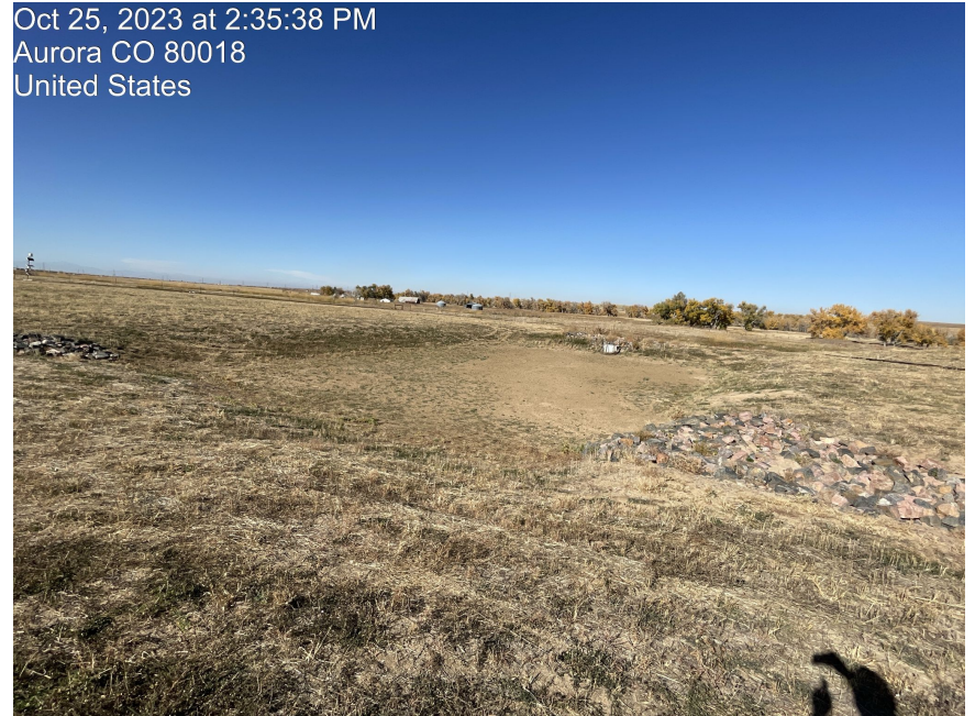
Photo 11. Photo taken of large sediment basin and rock rundowns. Photo taken facing north.

Oct 25, 2023 at 2:35:38 PM Aurora CO 80018 United States