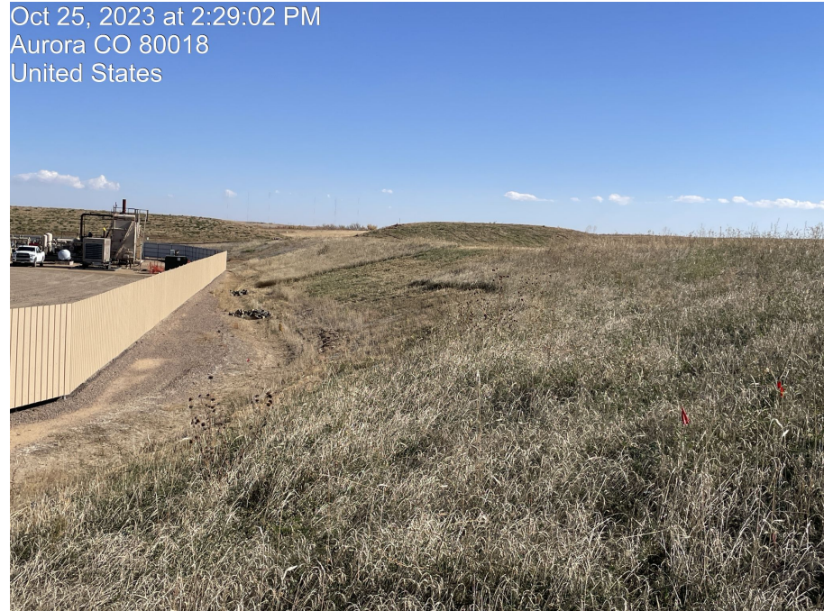
Photo 6. Photo taken of interim reclamation area. Photo taken facing northwest.

Oct 25, 2023 at 2:29:02 PM Aurora CO 80018 United States