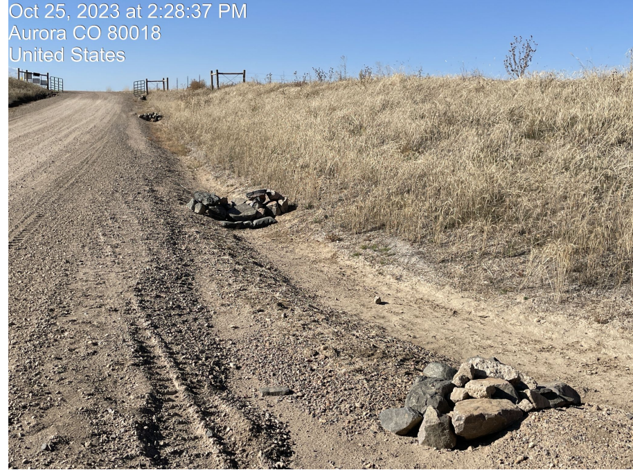
Photo 4. Photo taken of drainage and rock check dams, along access road. Photo taken facing Northwest.

Oct 25, 2023 at 2:28:37 PM Aurora CO 80018 United States