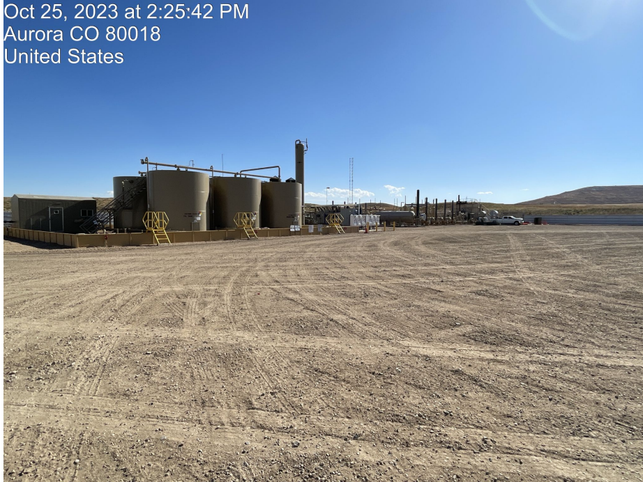
Photo 3. Photo taken of tank battery on pad. Photo taken facing northwest.

Oct 25, 2023 at 2:25:42 PM Aurora CO 80018 United States