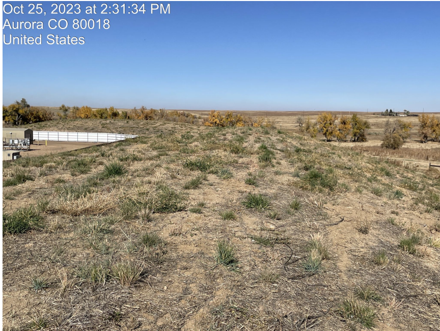
Photo 9. Photo taken of mowed interim reclamation area. Photo taken facing northwest.

Oct 25, 2023 at 2:31:34 PM Aurora CO 80018 United States