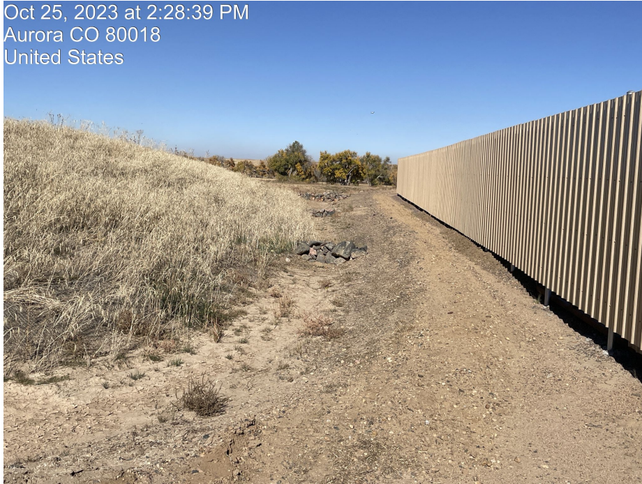
Photo 5. Photo taken of interim reclamation area and drainage with large rock check dams . Photo taken facing east.

Oct 25, 2023 at 2:28:39 PM Aurora CO 80018 United States