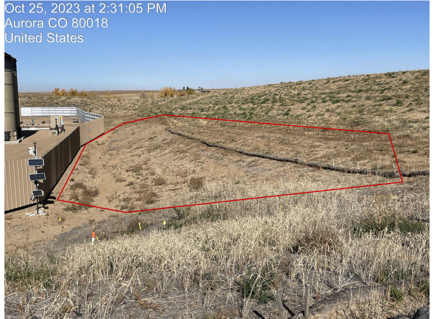
Photo 8. Photo taken of mowed re-vegetated cut slope. Lower portion of cut slope does not appear to be moving toward revegetation standards. reseed with stabilization needed. Photo taken facing northeast. Area outlined in red.

Oct 25, 2023 at 2:31:05 PM Aurora CO 80018 United States