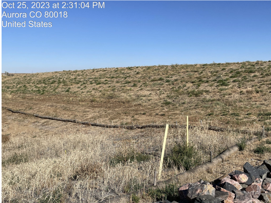
Photo 7. Photo taken of mowed re-vegetated cut slope. Photo taken facing northeast.

Oct 25, 2023 at 2:31:04 PM Aurora CO 80018 United States