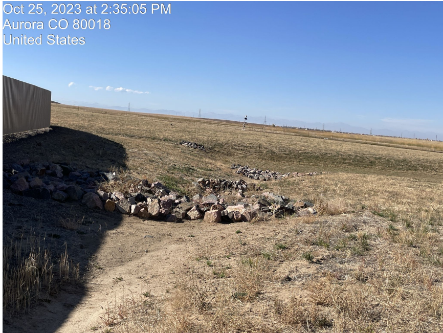
Photo 10. Photo taken of rock check dams leading to large sediment basin. Photo taken facing west.

Oct 25, 2023 at 2:35:05 PM Aurora CO 80018 United States