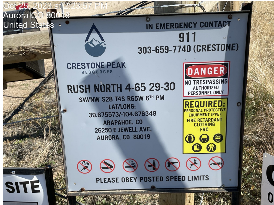
Photo 1. Photo taken of location sign at wellhead, facing east.