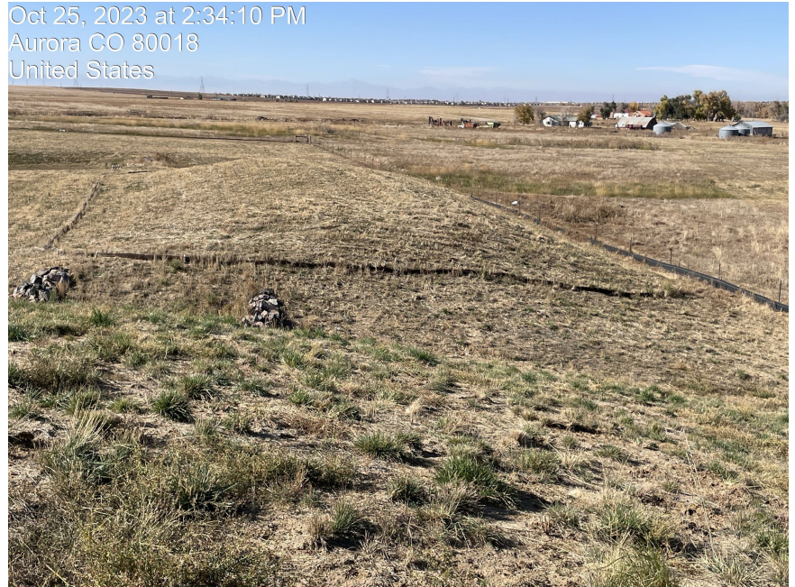
Photo 10. Photo taken of mowed interim reclamation area and topsoil stockpile outlined with wattles. . Photo taken facing west.

Oct 25, 2023 at 2:34:10 PM Aurora CO 80018 United States