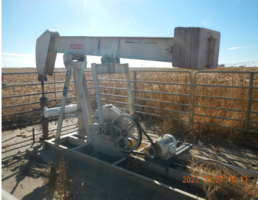
3. Pump Jack.