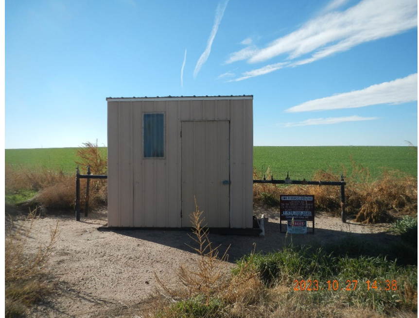
8. Remote gas meter location overview.