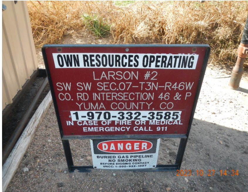
5. Well sign at remote gas meter location.