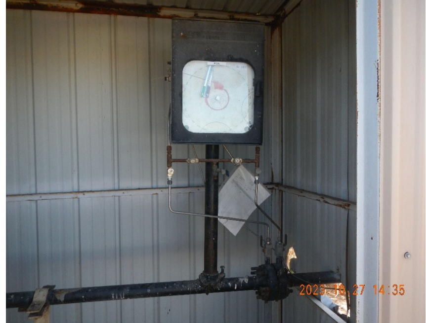
6. Gas meter.