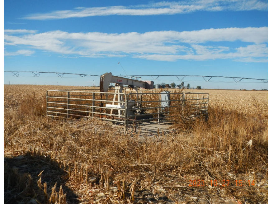
4. Well site location overview.