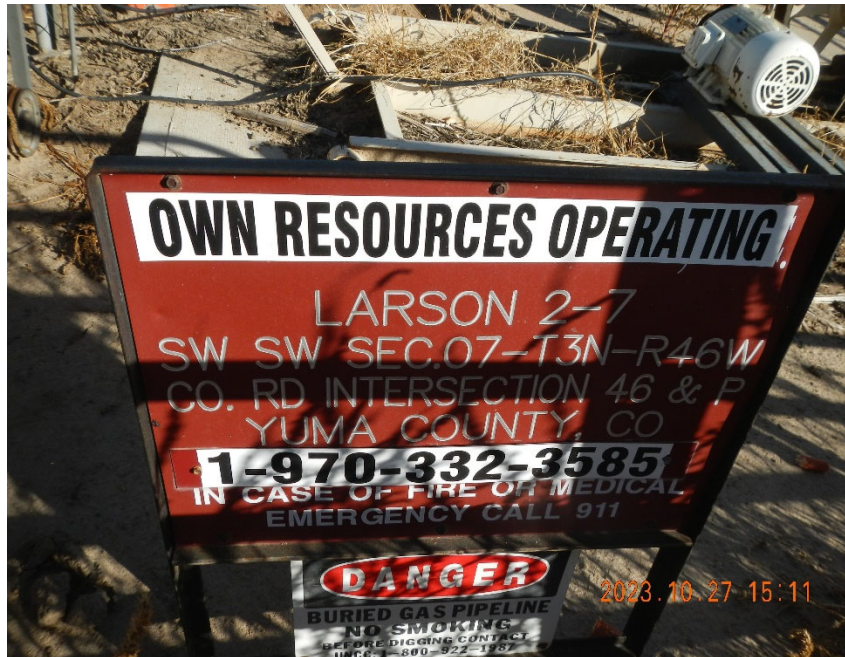
1. Well sign at well location.