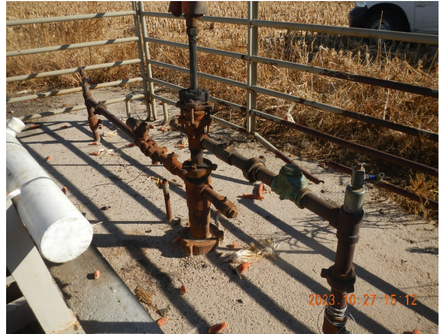
2. View of wellhead.