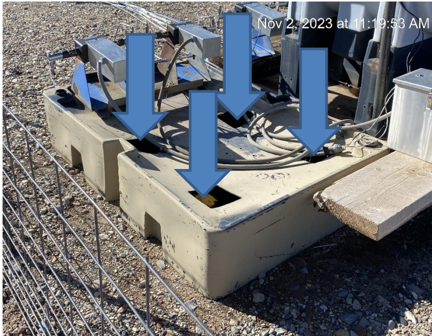
Open to wildlife