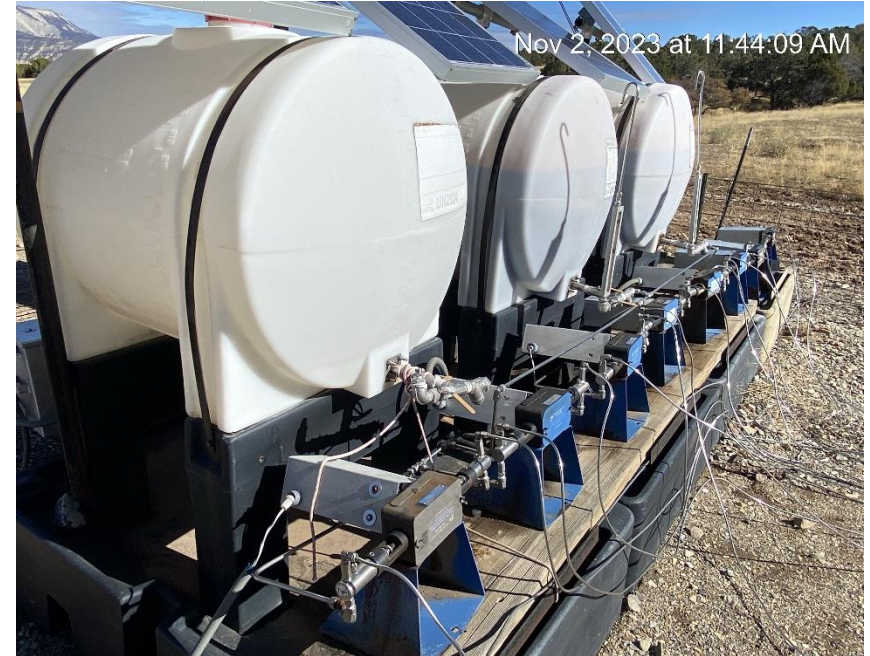
Tank disconnected and label illegible