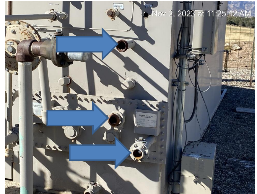
Open to wildlife