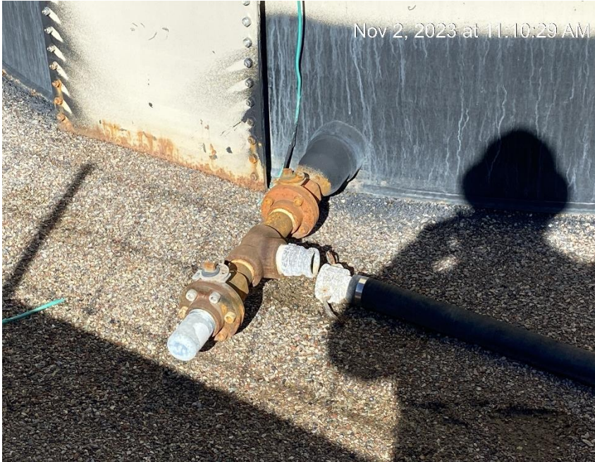
Open end loadline