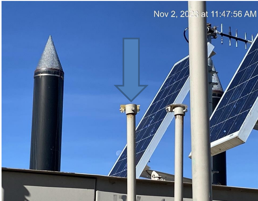
Damaged rain cap