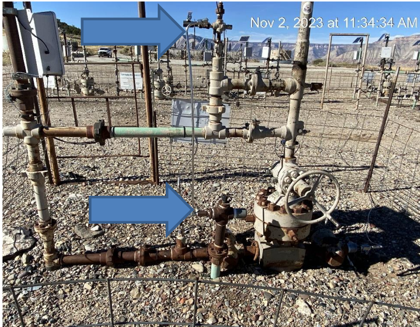
Bradenhead connected to flowline