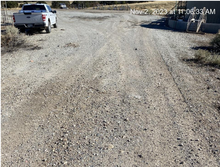
Location from Northwest corner. Entrance to location.