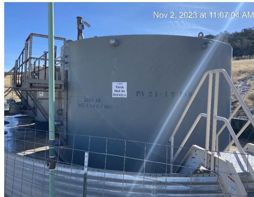
Unused equipment on location