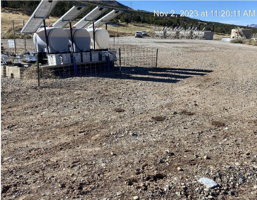
Location from Southeast corner