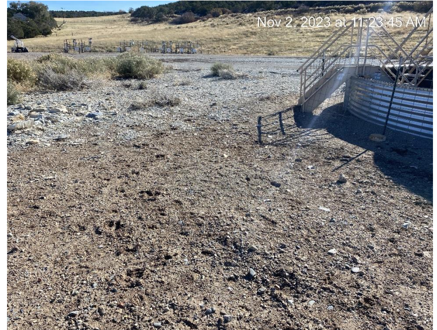
Location from Northeast corner