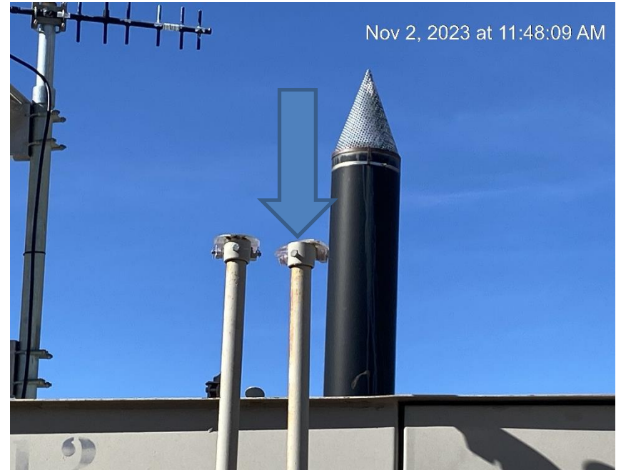
Damaged rain cap