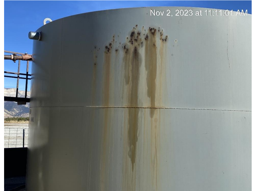
Condensate tank leaking.