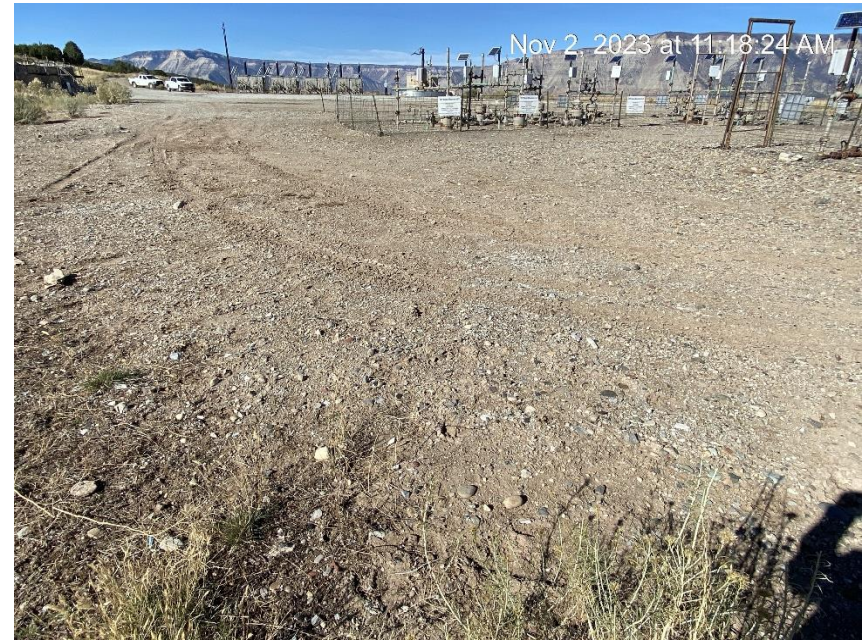
Location from Southwest corner