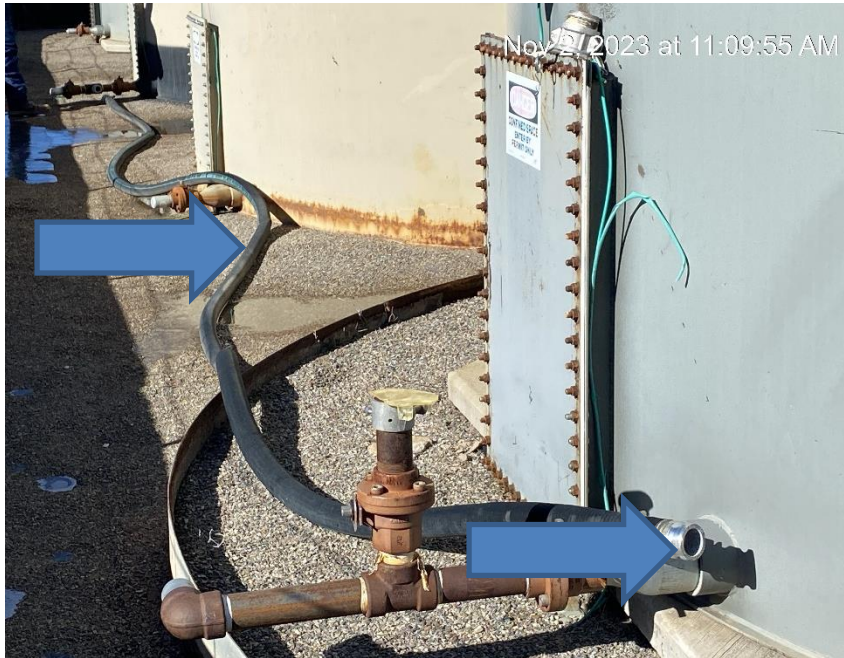
Debris. Open to wildlife.