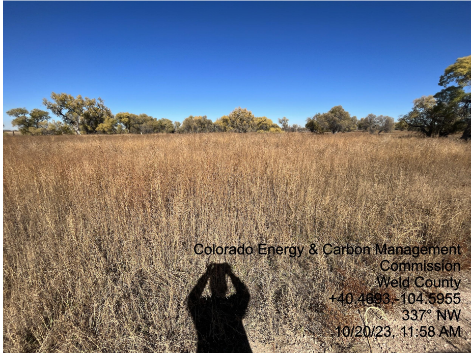
Photo 3. The photo was taken at the Southeast corner of the well location entrance facing Northwest. The photo illustrates the location dominated by kochia.