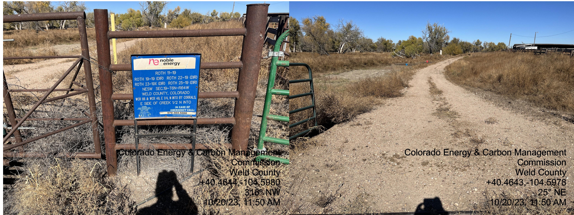
Photo 1. The photo was taken at the well location entrance facing Northwest. The photo illustrates the location information sign that shall be removed by the Operator.