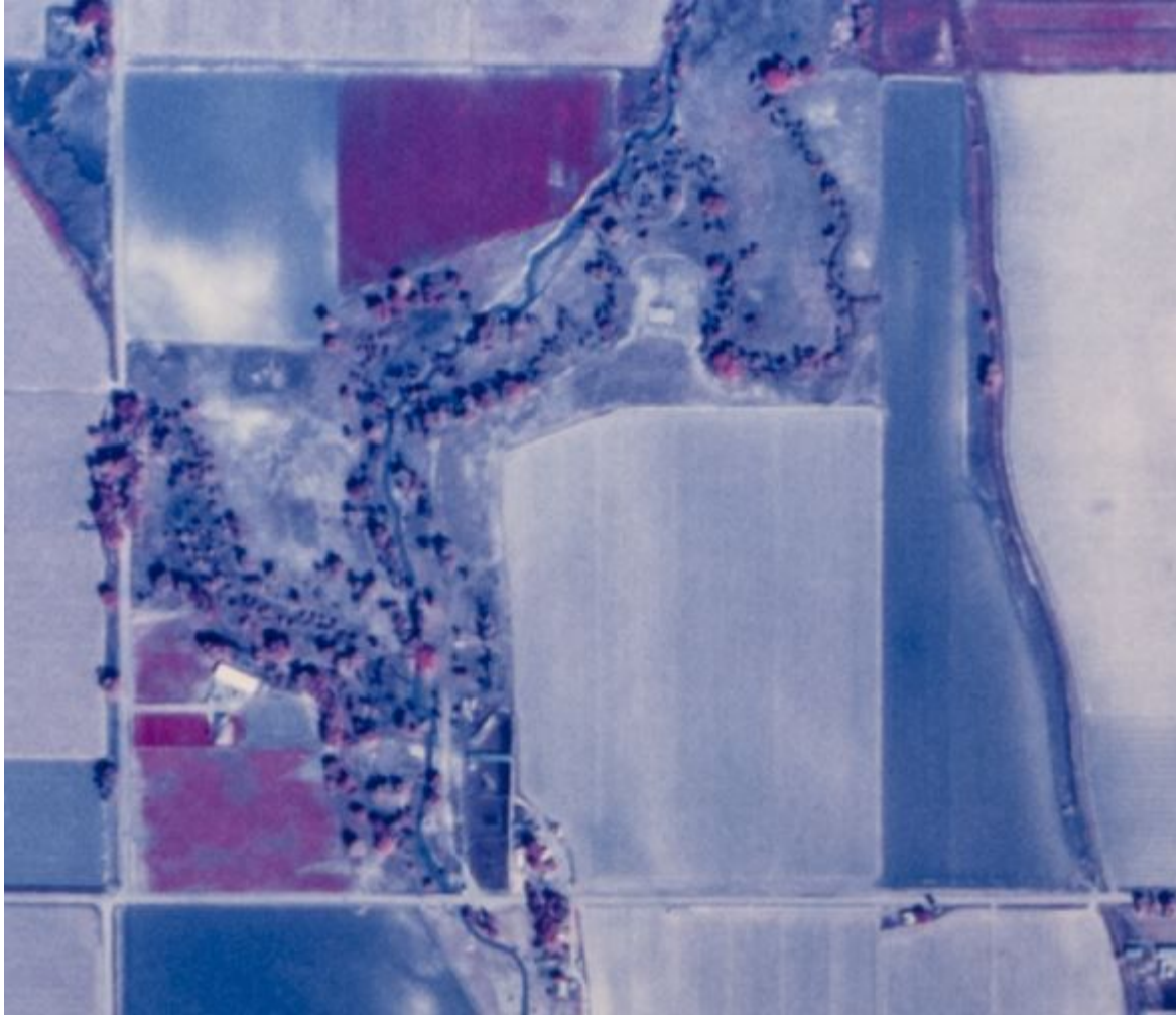
Photo 7. Historic aerial imagery from 10/13/1984, illustrating there was a pre-existing road prior to oil and gas development.