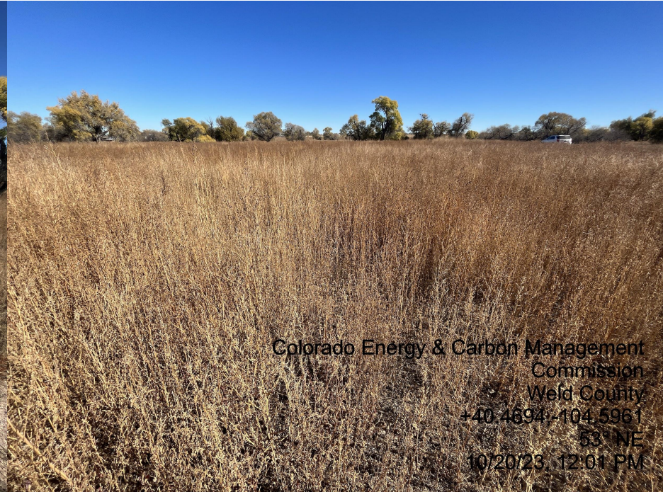
Photo 4. The photo was taken from the West side of the well location entrance facing Northeast. See comment for photo 2.