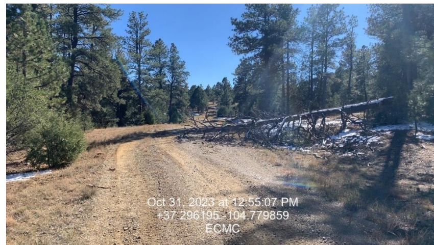
Photo 3 – Pit Form 15 Filed for facility, Doc# 403544553