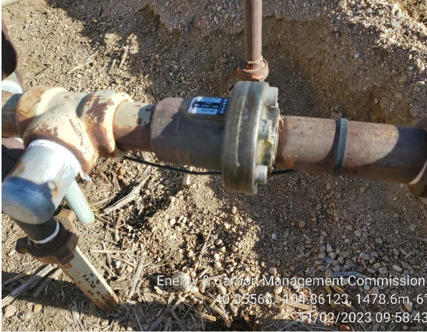
Check valve leak