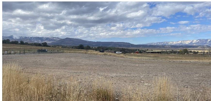
South East corner of location.