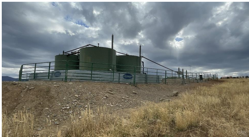
North West corner of location.