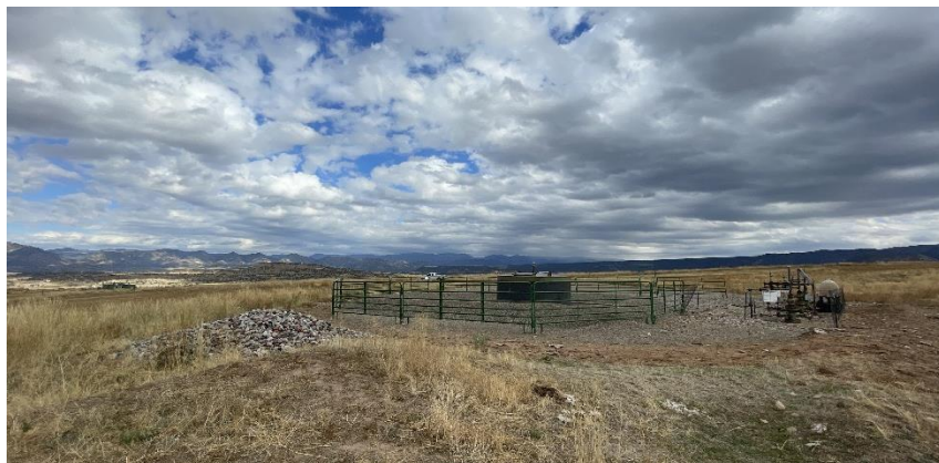
South West corner of location.