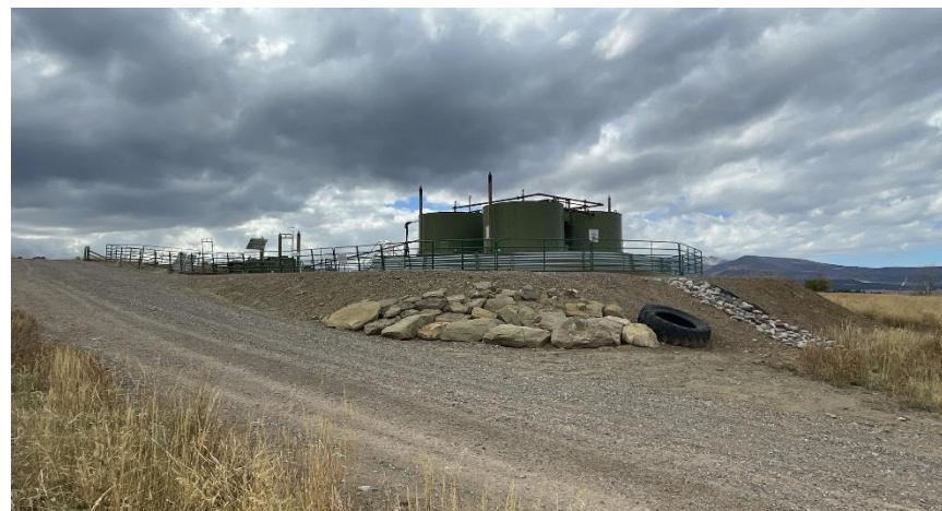
North East corner of location.