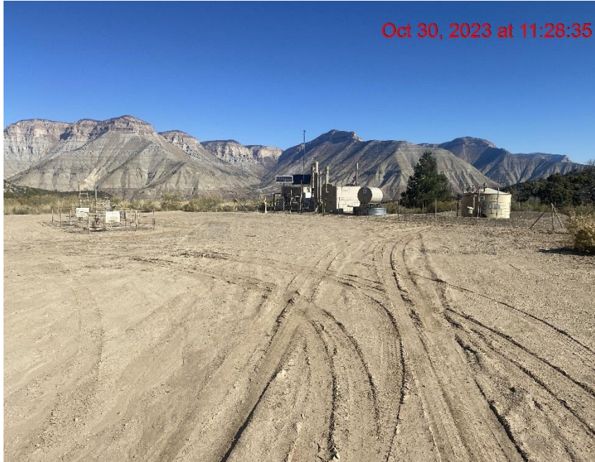
Location Entrance – Photo #07203