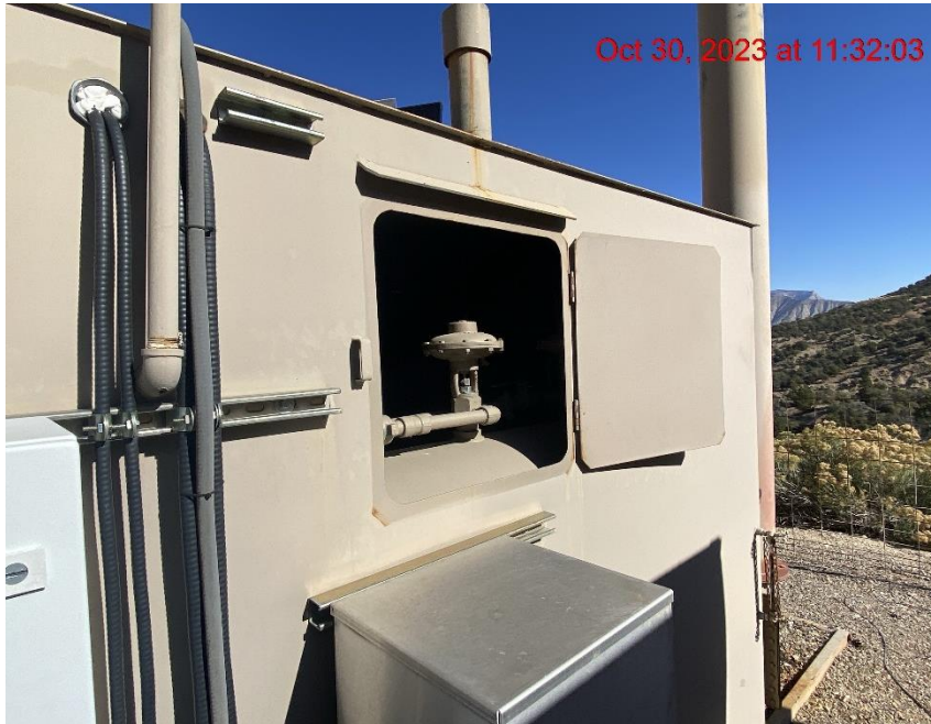
Unsecured Hatch on Separator – Photo #07210