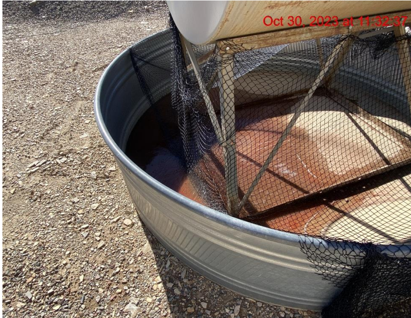
Wildlife Protective Netting Needs Repair – Photo #07212