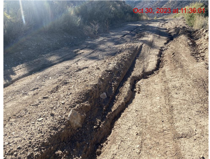
Insufficient Erosion Controls on Lease Road – Photo #07218