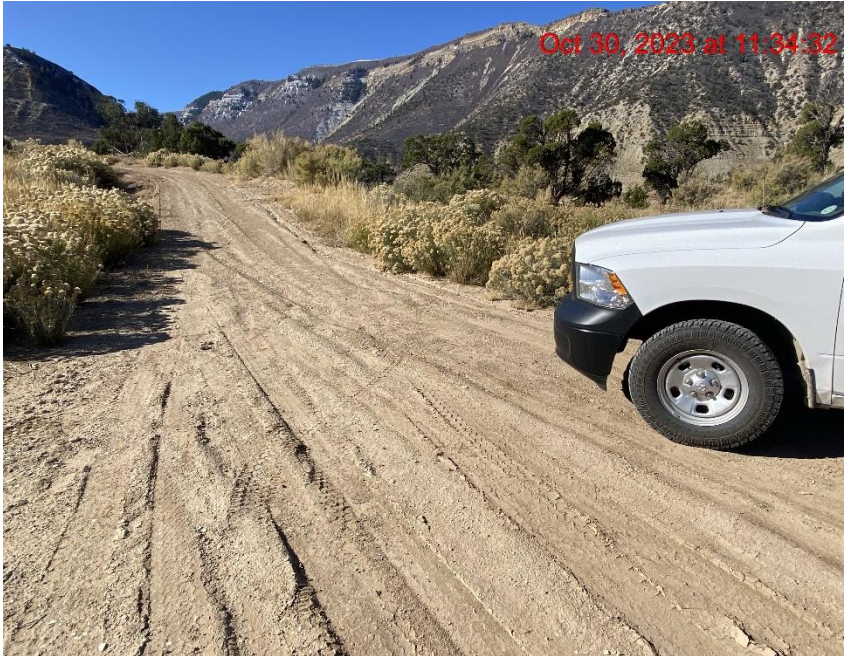
Insufficient Vehicle Tracking BMPs at Location Entrance/Exit – Photo #07217