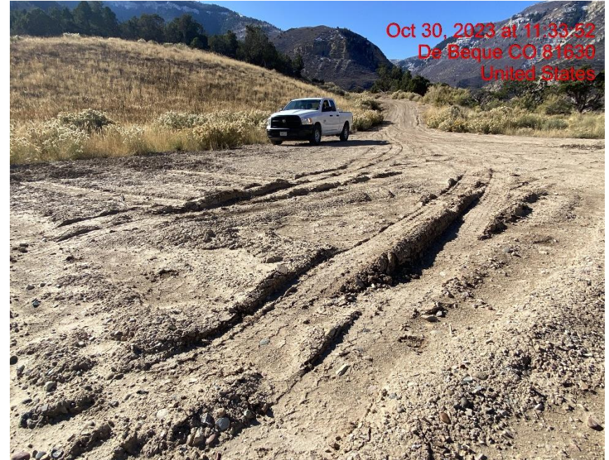
Lack of Stabilization – Photo #07216