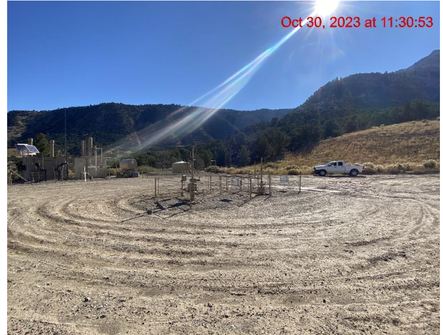
NW Corner of Location – Photo #07205