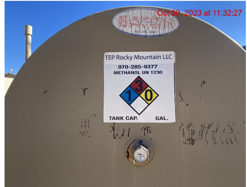
Methanol Tank Capacity Not Posted – Photo #07211