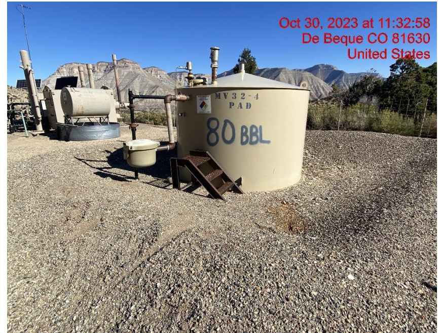
Tank Battery – Photo #07213