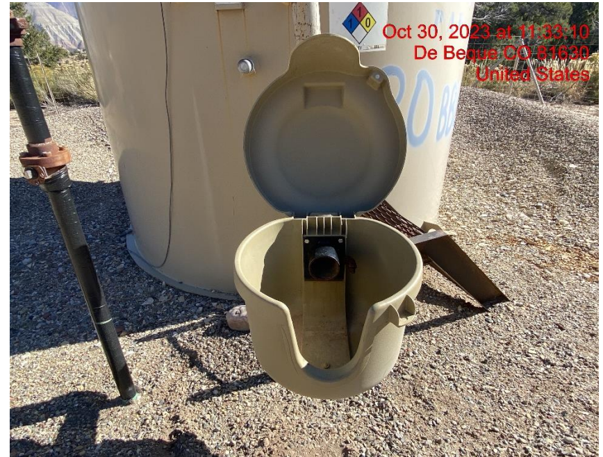
Open-Ended Load Line – Photo #07214