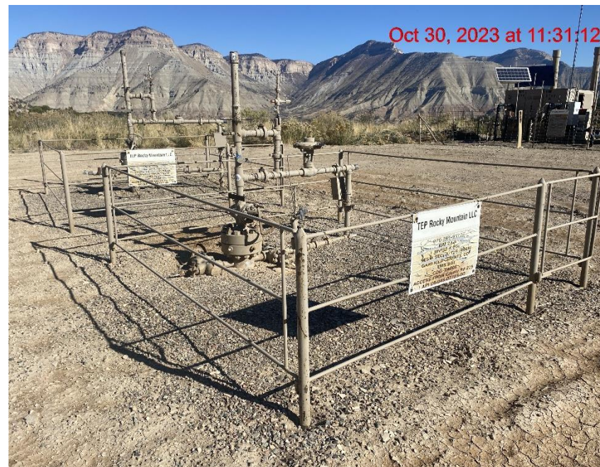
Wellheads – Photo #07206