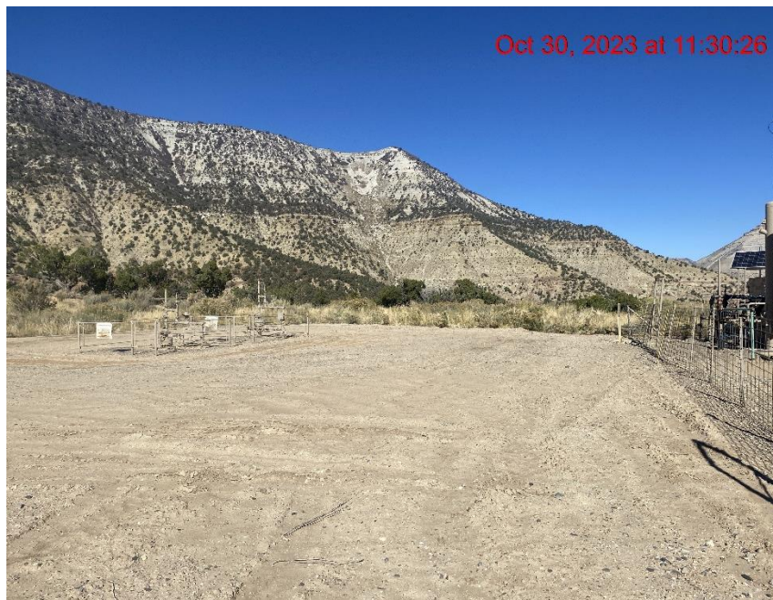
SE Corner of Location – Photo #07204