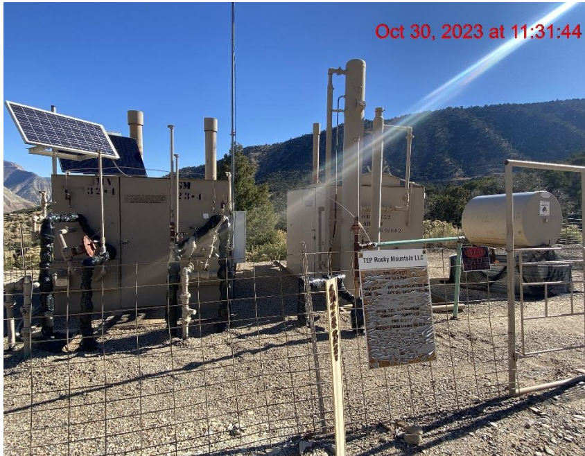
Separators – Photo #07208