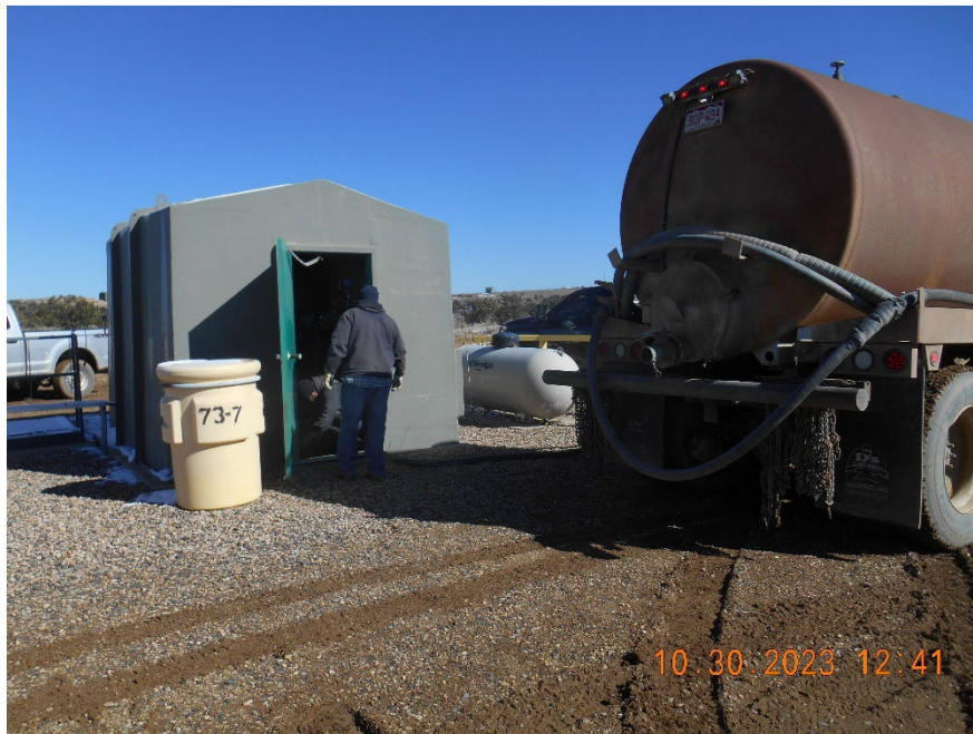
Injection well during MIT