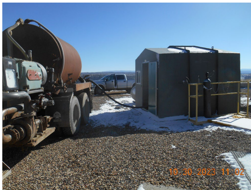
Injection well during MIT