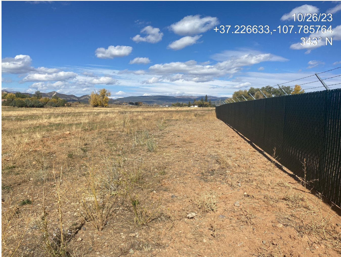
Photo 3. View of the western interim reclamation area facing north.