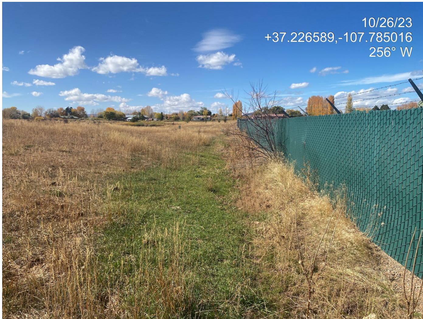
Photo 2. View of the southern reclamation area facing west.

Inspection Photos Location Name: Clark 7-2 Location ID: 333643