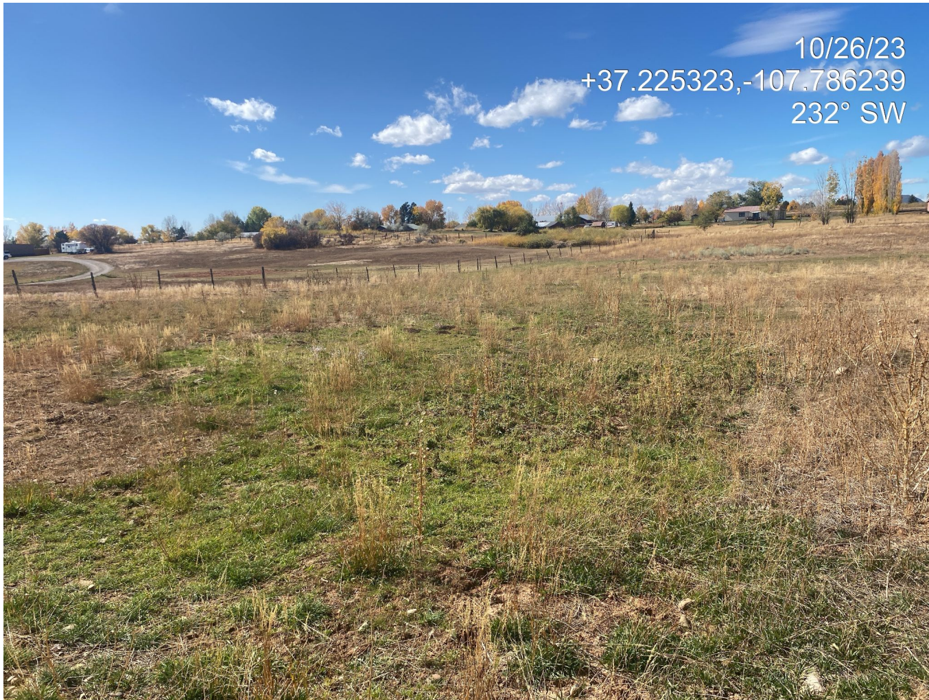
Photo 4. Reference area comprised of smooth brome.

Inspection Photos Location Name: Clark 7-2 Location ID: 333643