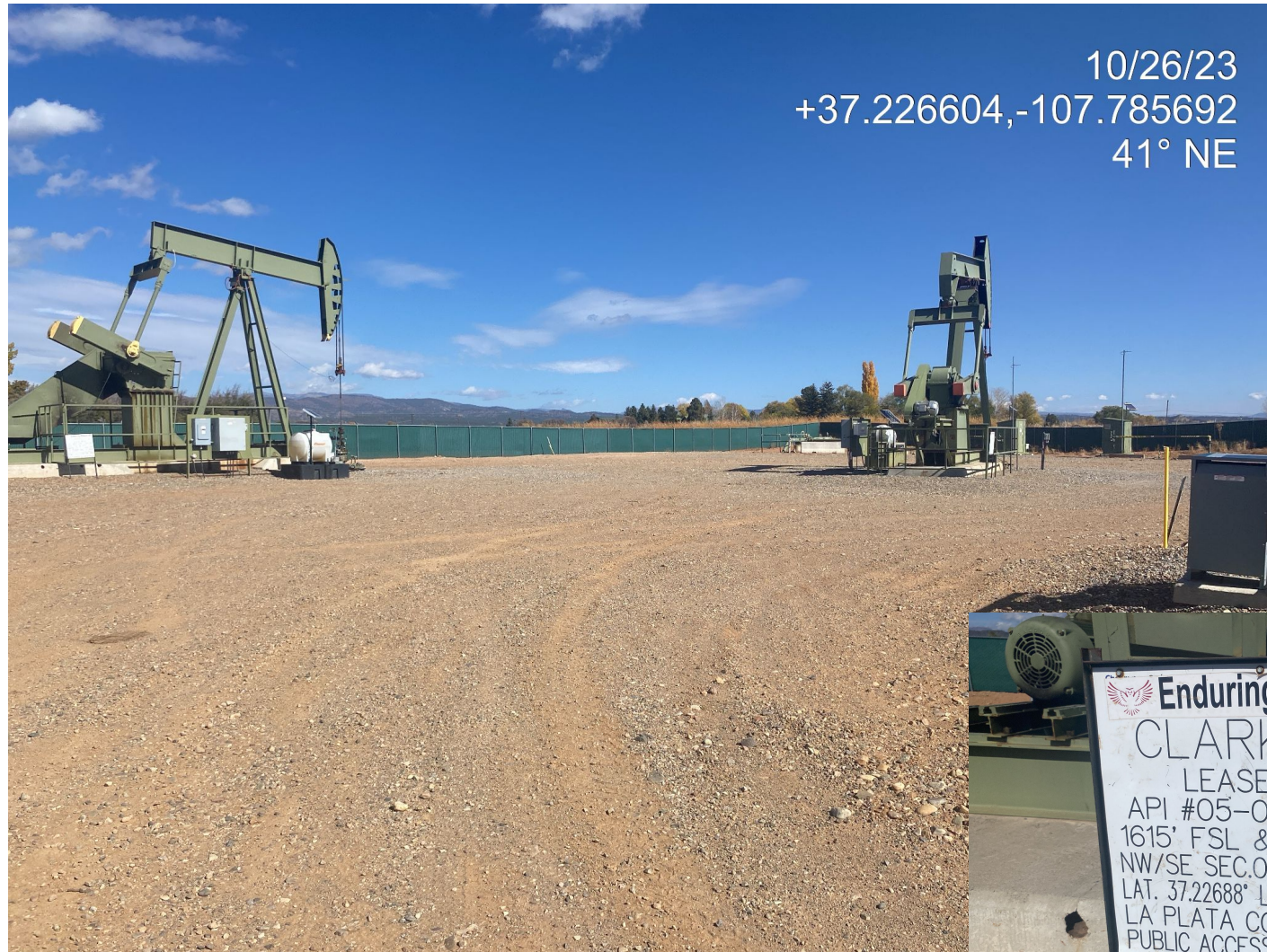
Photo 1. View of the well disturbance taken from the entrance facing center.

Inspection Photos Location Name: Clark 7-2 Location ID: 333643