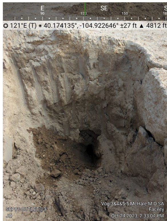
Separator Outlet Excavation