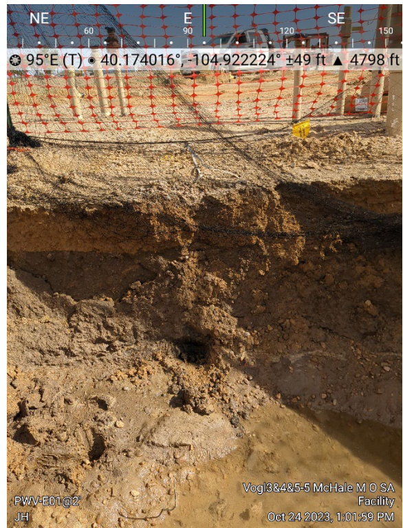
PWV Excavation (Groundwater present in excavation)