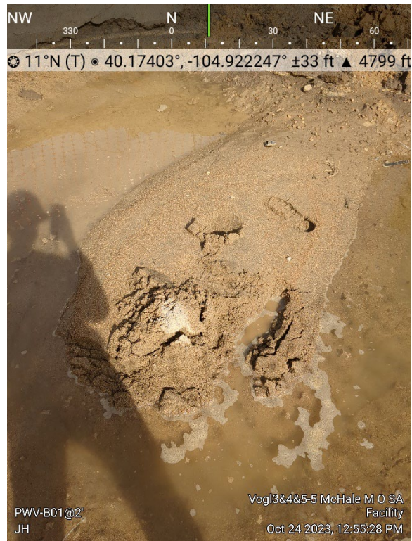
PWV Excavation (Groundwater present in excavation)