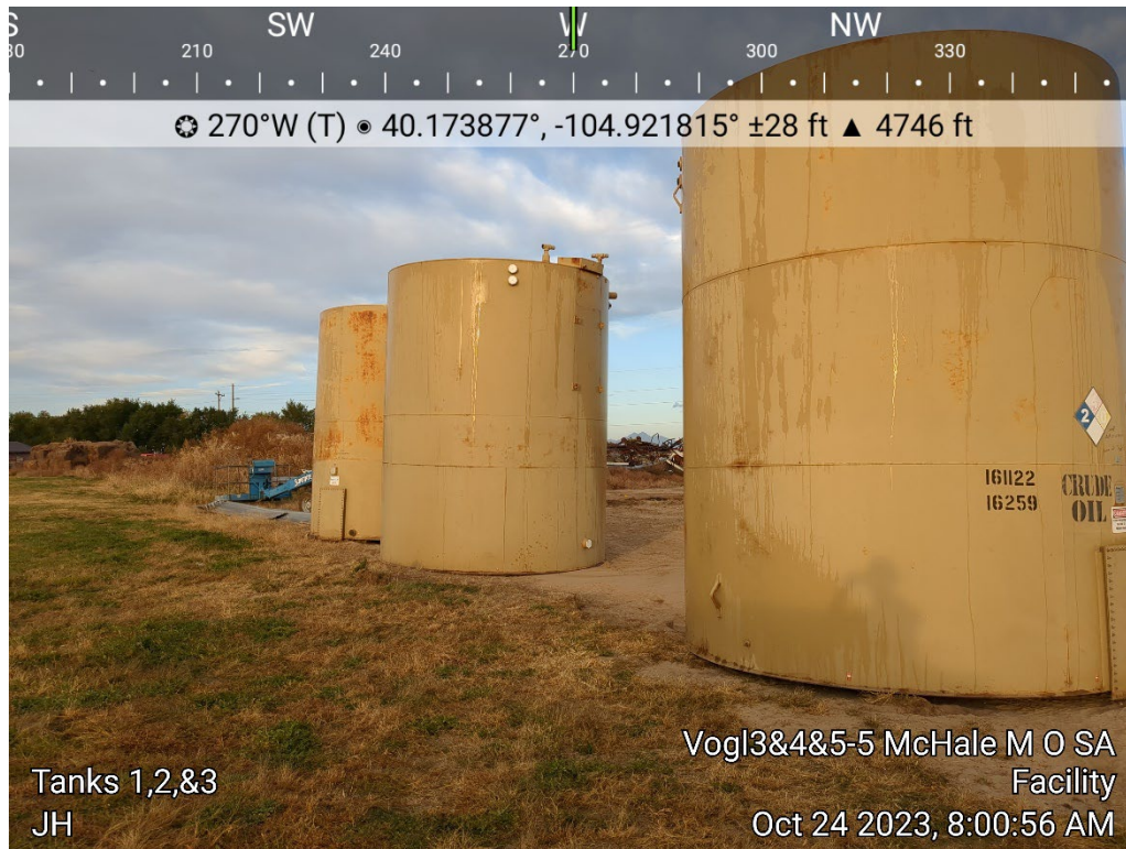
Aboveground Storage Tanks (ASTs)