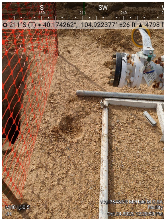
Meter House Sample Location