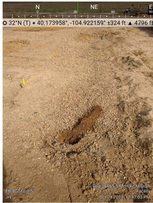
Background Sample Location