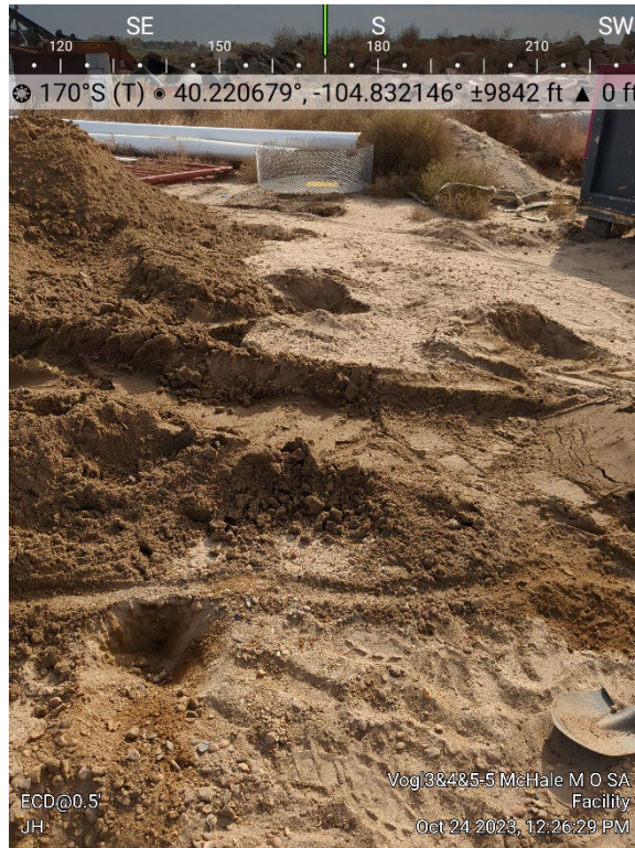
ECD Sample Location