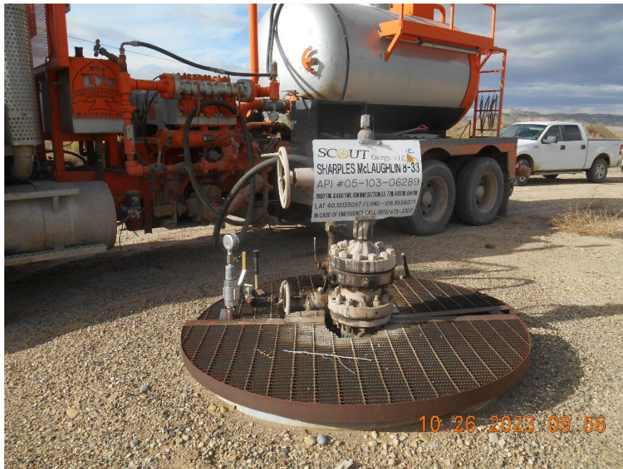
Injection well during MIT

Inspection Date: 10/26/2023 Inspection Doc#: 693806501