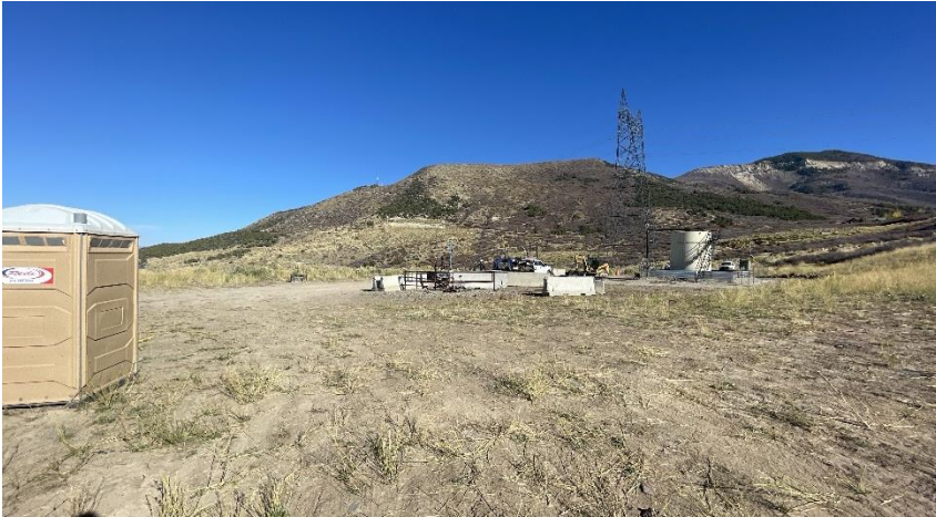
North West corner of location.