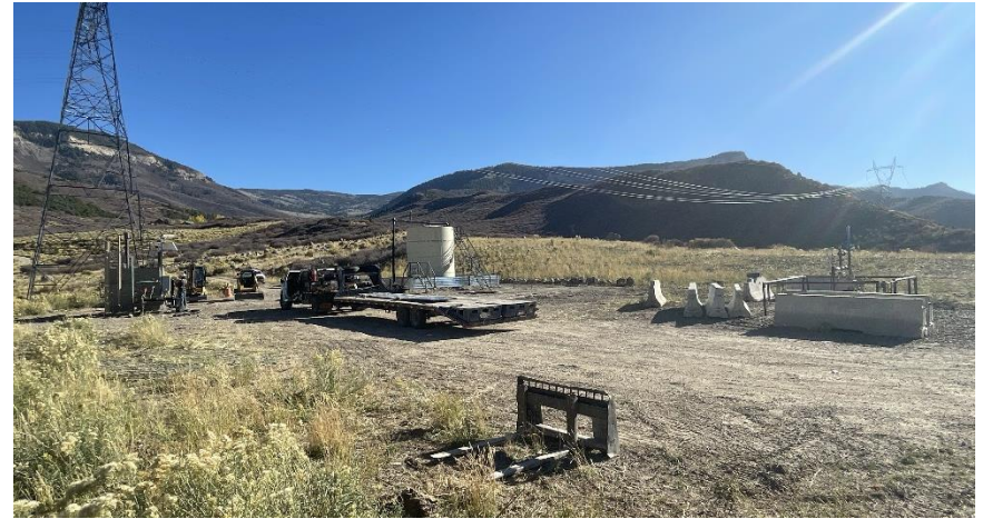
North East corner of location.