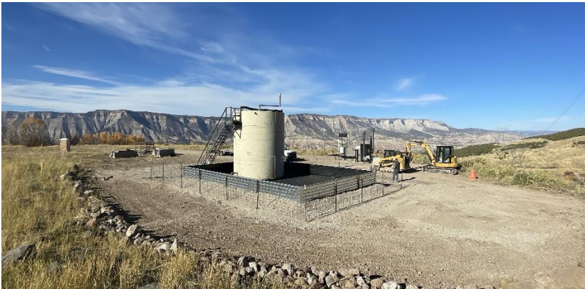
South West corner of location.