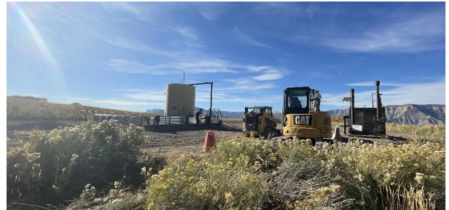
South East corner of location.