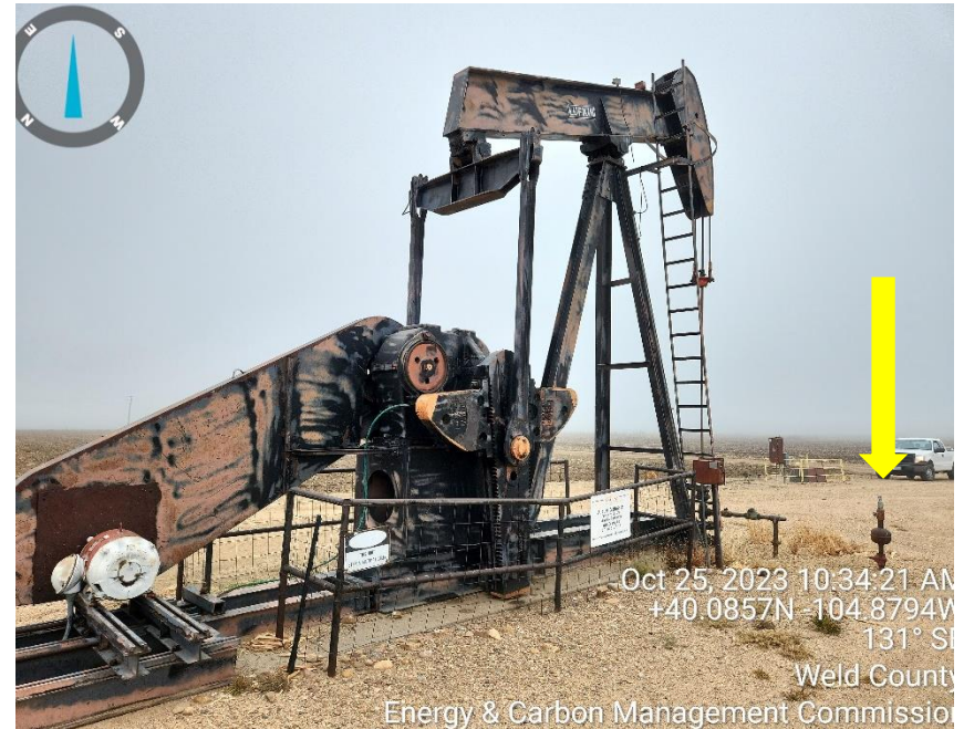
Photo 2 well head and equipment