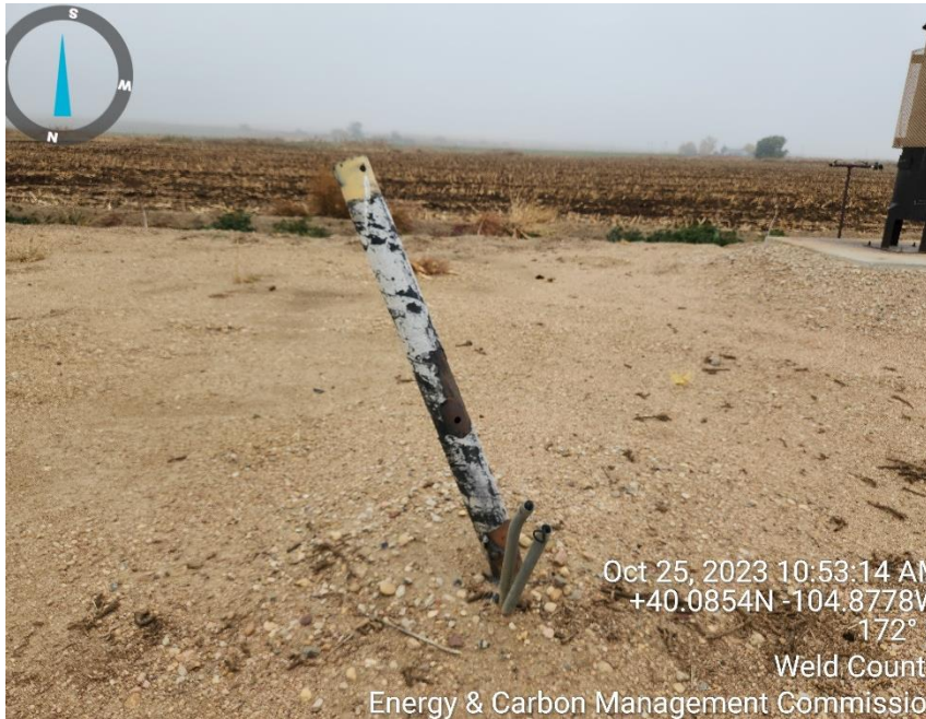
Photo 9 unused equipment abandoned electrical risers