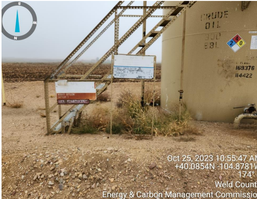
Photo 13 tank battery