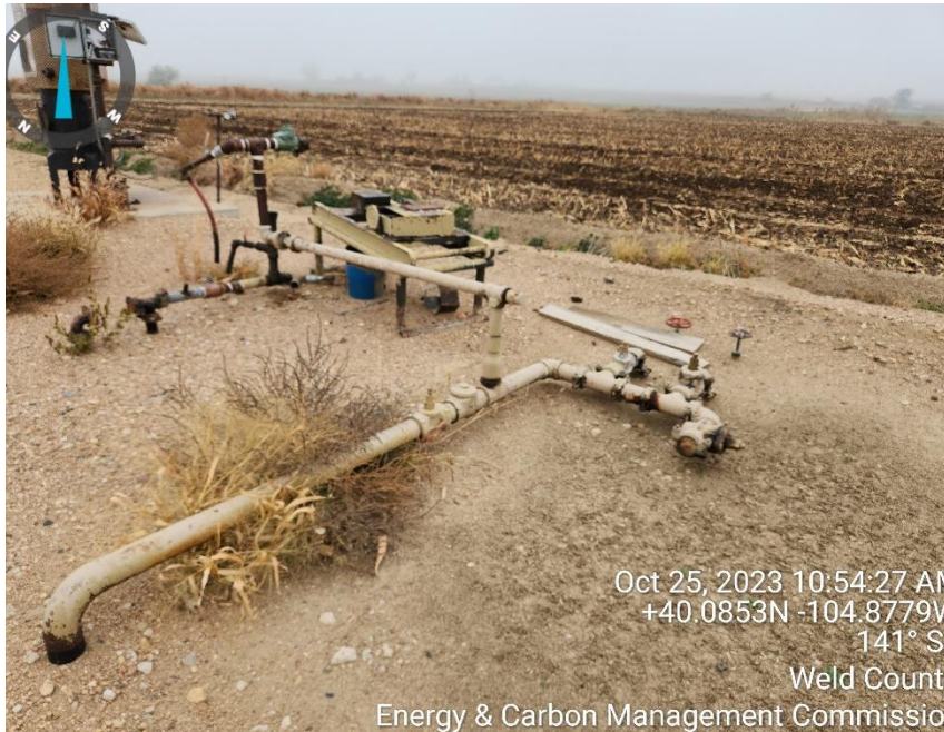
Photo 11 unused equipment and piping