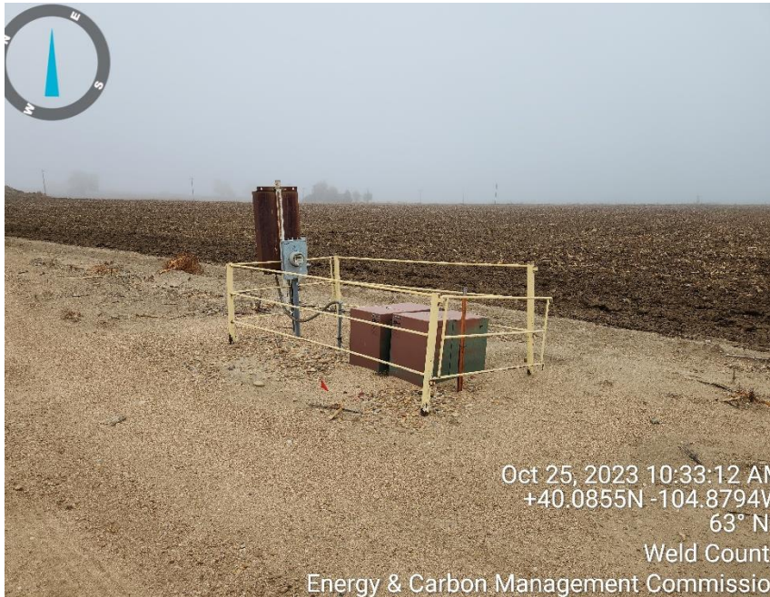
Photo 3 electrical service panel