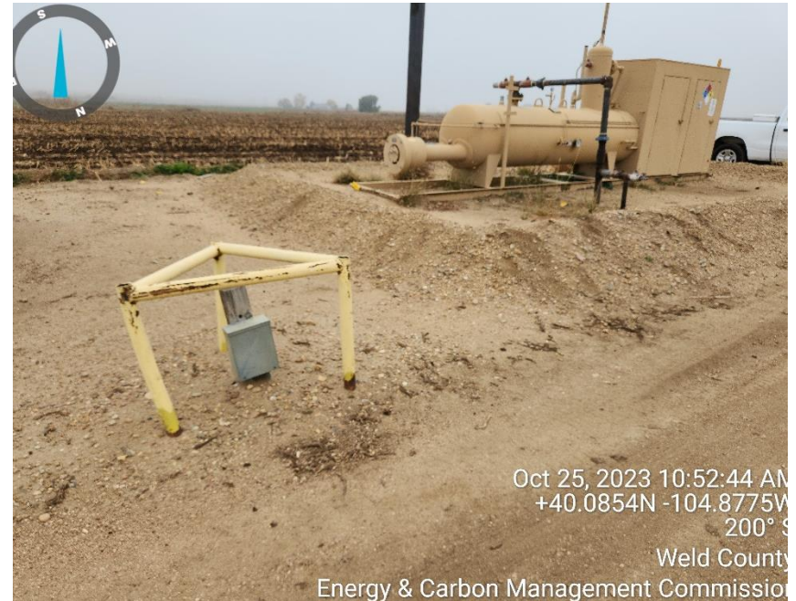
Photo 8 production equipment