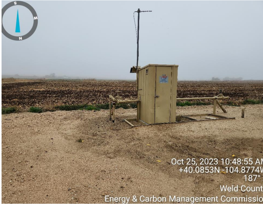
Photo 5 meter run