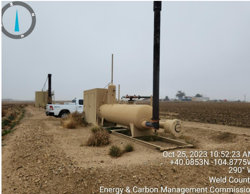
Photo 7 production equipment