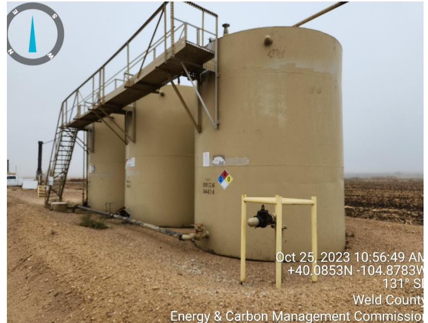
Photo 14 tank battery