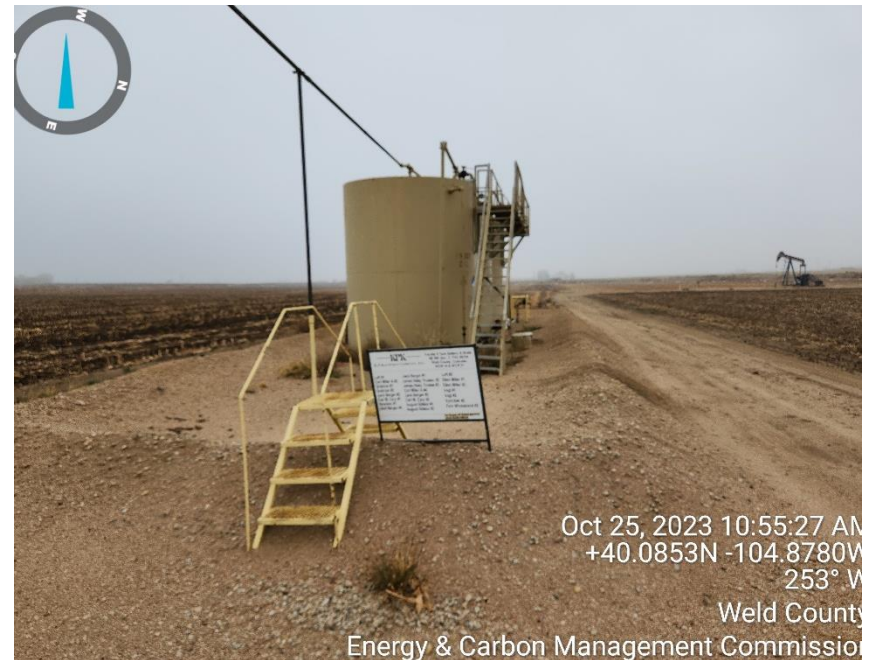
Photo 12 tank battery