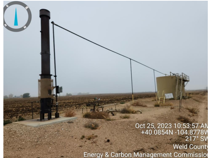
Photo 10 ECD and tank battery