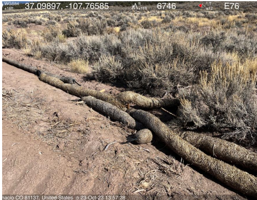
Photo #31 Wattle installation not to accepted specifications, along east side of tank pad.