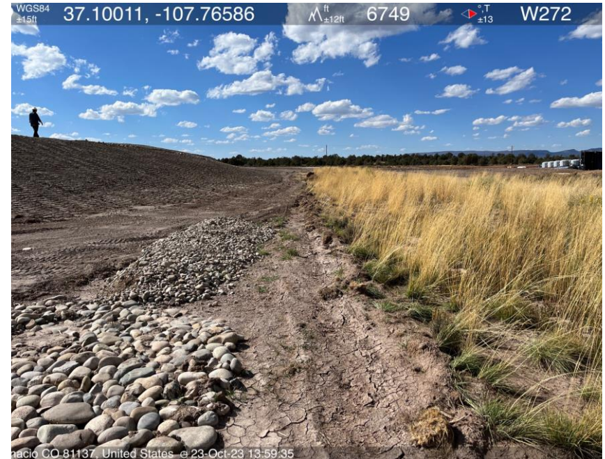
Photo #32 No perimeter wattle installation along north side of tank pad.