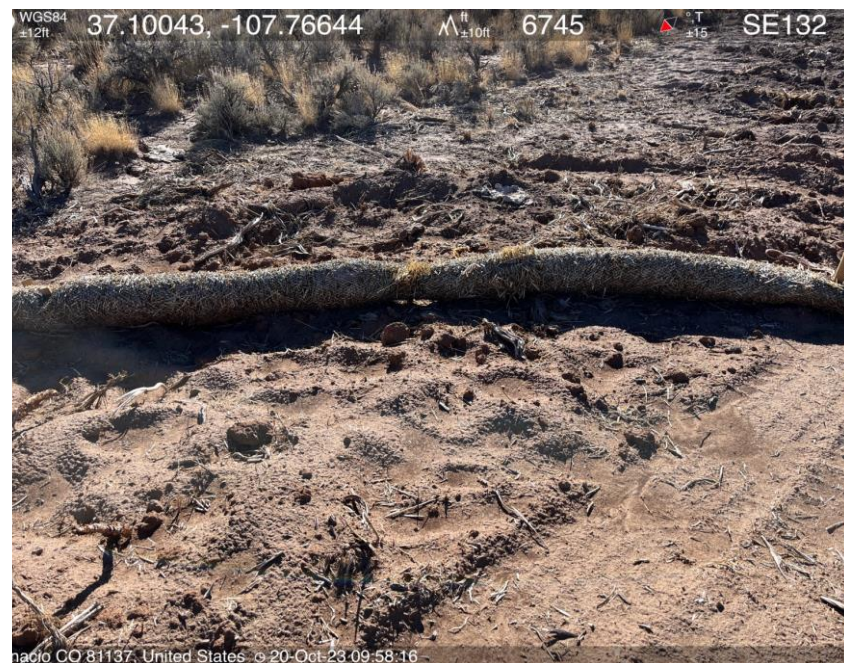
Photo #16 Corrective action not completed. Wattles not installed/stacked to accepted specifications.