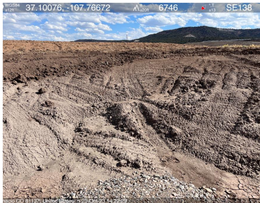
Photo #19 Slope and soils not stabilized, southeast corner of well location.