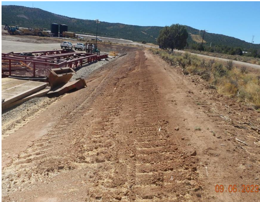
Photo #9 Corrective action identified, 9/8/2023. No perimeter wattle installation.