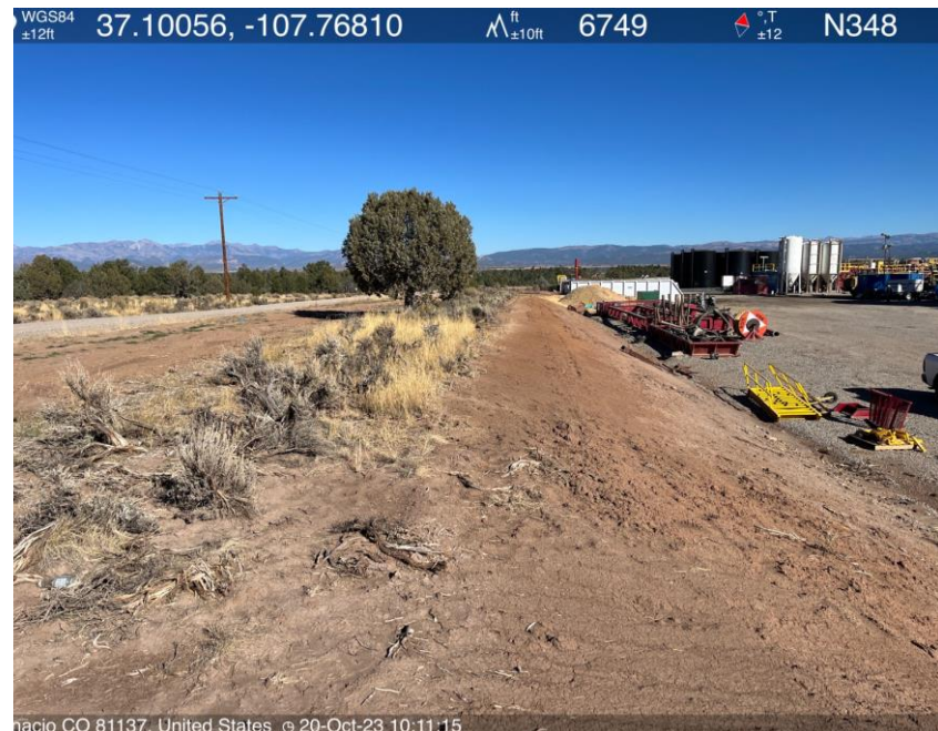
Photo #10 Corrective action not completed. No perimeter wattle installation along west side of well location.