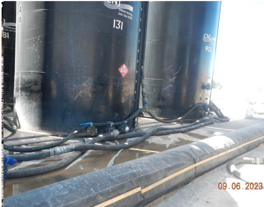
Photo #43 Corrective action identified on 9/8/2023. No contents labeling.