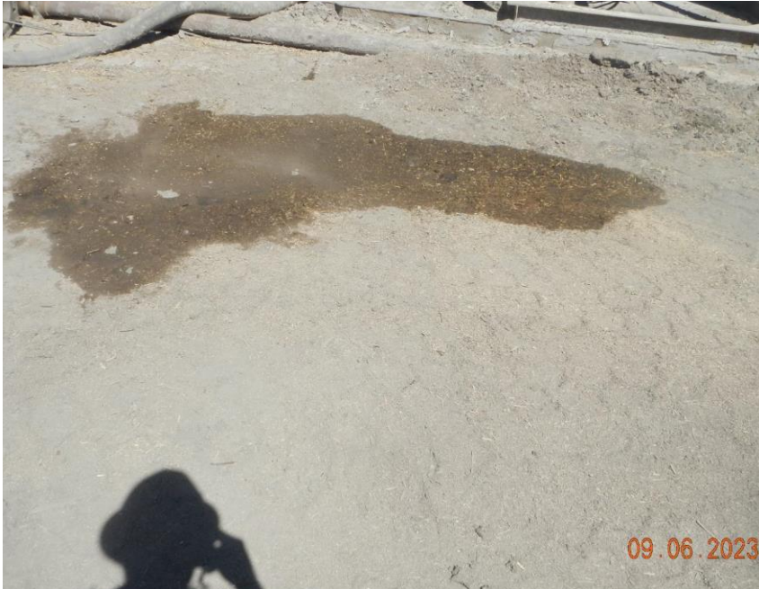
Photo #5 Inspection 9/8/2023. Corrective action completed. This impact has been cleaned.