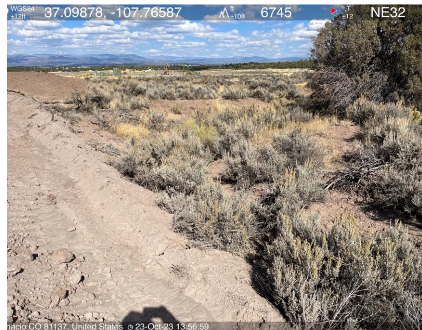
Photo #22 No perimeter wattle installation along east side of tank pad. Non-compacted windrowed soil next to surface drainage.