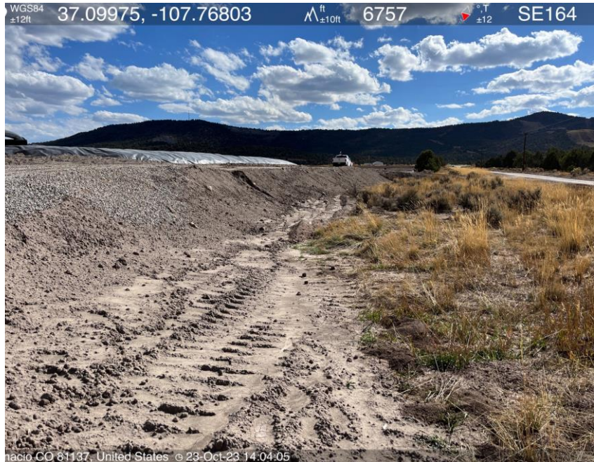
Photo #23 No perimeter wattle installation along northwest side of tank pad.