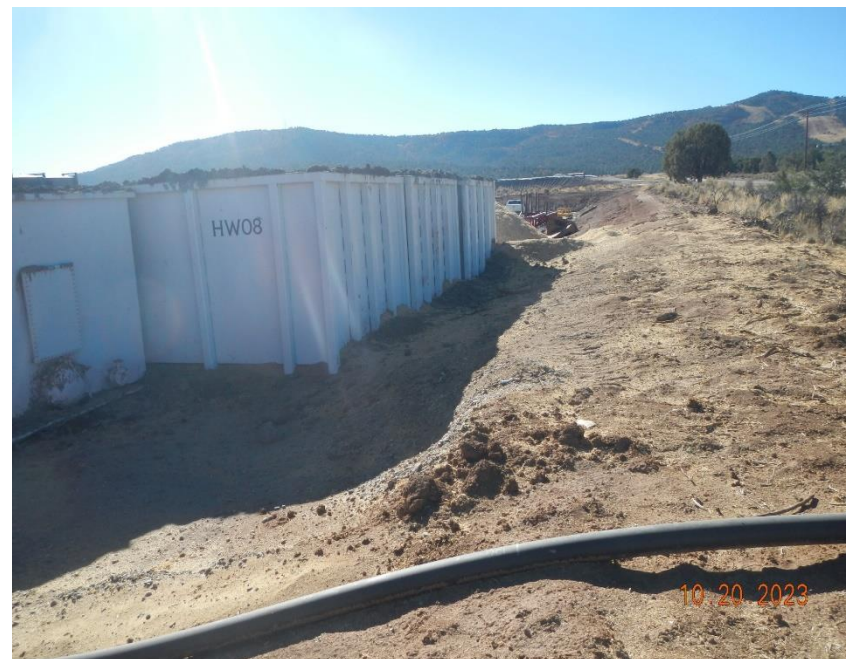
Photo #38 Cuttings removed, increase self-inspection, cuttings continue to escape storage bin.