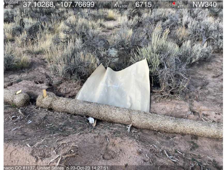
Photo #50 Improper wattle installation, trash on ground along north side of well location.