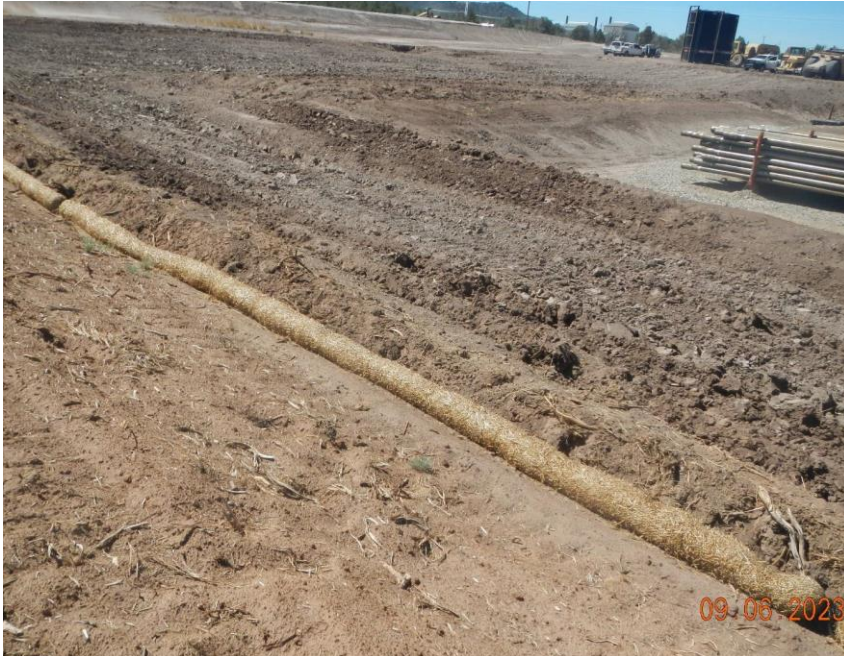
Photo #7 Corrective action identified on 9/8/2023. Stacking of wattles not to accepted specifications.