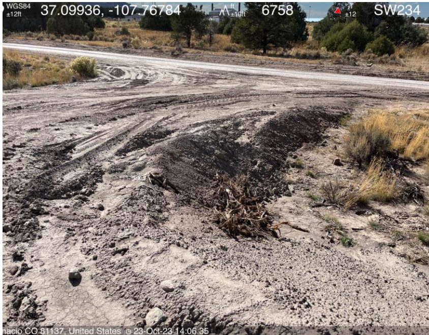
Photo #41 No perimeter wattle installation, unstable fill at entrance to well location.