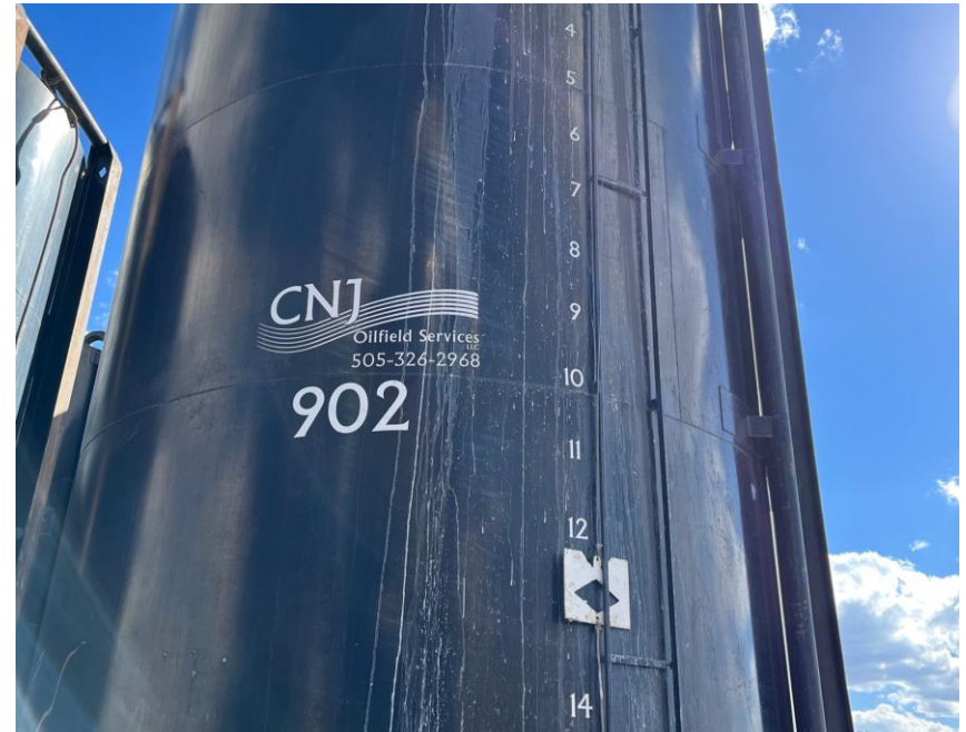
Photo # 44 6-400 bbl tanks in containment on north side of rig, no contents labeling.