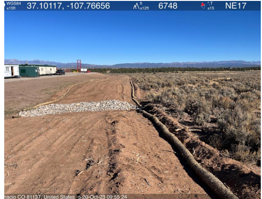
Photo #8 Corrective action not completed. Wattles not installed/staked to accepted specifications.