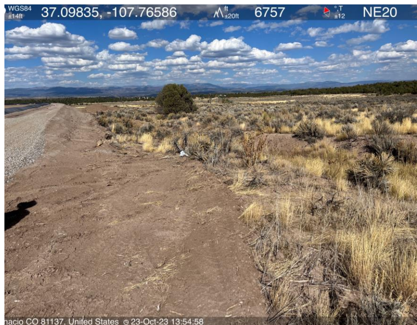
Photo #21 No perimeter wattle installation along east side of tank pad.