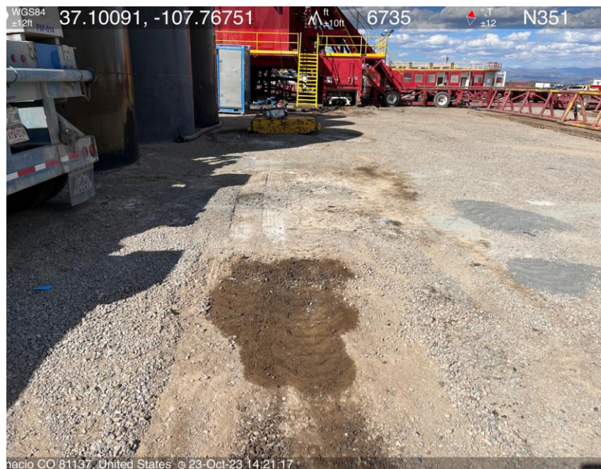
Photo #45 Unsatisfactory spill response, impacted ground at southeast side of rig.