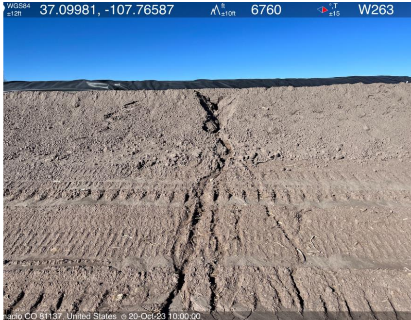
Photo #29 Visible erosion and sediment migration on 9/8/2023. Horizontal dozer tracks.