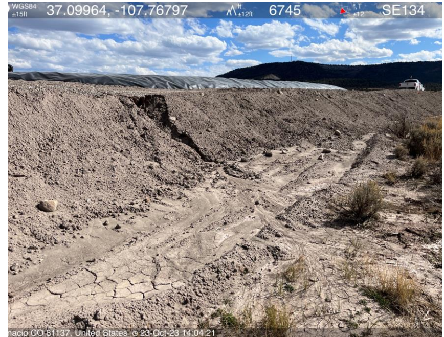
Photo #24 No perimeter wattle installation, active gully erosion along northwest side of tank pad.