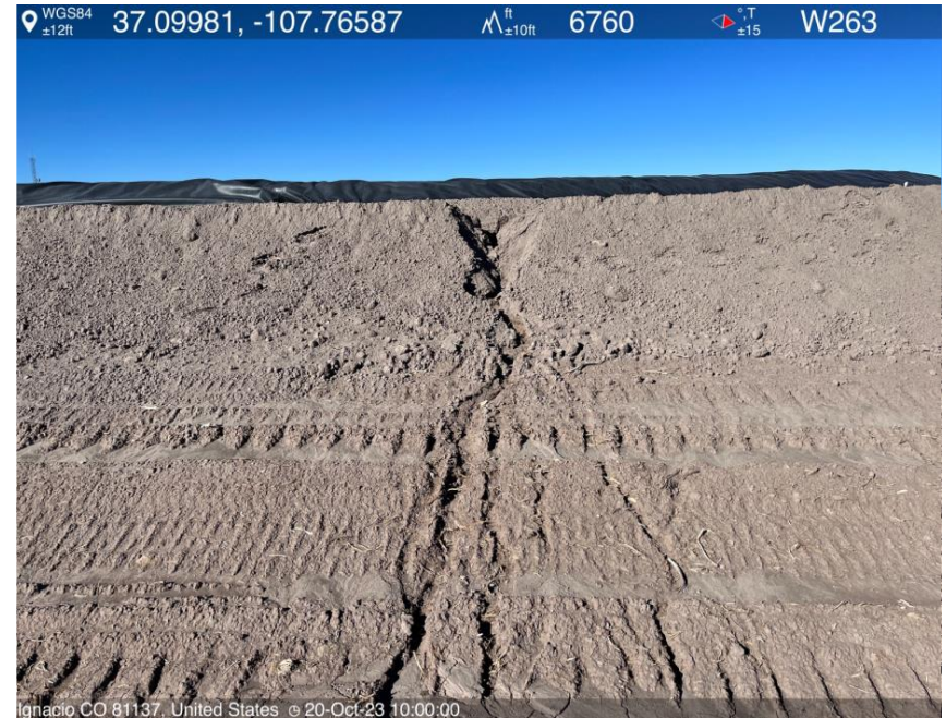
Photo #30 Corrective action not completed. Horizontal dozer tracks.