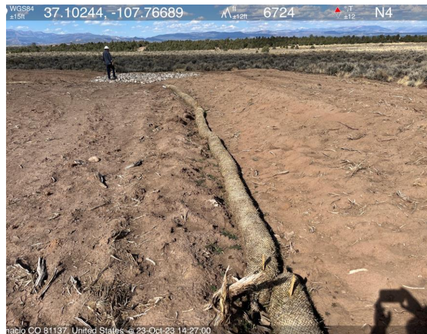
Photo #26 Wattle installation not to accepted specifications, 2 stakes installed in a 50-ft. roll.