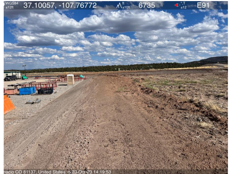
Photo #40 No perimeter wattle installation along south side of well location.