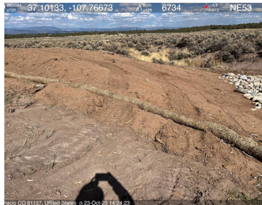
Photo #20 Topsoil stockpile not being protected, equipment tracking atop stockpile and BMPs, no signage in this area.