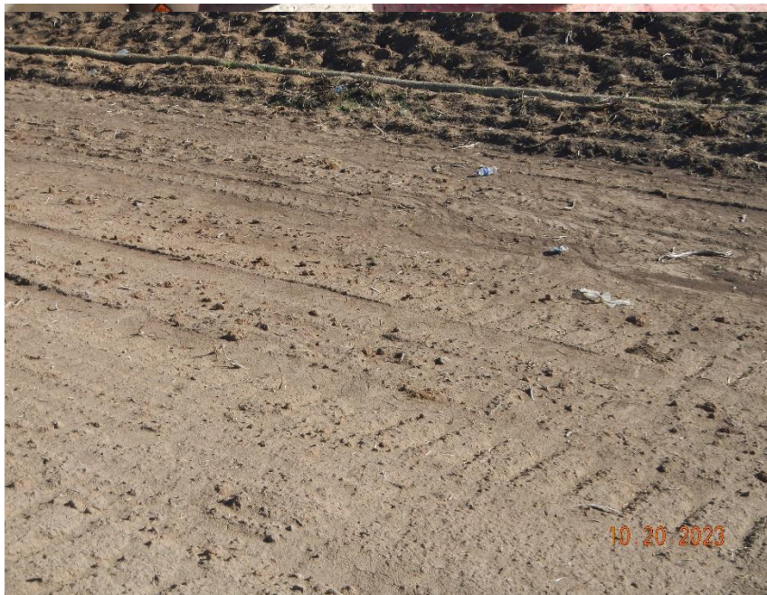
Photo #35 Corrective action on 9/8/2023. Trash observed around the northeast portion of the location.