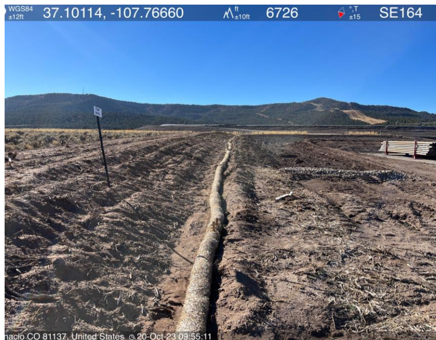
Photo #15 Corrective action identified 9/8/2023. Wattles not installed/stacked to accepted specifications.