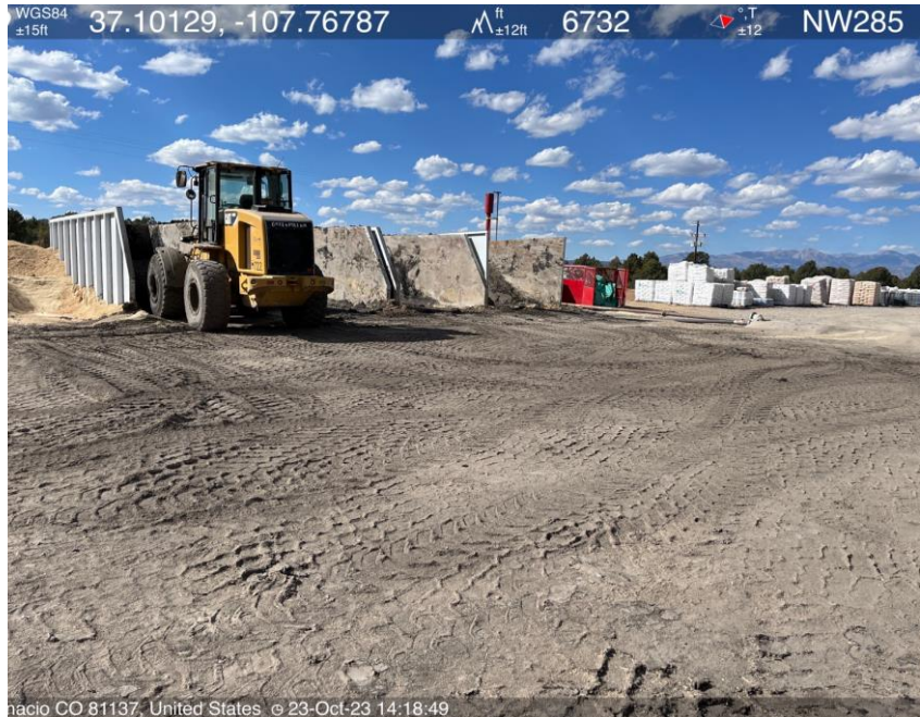
Photo #39 Drill cuttings spread across ground from shaker bin to storage bin.