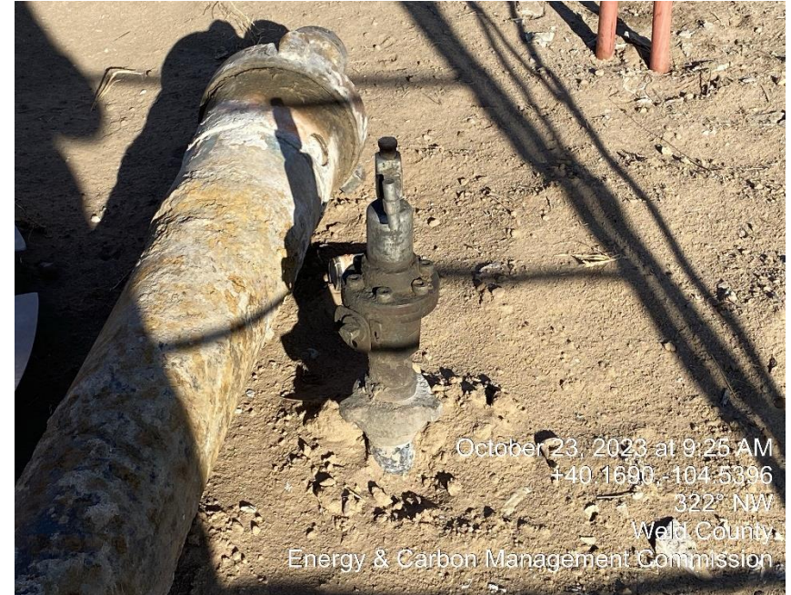
Riser needs to be tagged "LO/TO" and identified