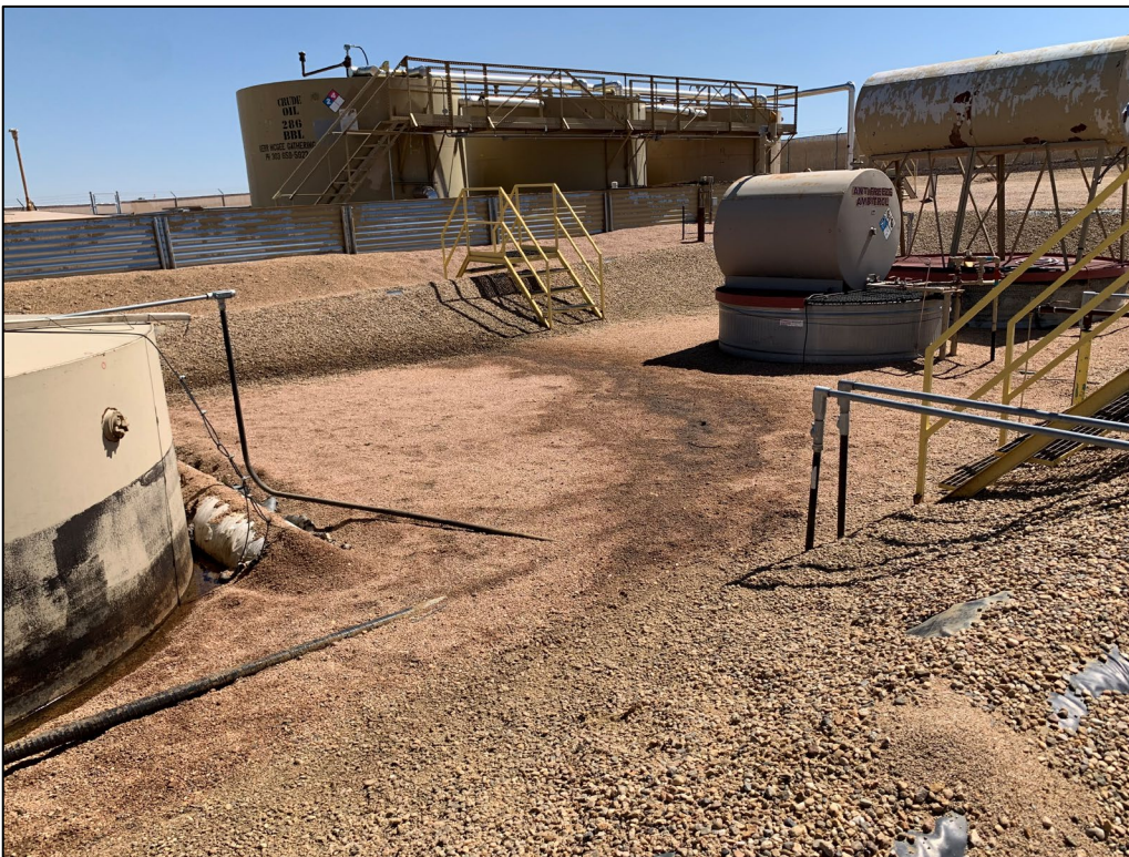
Photograph 4: Dry area inside secondary containment. Staining along evaporation line. East corner of the facility facing south.