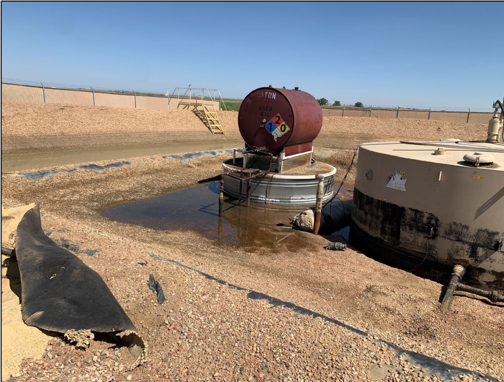
Photograph 3: Stormwater inside and outside secondary containment area. East corner of the facility facing east. Staining present on sides of secondary berm.