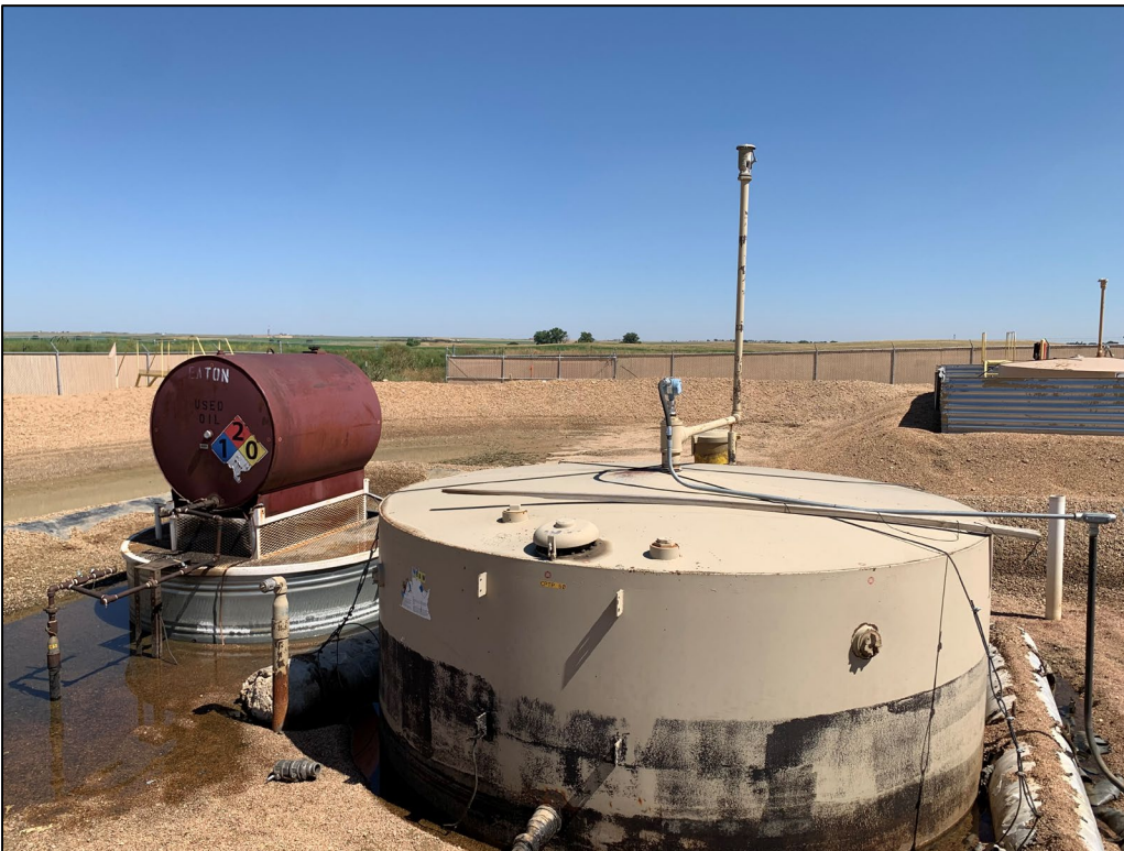
Photograph 6: Tanks within secondary containment. East corner of the facility facing east.