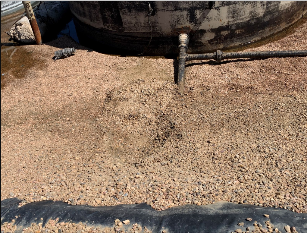
Photograph 7: Close up of piping at tank base. No staining or evidence of leakage from piping.