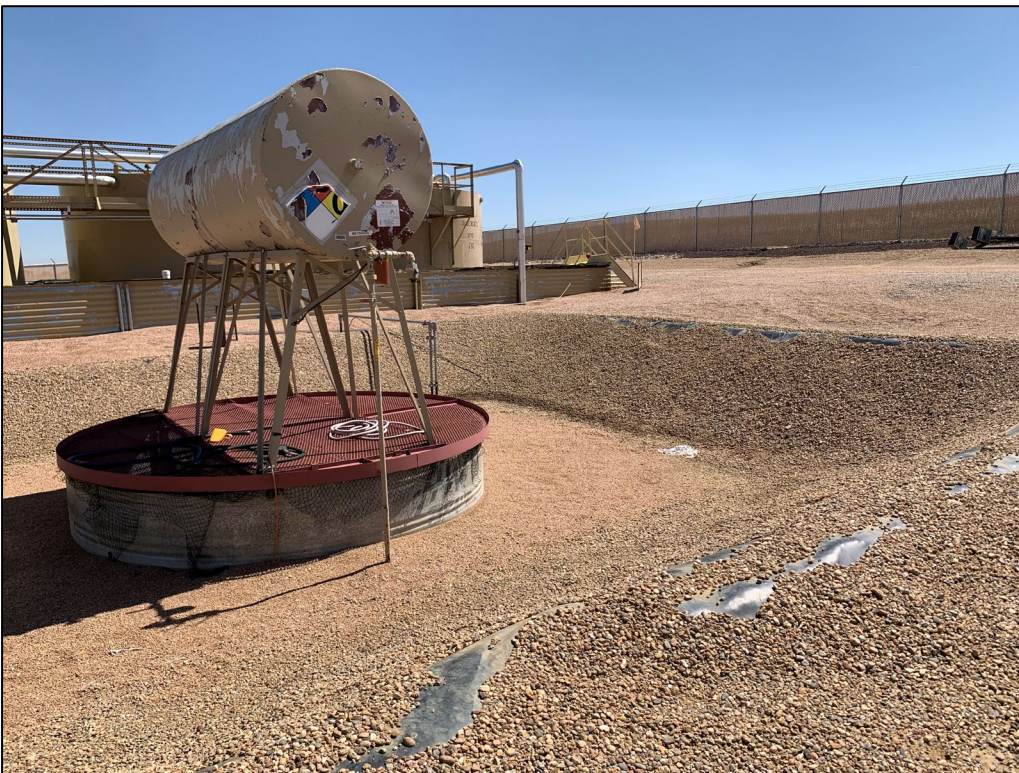
Photograph 8: South end of secondary containment. No staining or evidence of impacts from excess stormwater. East corner of facility, facing southwest.