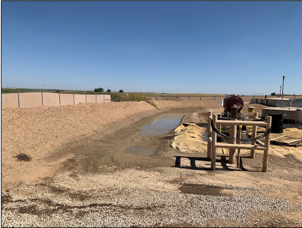
Photograph 1: Stormwater outside secondary containment area. Staining in foreground. East corner of the facility facing southeast.