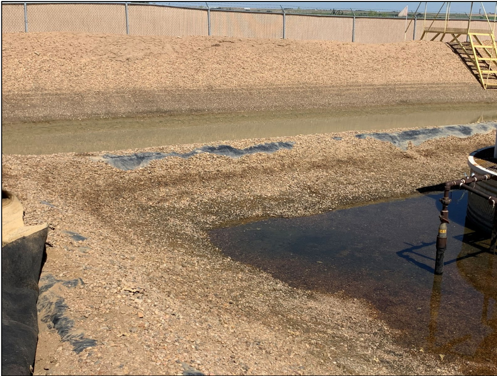
Photograph 5: Close up of staining inside secondary containment. No visible sheen on stormwater at time of discovery. East corner of the facility facing east.