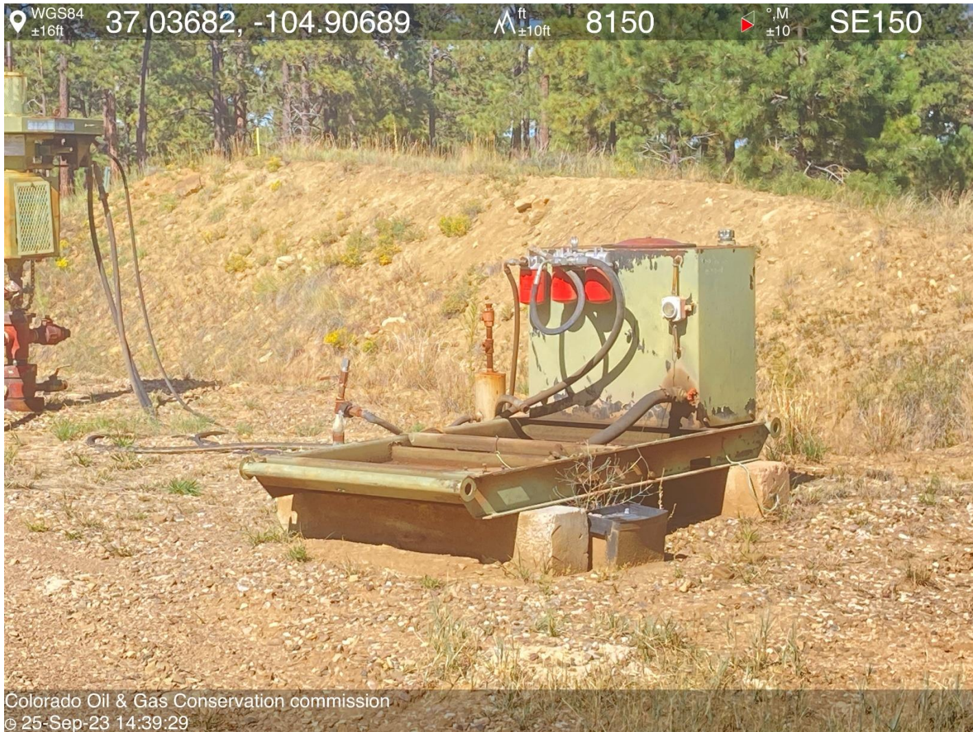
PHOTO 5: UNUSED EQUIPMENT STORED ON LOCATION (PRIME MOVER SKID ON R WELL HAS NO MOTOR). REMOVE UNUSED EQUIPMENT PER RULE 606. CA DATE 11-20-23.