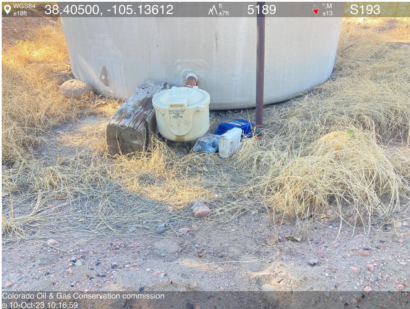
PHOTO 6: TRASH NEAR TANK BATTERY LOAD OUT (OIL JUGGS). REMOVE TRASH PER RULE 606. CA DATE 11-10-2023.