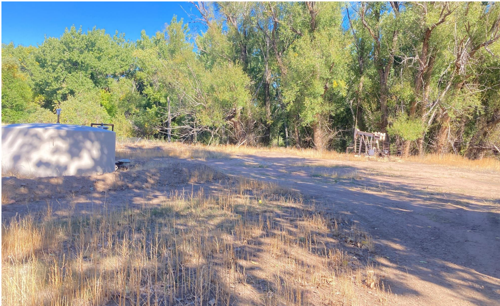
PHOTO 2: LOCATION/ WEED MAINTENANCE AROUND LOCATION. MAINTAIN WEEDS PER RULE 606. CA DATE 11-10-2023.