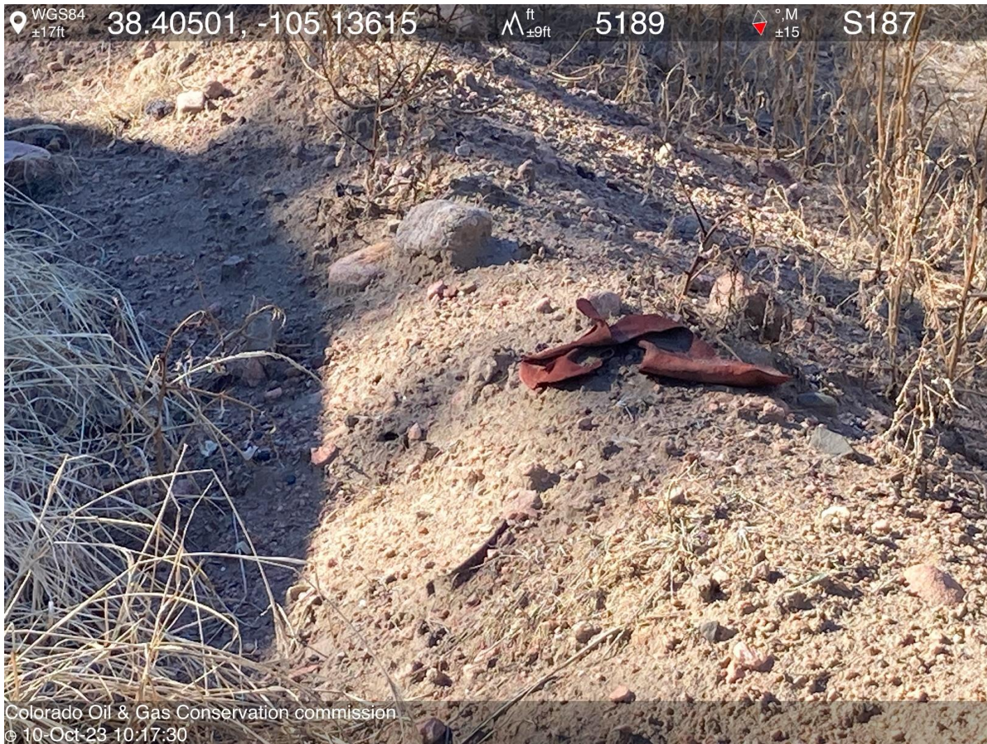
PHOTO 7: TRASH ON TANK BATTERY BERM. REMOVE TRASH PER RULE 606. CA DATE 11-10-2023.