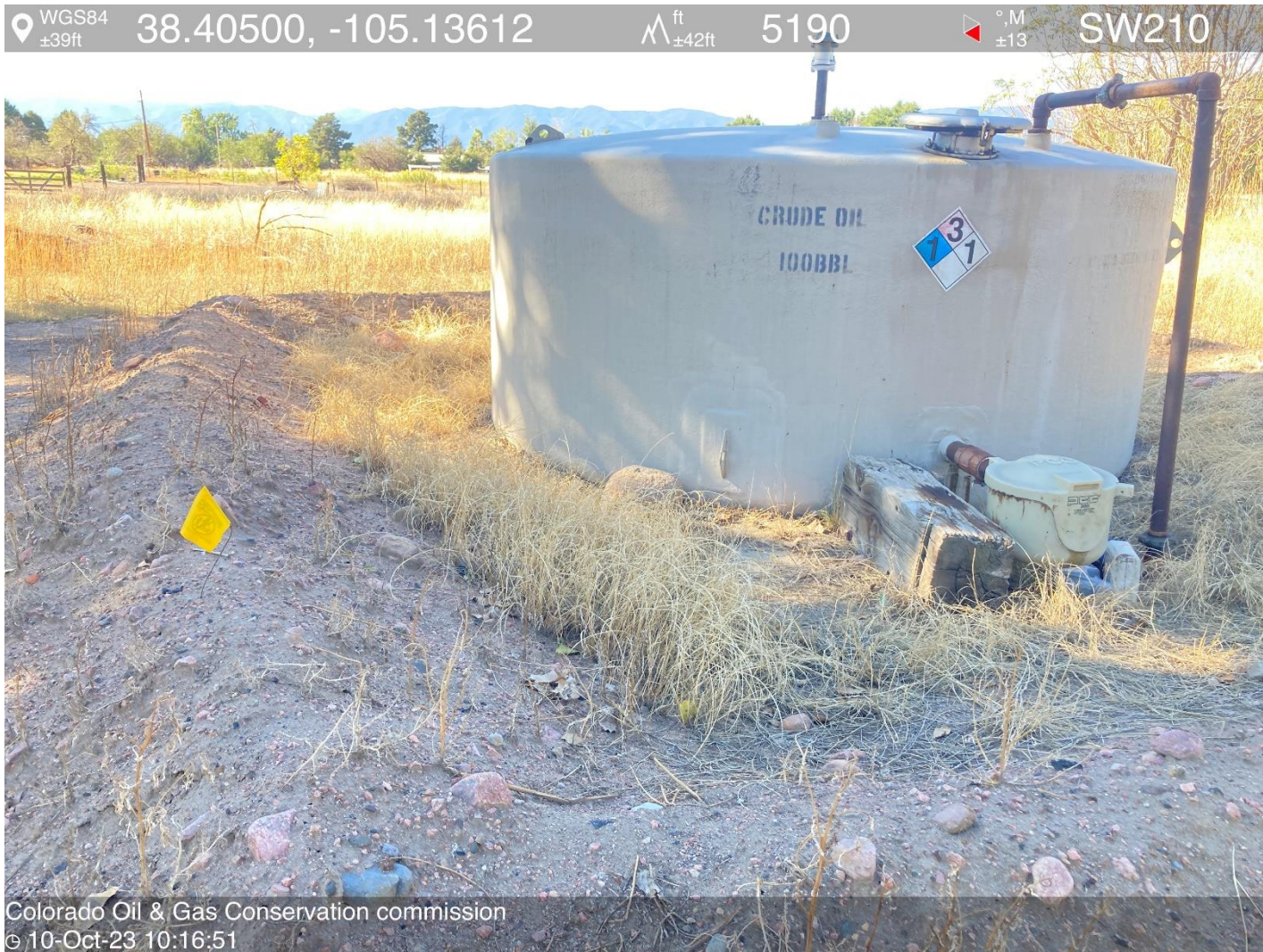
PHOTO 5: WEEDS INSIDE TANK BATTERY CONTAINMENT NOT MAINTAINED. MAINTAIN WEEDS PER RULE 606. CA DATE 11-10-2023.