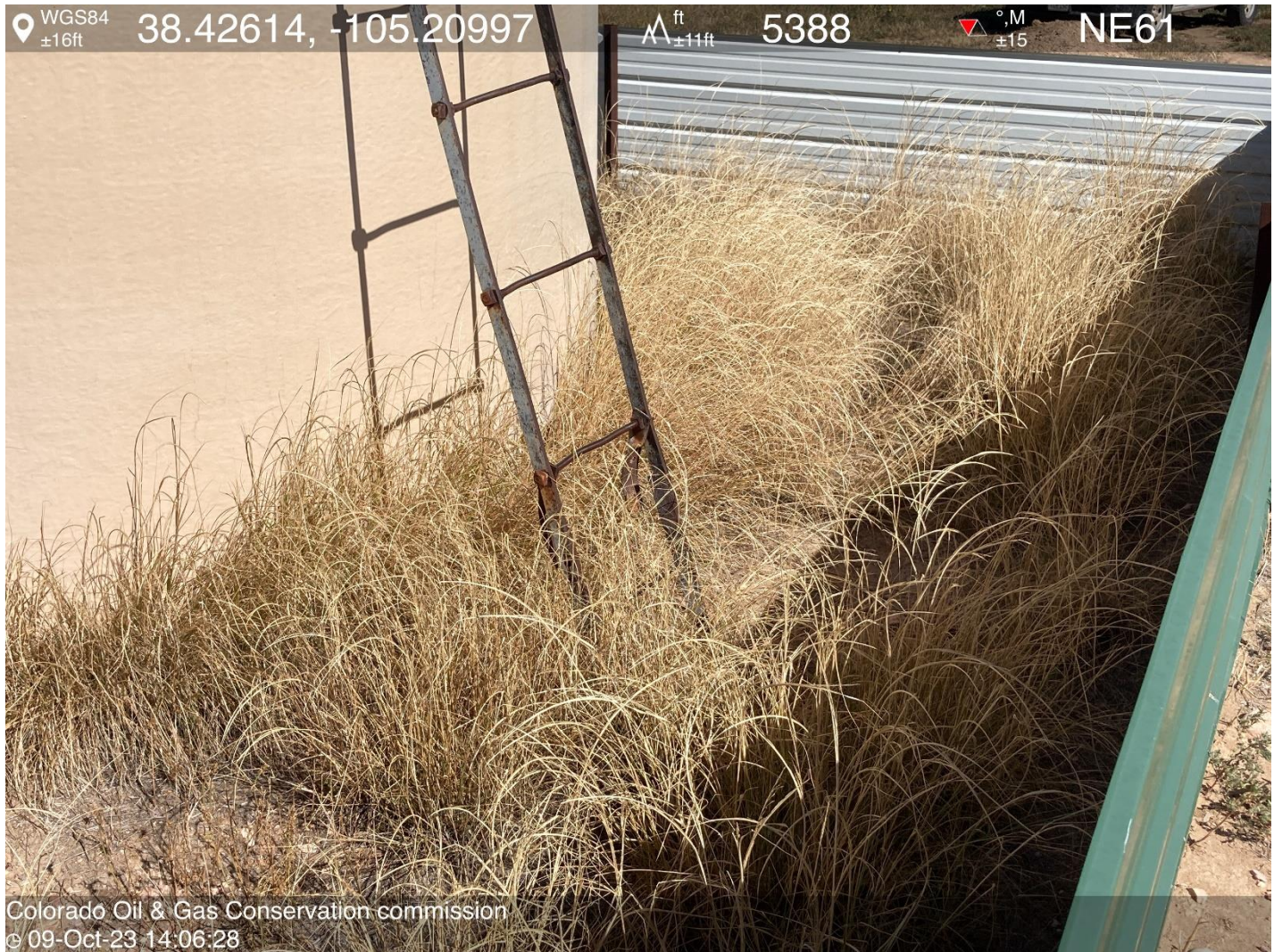
PHOTO 5: WEEDS INSIDE TANK BATTERY BERM. MAINTAIN WEEDS PER RULE 606. CA DATE 11-19-2023.