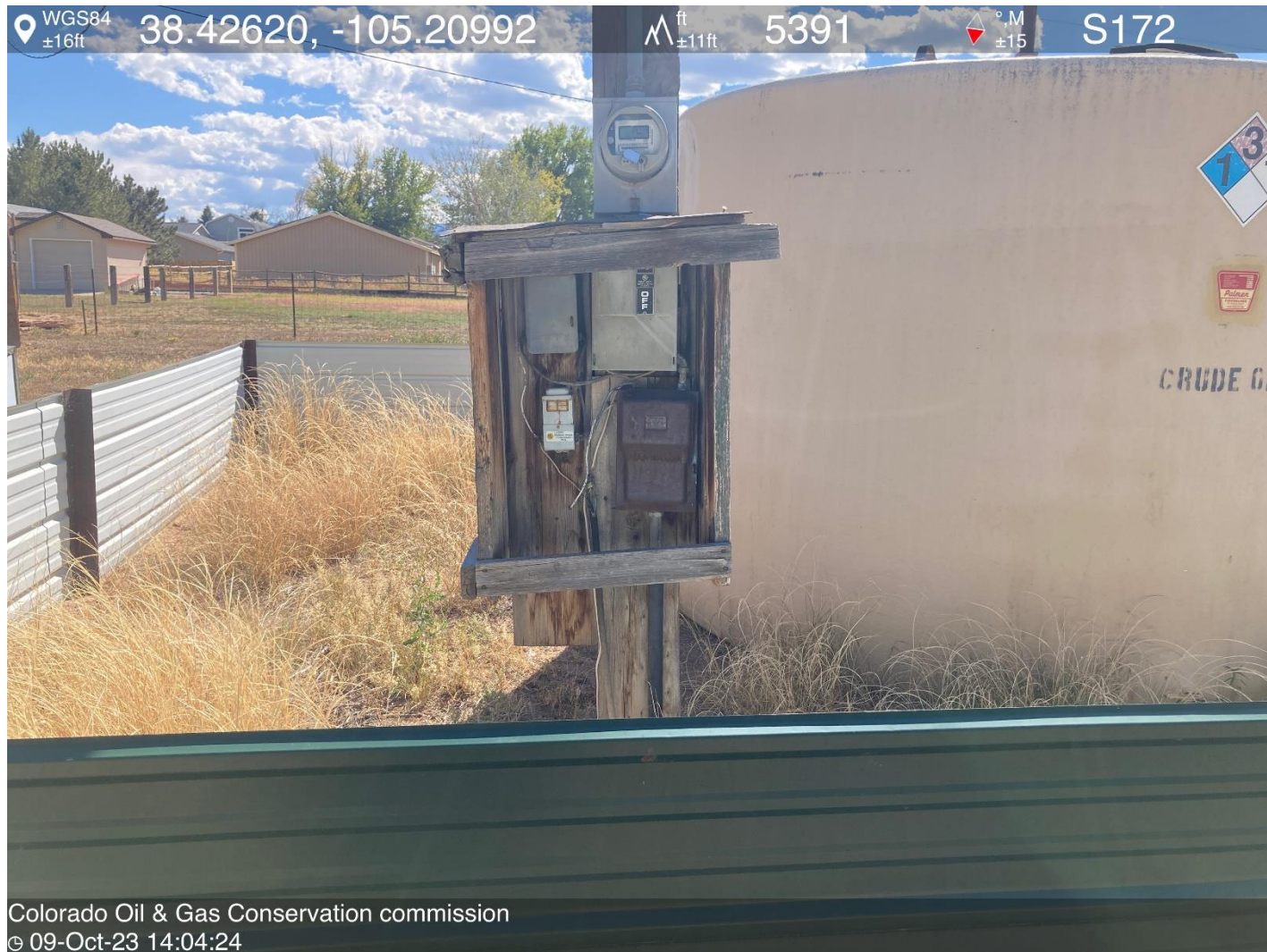
PHOTO 8: THERE ARE EXPOSED WIRE CONNECTIONS INSIDE WOOD ELECTRIC PANEL BOX. Securely fasten all valves, pipes, fittings, electric equipment and Production Facilities to ensure good mechanical condition, inspect at regular intervals and maintain in good mechanical condition per Rule 603.O(6) CA DATE 11-19-2023.