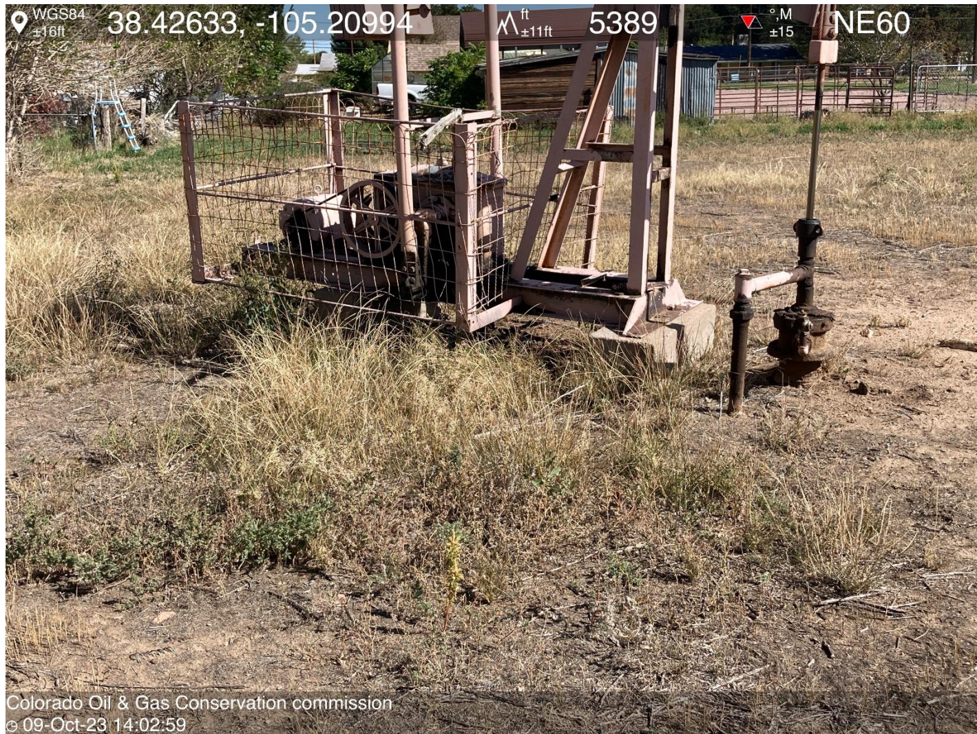
PHOTO 6: WEEDS AROUND WELLHEAD/PUMPJACK. MAINTAIN WEEDS PER RULE 606. CA DATE 11-19-2023.