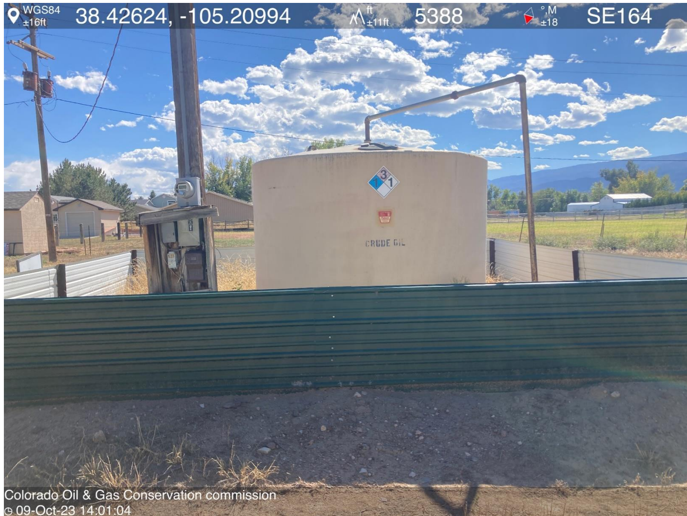
PHOTO 4: TANK BATTERY/ NO TANK BAPACITY POST ON OR AT TANK BATTERY. POST CAPACITY PER RULE 605. CA DATE 11-19-2023.