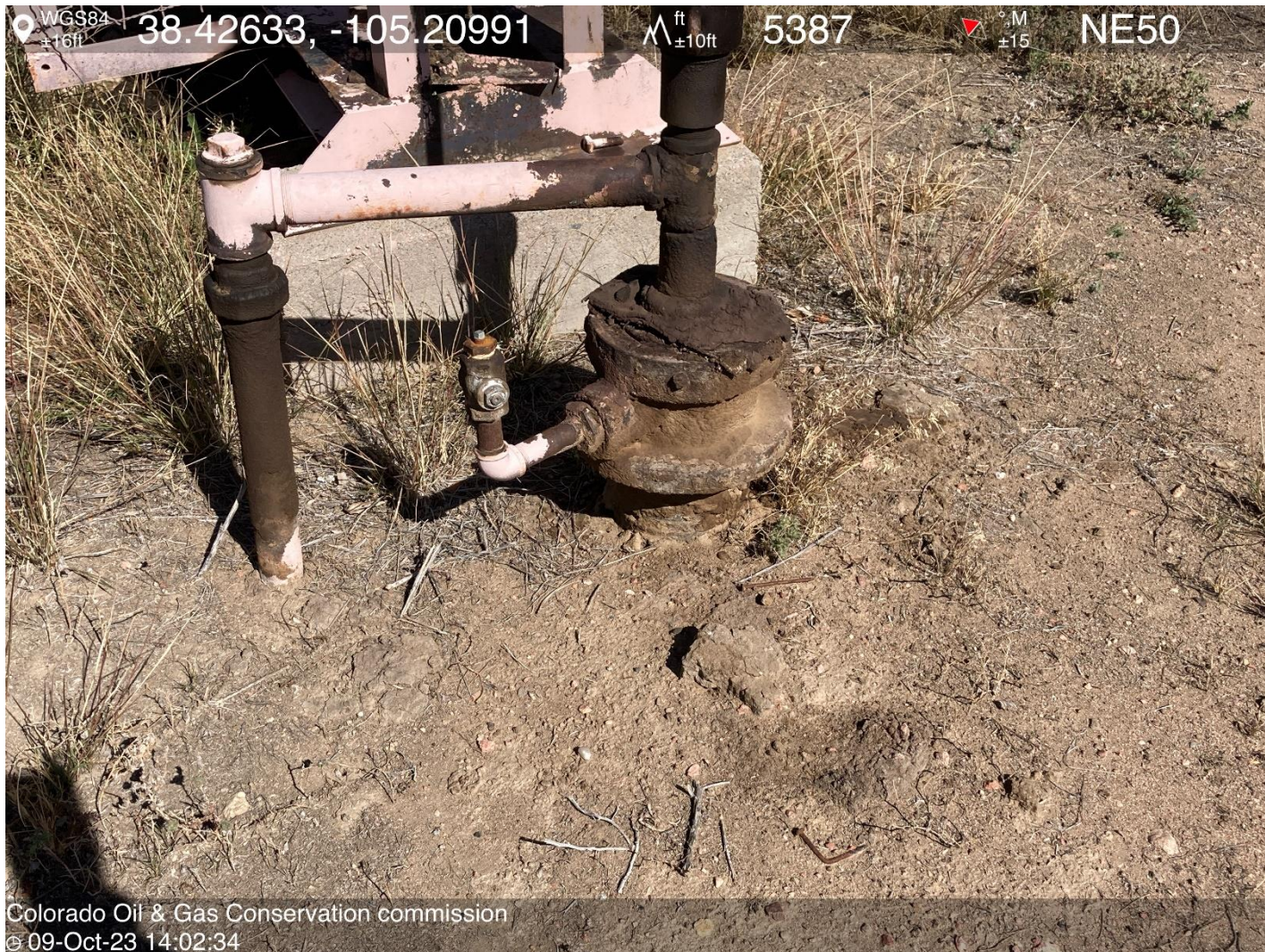
PHOTO 12: BRADENHEAD IS NOT ACCESSABLE. Install appropriate fittings to allow bradenhead visual inspection as per Rule 419.a.(1), (2). CA DATE 11-19-2023.