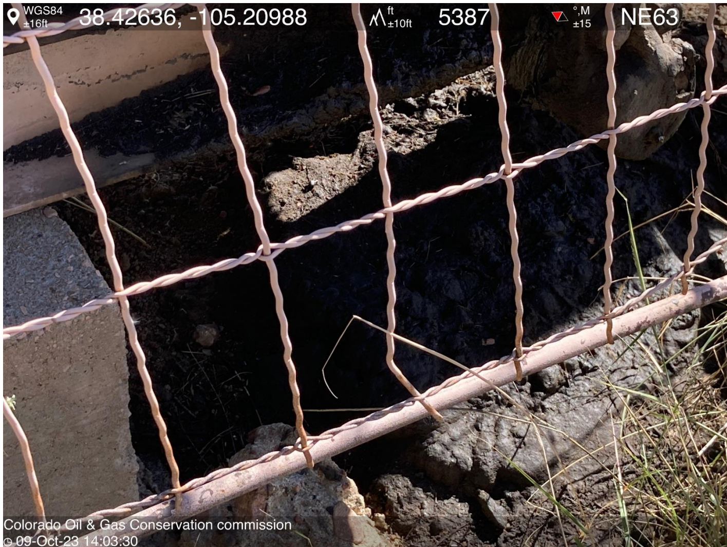
PHOTO 7: AREA OF IMPACTED SOIL UNDER PUMPJACK GEAR BOX. Conduct maintenance on equipment, cleanup stained material and review self inspection processes. COMPLY WITH RULE 1002,(2).D CA DATE 11-19-2023.