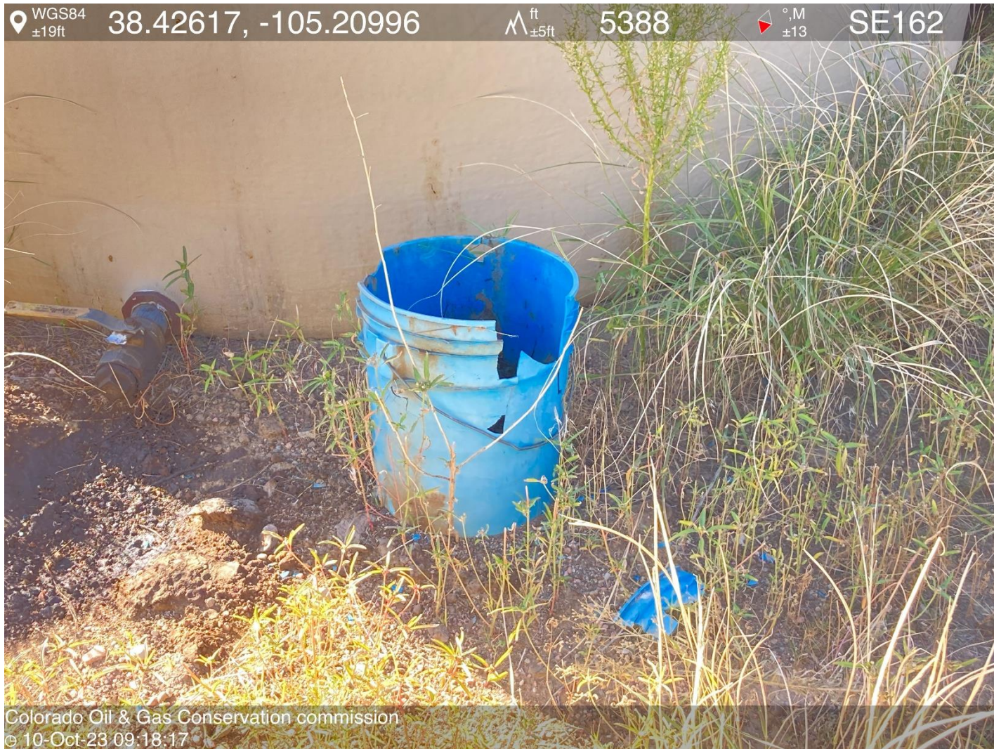
PHOTO 13: TRASH INSIDE TANK BATTERY CONTAINMENT (BLUE 5 GAL. BUCKET. REMOVE TRASH PER RULE 606. CA DATE 11-19-2023.