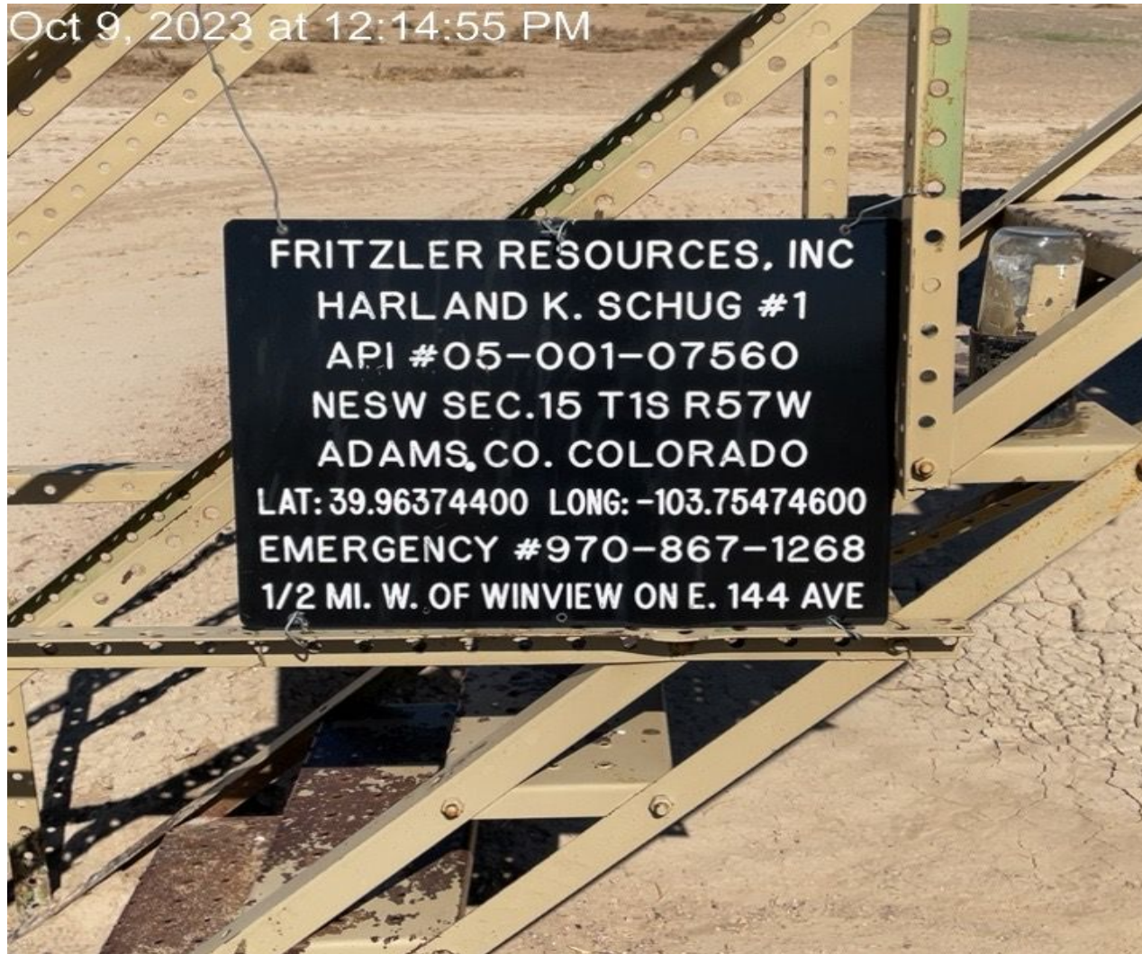
Photo 1. Photo taken of location sign, facing north