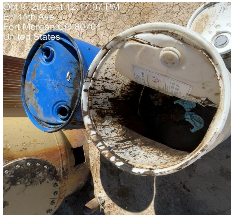
Photo 4. Photo taken of produced water tank and pit, facing east.