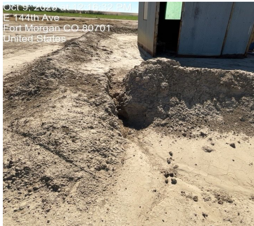
Photo 10. Photo taken facing south of break in containment berm around separator and produced water tank.