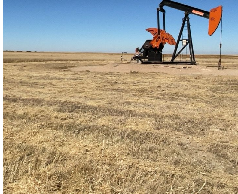
Photo 13. Photo taken of mowed area around well head facing north in interim reclaimed area. (Well Pad)

Oct 9, 2023 at 12:24:14 PM Fort Morgan CO 80701 United States