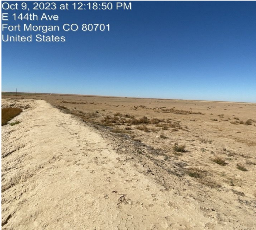
Photo 8. Photo taken facing west of weeds (kochia & russian thistle) and bare soil on pit berm area.

Oct 9, 2023 at 12:18:50 PM E 144th Ave Fort Morgan CO 80701 United States