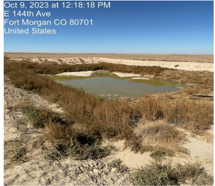
Photo 7. Photo taken facing southwest of weeds (kochia & russian thistle) and bare eroding soil around second pit

Oct 9, 2023 at 12:18:18 PM E 144th Ave Fort Morgan CO 80701 United States