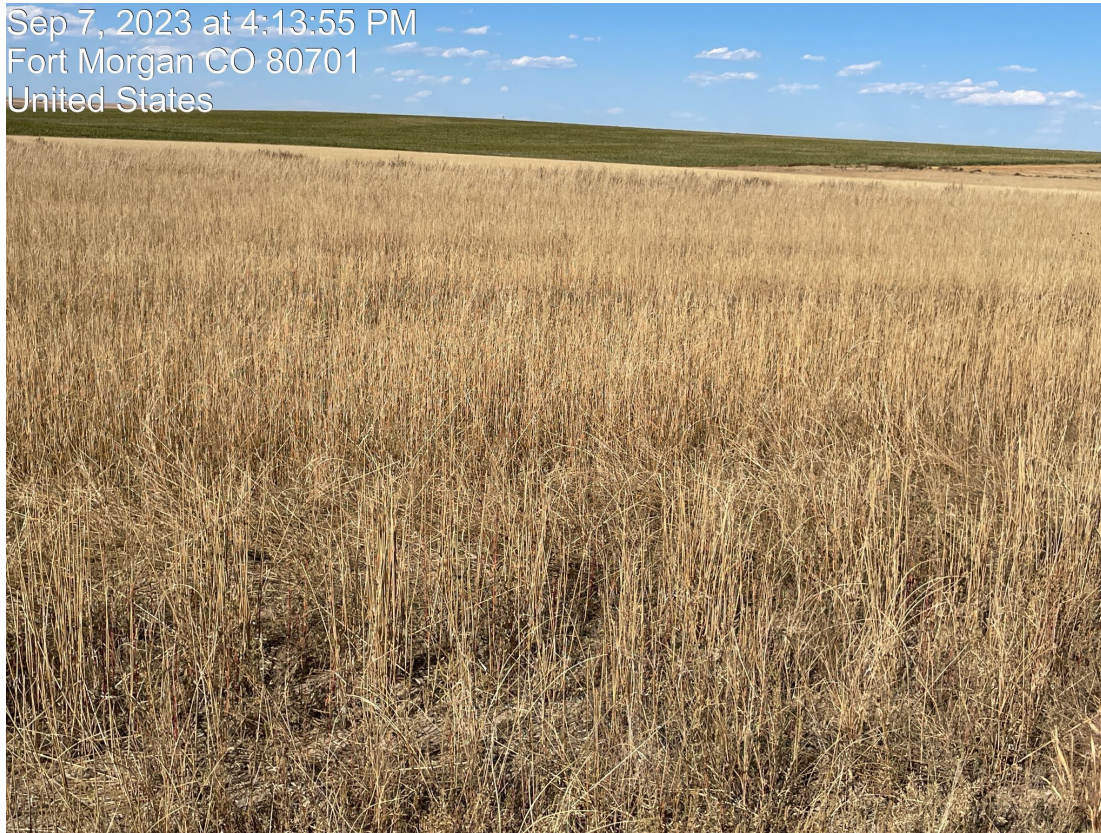
Photo 16. Photo taken facing east of forage for reference vegetation comparison.

Sep 7, 2023 at 4:13:55 PM Fort Morgan CO 80701 United States