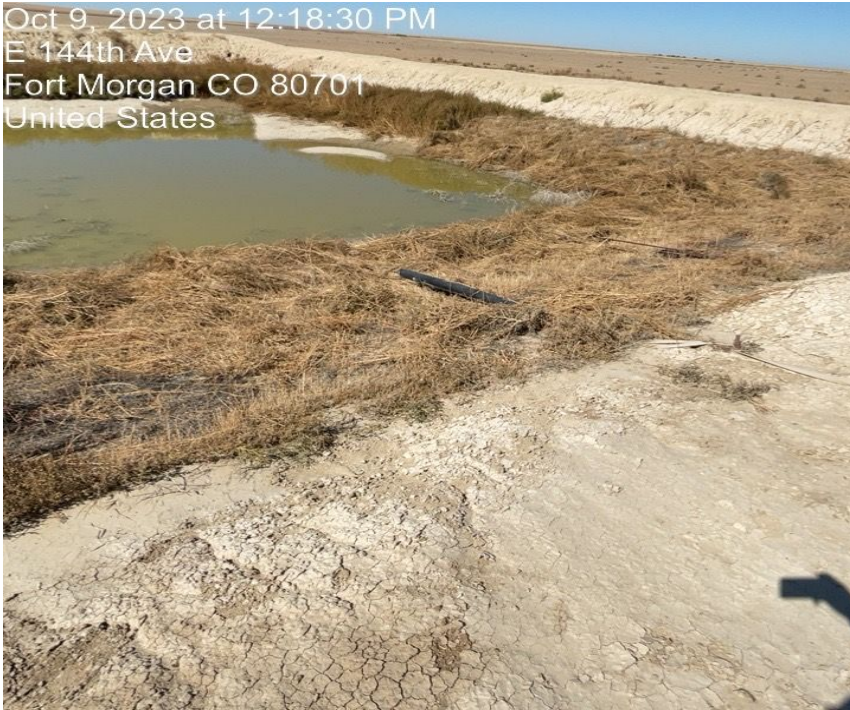
Photo 6. Photo taken facing southwest, of weeds (kochia & russian thistle) and eroding bare soil around pit.

Oct 9, 2023 at 12:18:30 PM E 144th Ave Fort Morgan CO 80701 United States