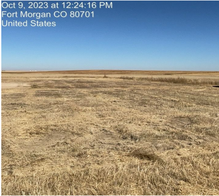
Photo 14. Photo taken facing southeast of mowed interim reclaimed area. (well pad)

Oct 9, 2023 at 12:24:16 PM Fort Morgan CO 80701 United States