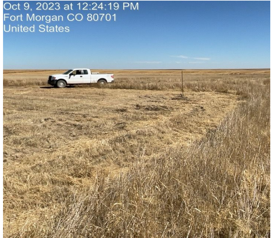
Photo 15. Photo taken facing northeast of mowed interim reclaimed area. (well pad)

Oct 9, 2023 at 12:24:19 PM Fort Morgan CO 80701 United States