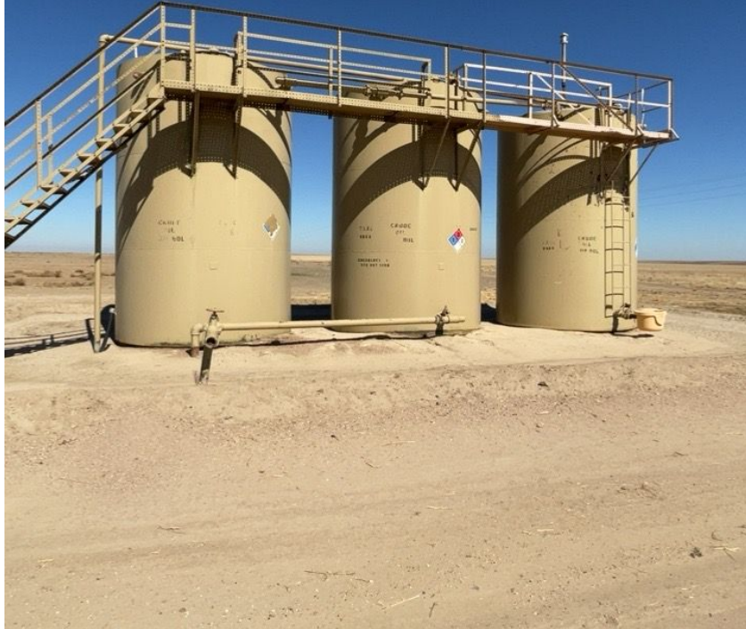
Photo 2. Photo taken of tank battery, facing north. Bare un-stabilized soil on site.

Oct 9, 2023 at 12:15:13 PM Fort Morgan CO 80701 United States