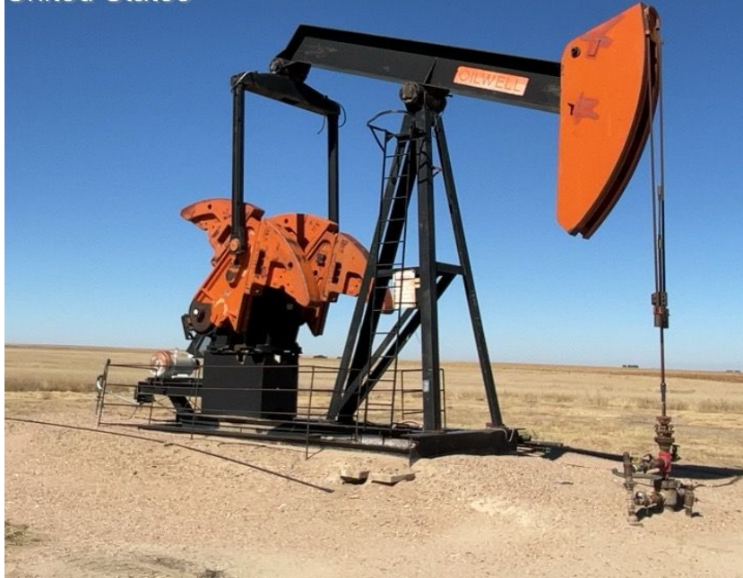
Photo 12. Photo taken of weeds (kochia & russian thistle) facing north, in interim reclaimed area (well pad)

Oct 9, 2023 at 12:23:47 PM E 144th Ave Fort Morgan CO 80701 United States