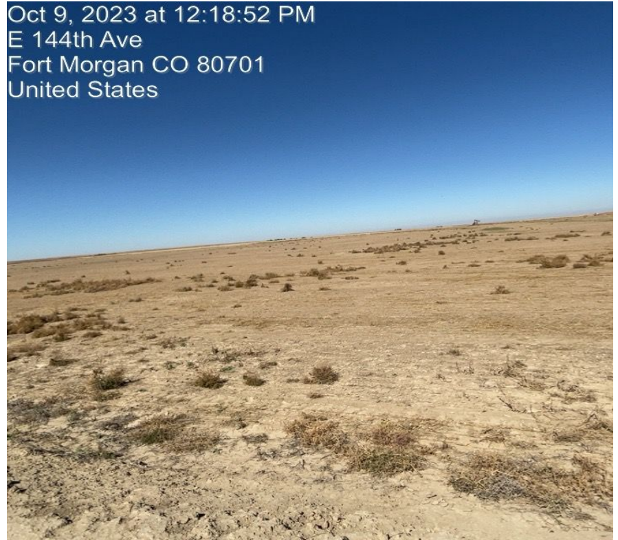
Photo 9. Photo taken facing northwest of weeds (kochia & russian thistle), and surrounding undisturbed area.

Oct 9, 2023 at 12:18:52 PM E 144th Ave Fort Morgan CO 80701 United States