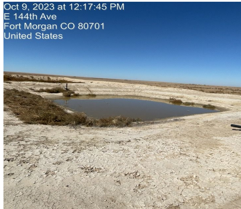
Photo 5. Photo taken facing southeast of weeds (kochia), and bare soil around pit and tank.