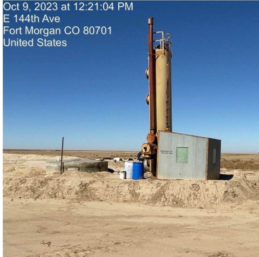
Photo 3. Photo taken of inadequate tank battery berm, facing northwest.

Oct 9, 2023 at 12:21:04 PM E 144th Ave Fort Morgan CO 80701 United States