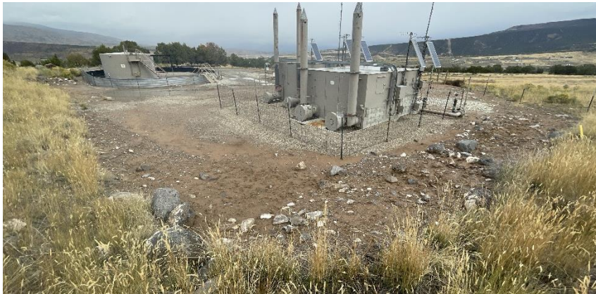
South West corner of location.