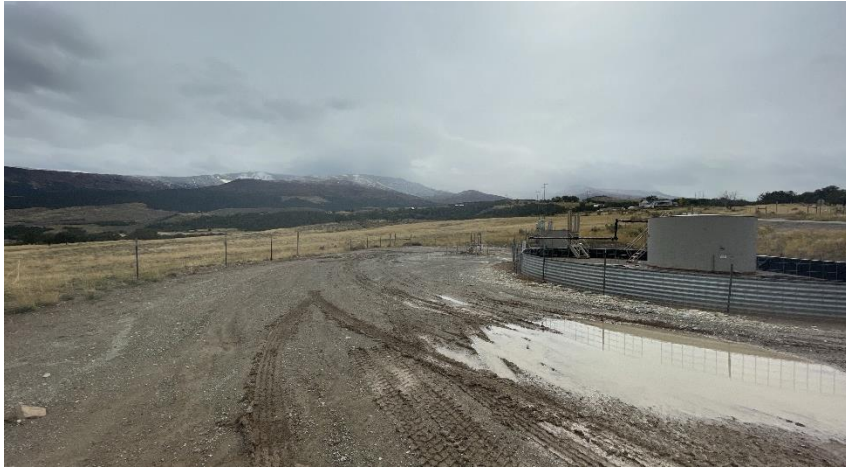
North West corner of location.