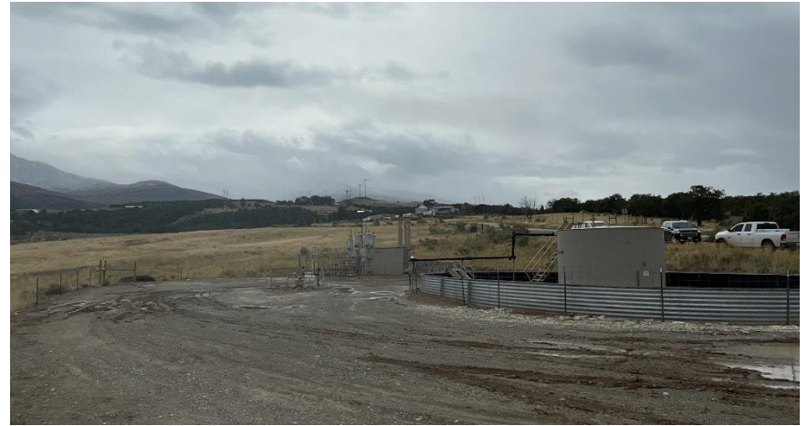
North East corner of location.