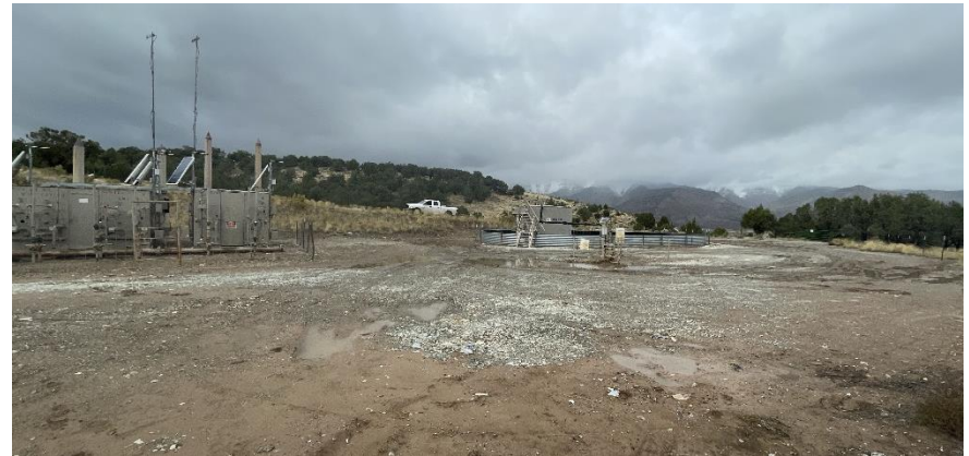
South East corner of location.