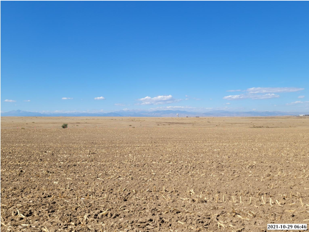
VIEW - WEST