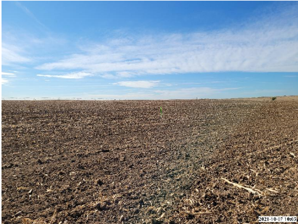
VIEW - SOUTH