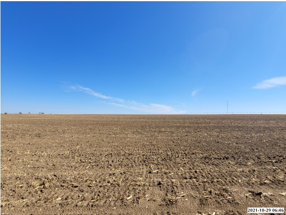
VIEW - EAST