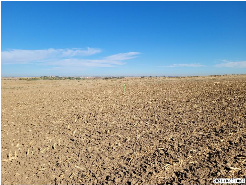
VIEW - NORTH