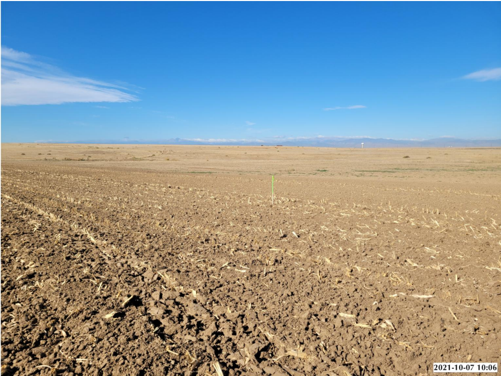
VIEW - WEST