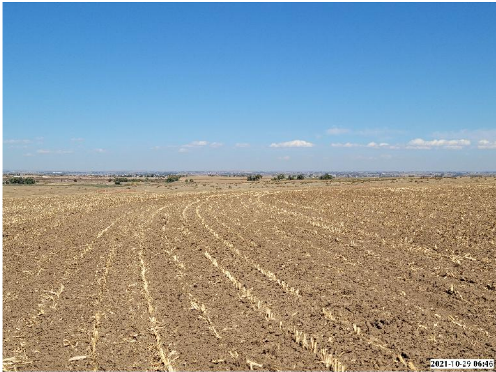
VIEW - NORTH