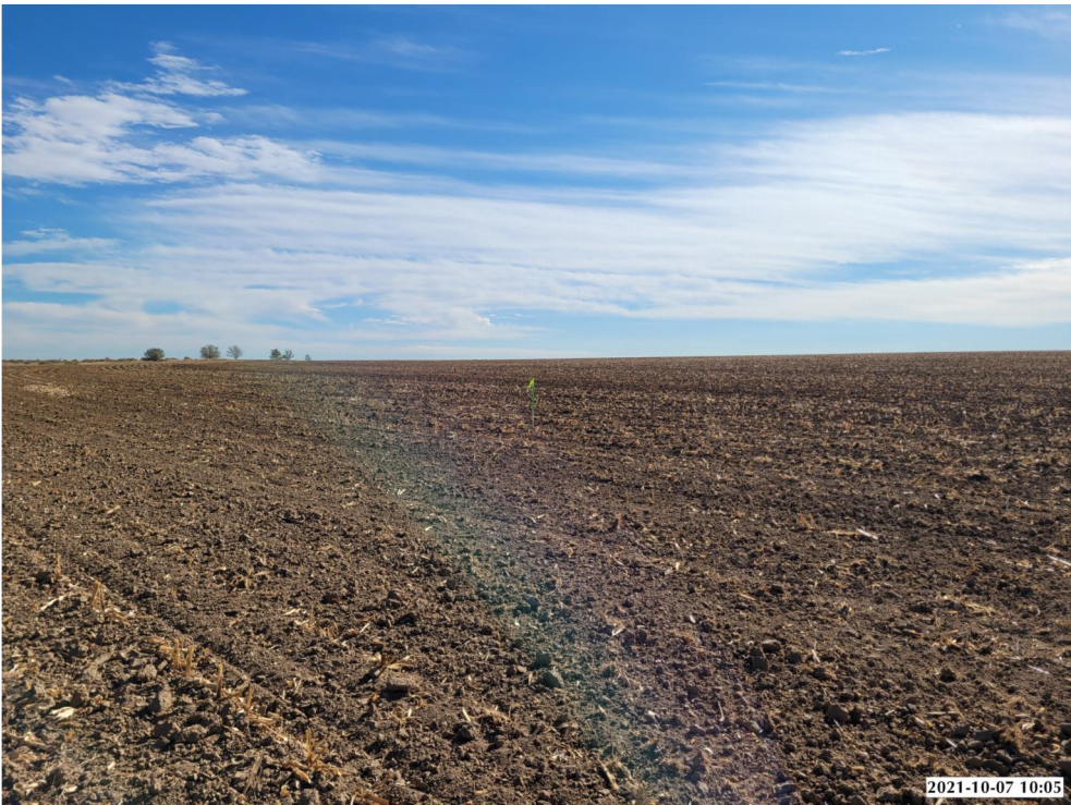
VIEW - EAST