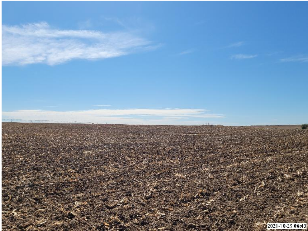
VIEW - SOUTH