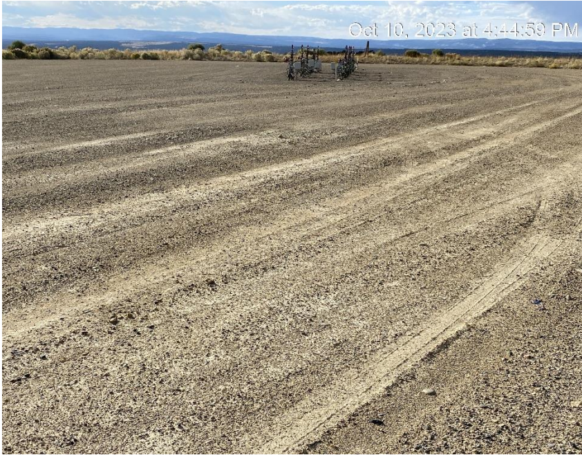
Well pad from Northeast corner