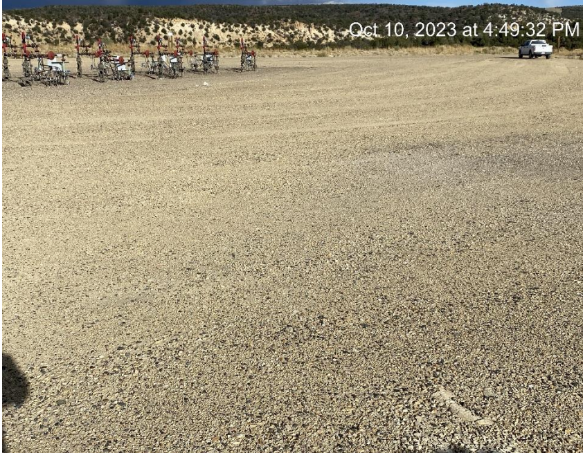
Well pad from Southwest corner