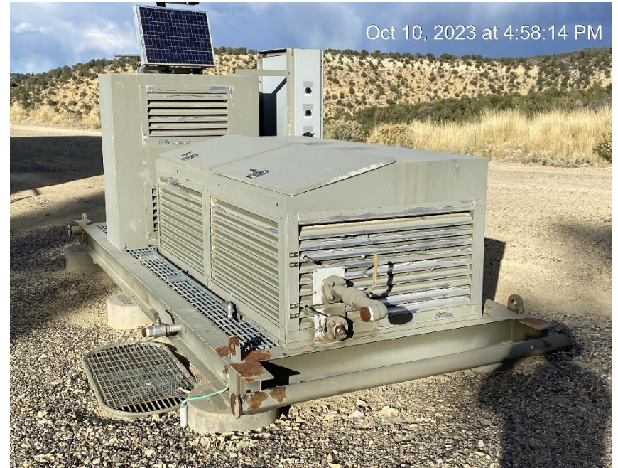
Equipment not in service