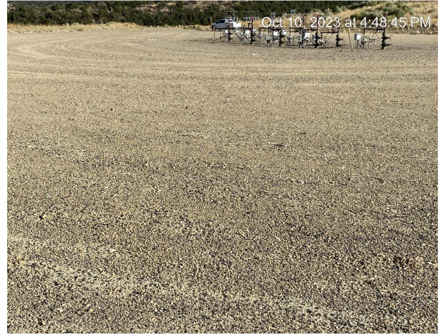
Well pad from Northwest corner