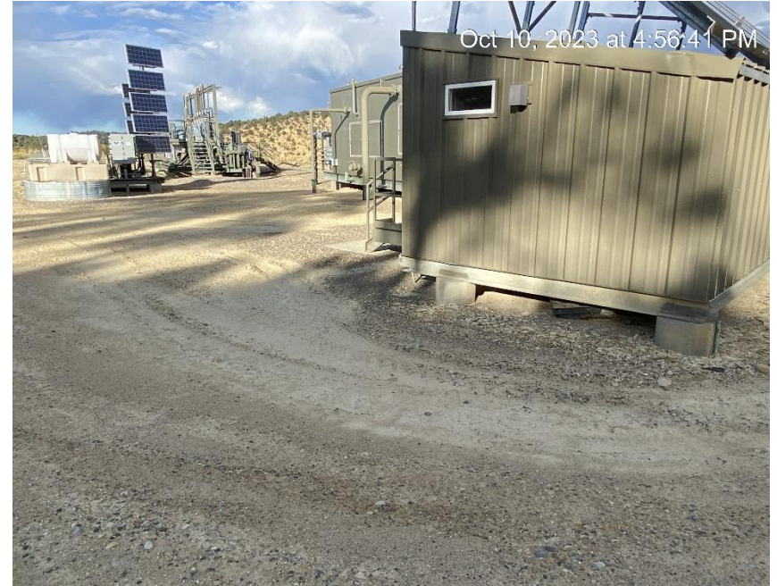
Production facility from Southwest corner