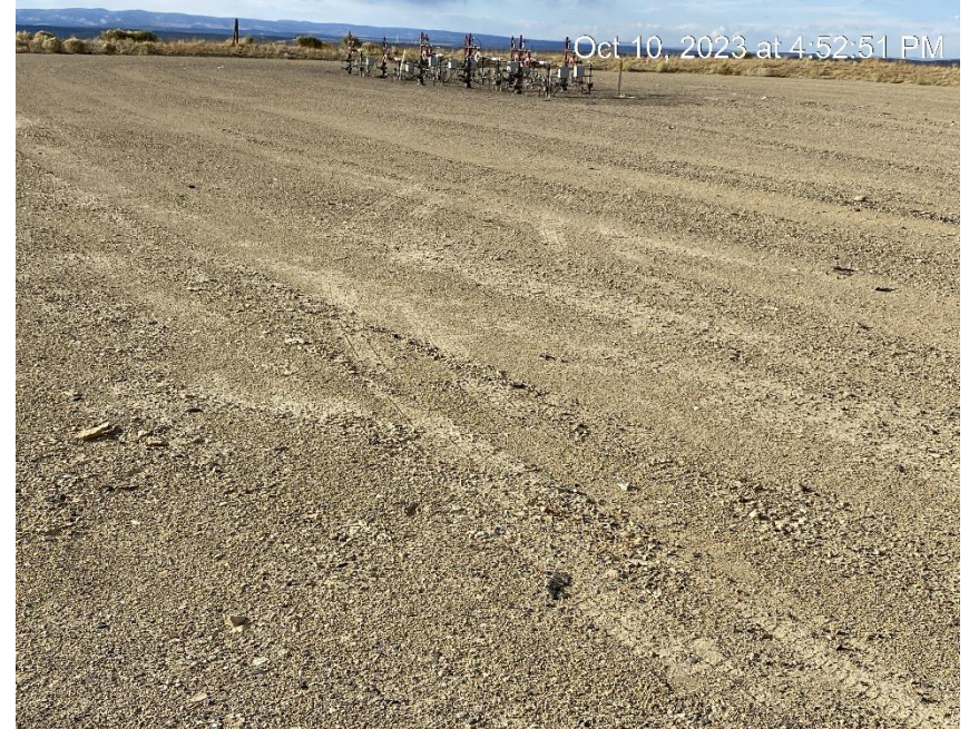
Well pad from Southeast corner