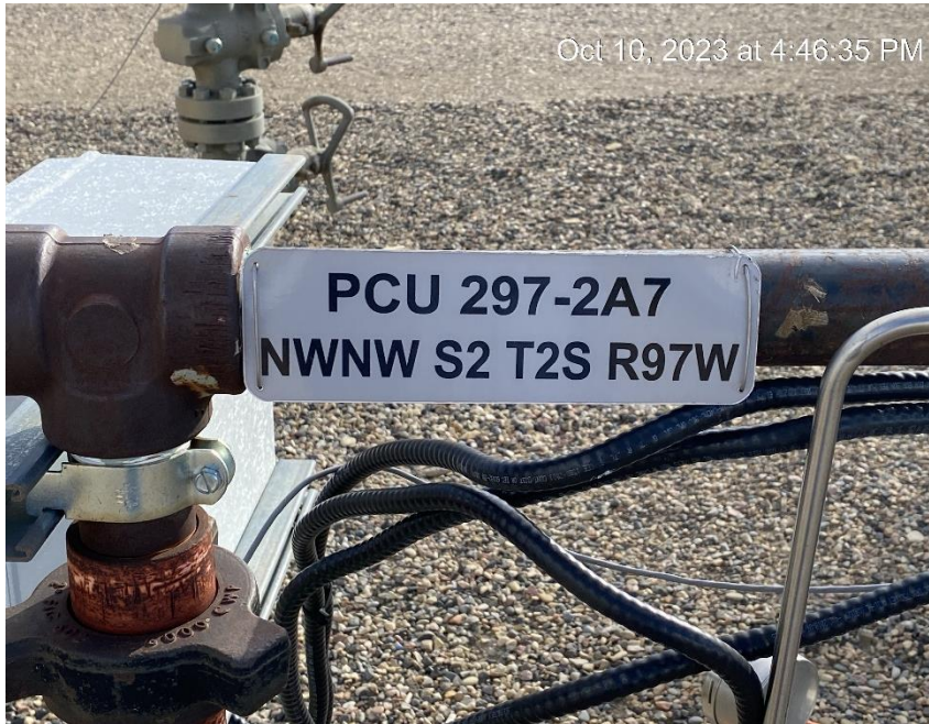
Wellhead signs missing required information