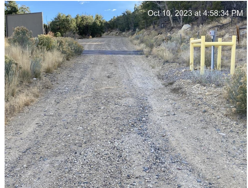
Access road to facility