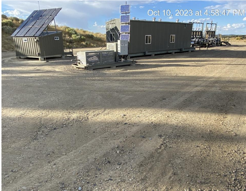
Production facility from Southeast corner