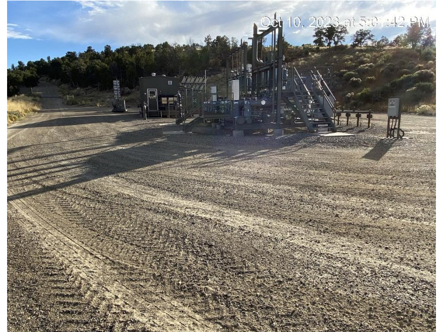
Production facility from Northeast corner