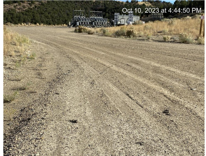
Well pad access road from Production facility