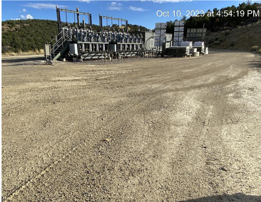
Production facility from Northwest corner