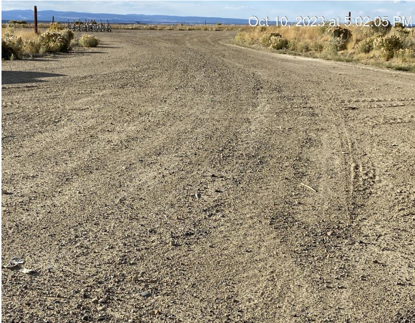
Access road to well pad from Production facility