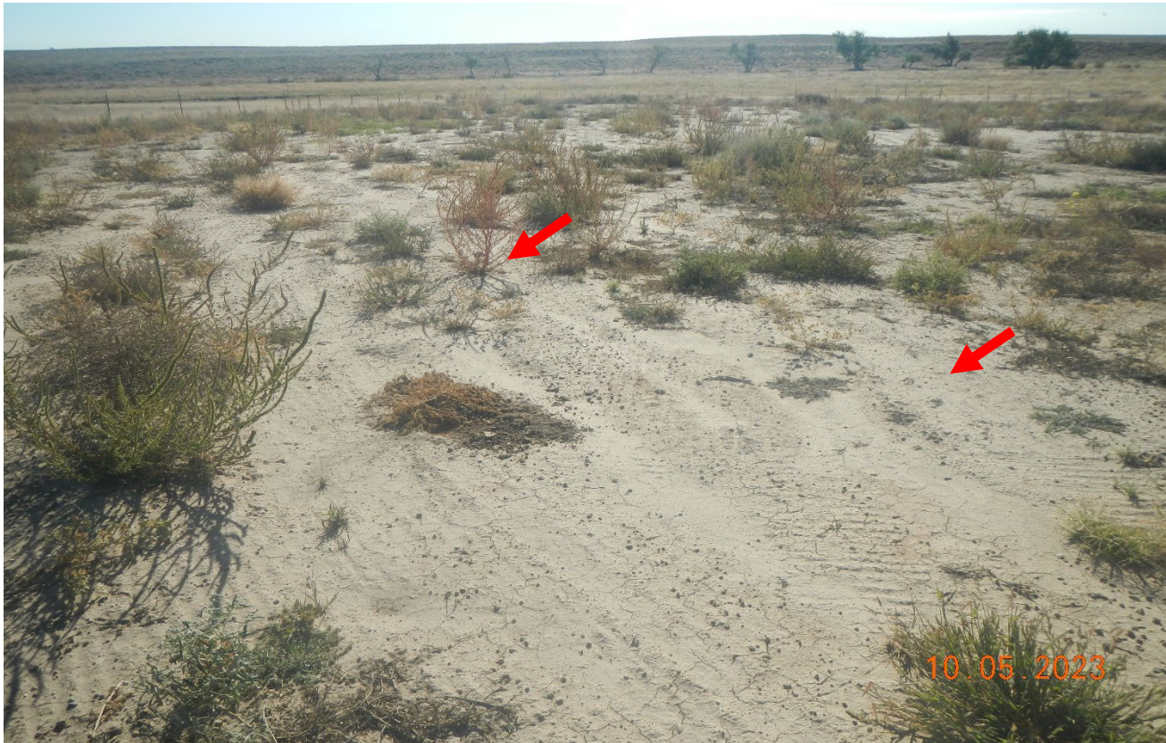
Photo 9. Facing east at the location. There is more vegetation establishment at the west side of the location however most is undesirable weeds.