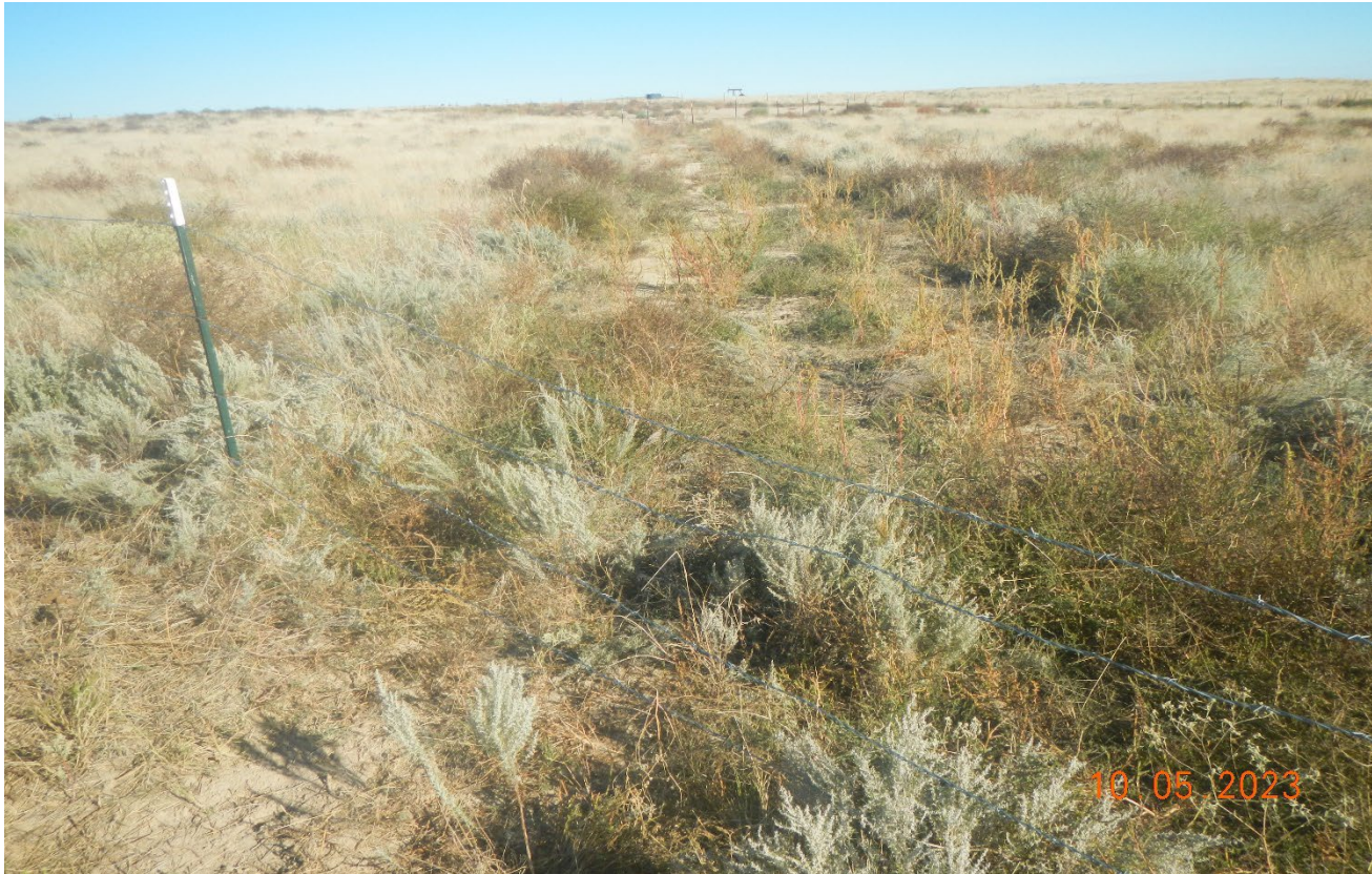
Photo 1. Facing northwest toward the reclaimed access road. There is vegetation establishing along with undesirable weeds that will need to be controlled.