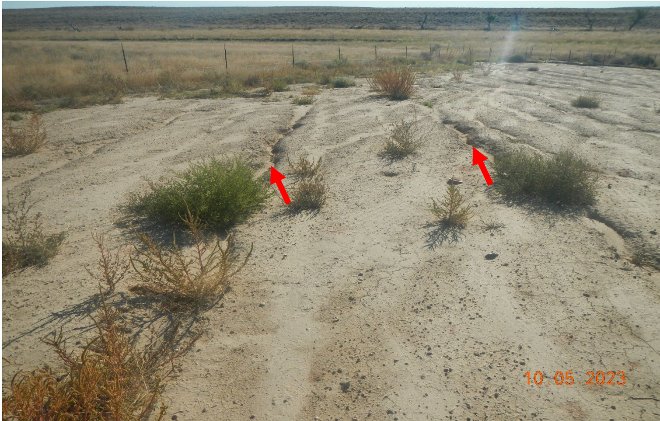
Photo 5. Facing northeast. There is erosion occurring at the location and soils are not stabilized.