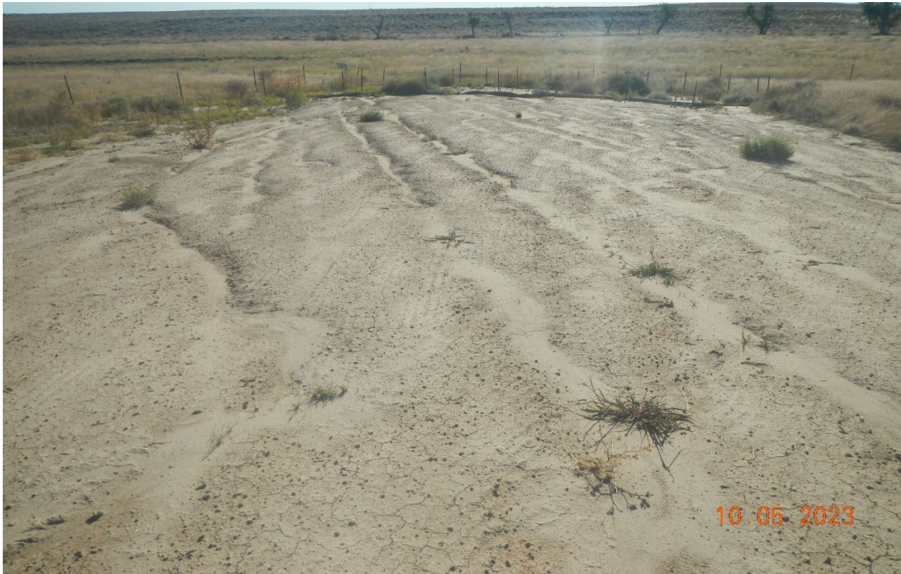
Photo 4. Facing east were excavated area was backfilled. Perennial vegetation does not appear to be establishing. A soil analysis needs to be performed