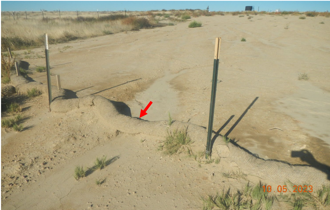
Photo 3. There is erosion occurring and stormwater controls are not maintained. Stormwater has eroded underneath the wattles.