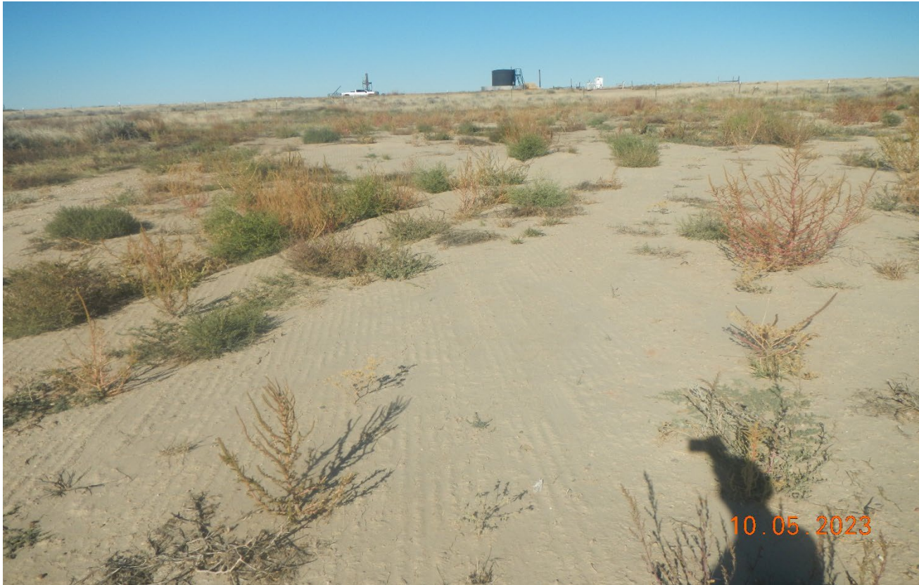
Photo 6. Facing west at the location. There is more vegetation establishment at the west side of the location however most is undesirable weeds.