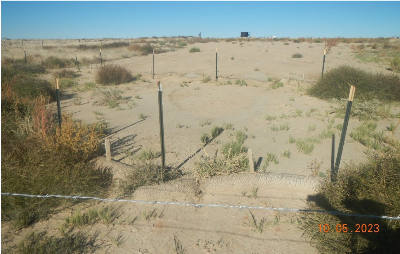
Photo 2. Facing west toward the location. Remediation Project #19874 is ongoing. Reclamation does not appear to be progressing.