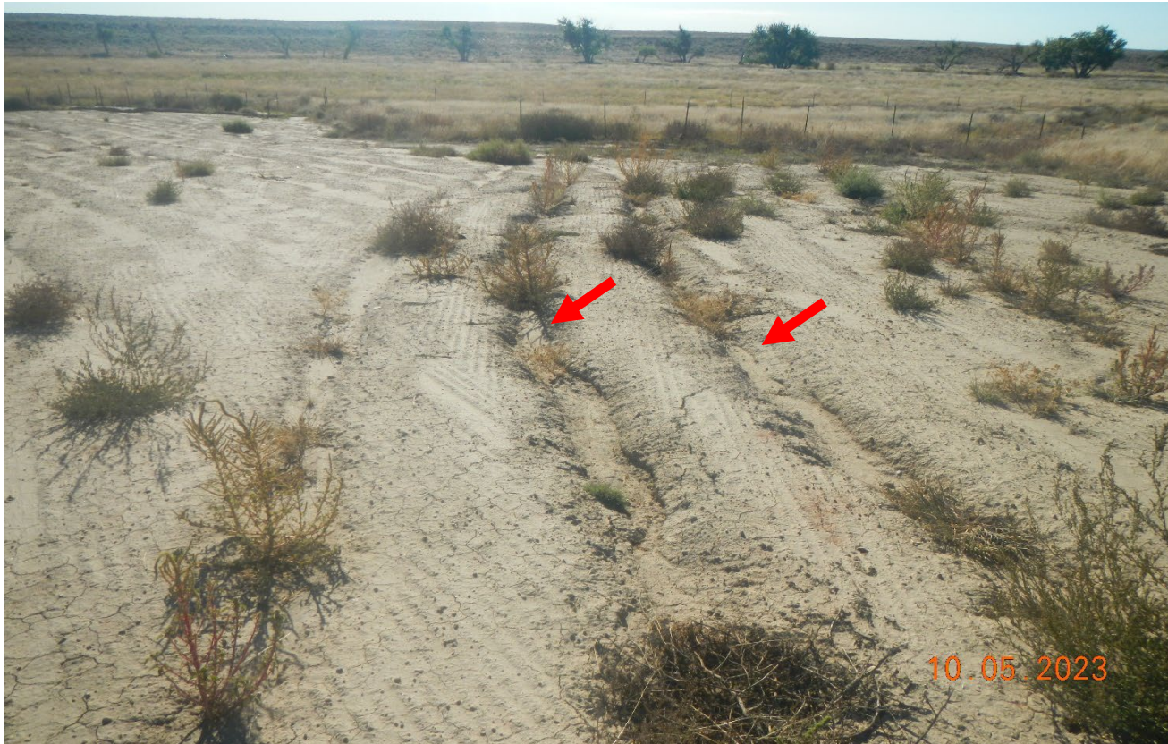
Photo 7. Facing southwest. There is erosion occurring at the location and soils are not stabilized.