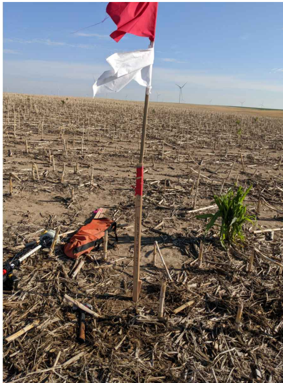
WELL LOCATION LOOKING NORTH 7/24/2022