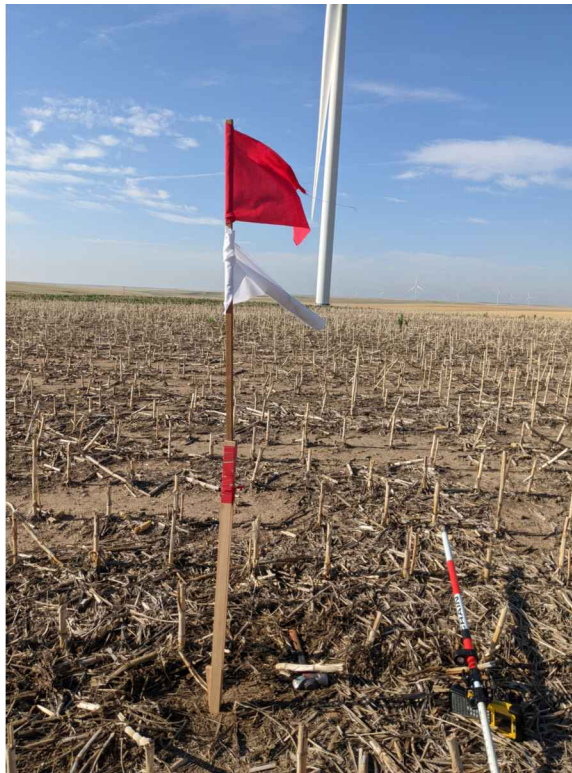
WELL LOCATION LOOKING SOUTH 7/24/2022