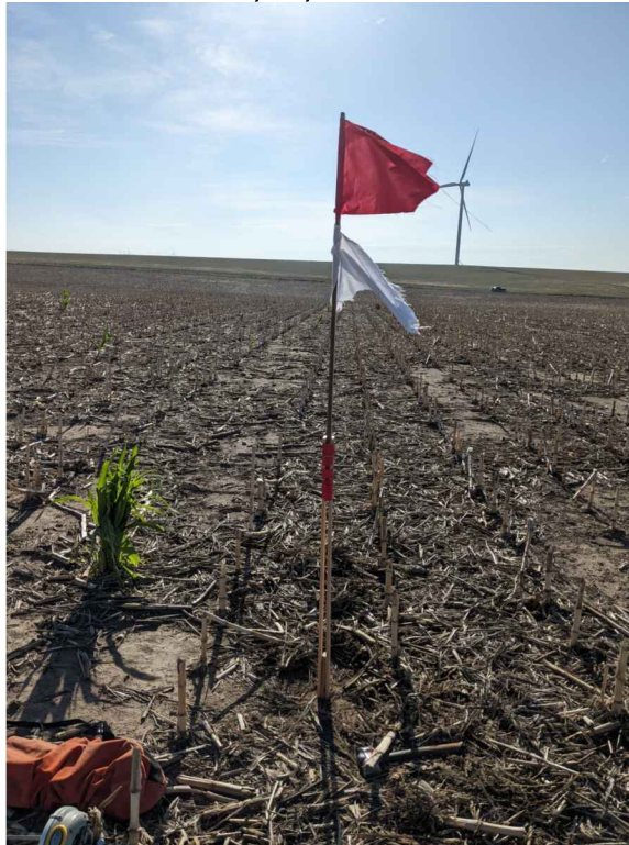
WELL LOCATION LOOKING EAST 7/24/2022