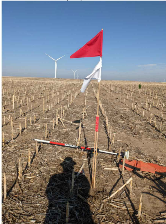
WELL LOCATION LOOKING WEST 7/24/2022