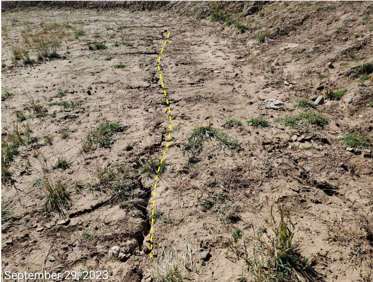
Photo 12: Photo taken from the perimeter of the working pad surface, on the southwest end of the Location, facing south. Photo shows long cracks (left of yellow line) forming on the Location; stabilization concerns exist