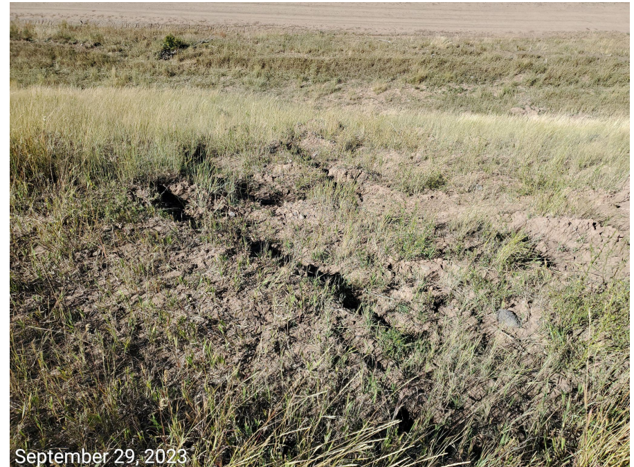
Photo 5: Continued from photo 4. Photo shows mass soil migration concerns on the fill slope of the Location.