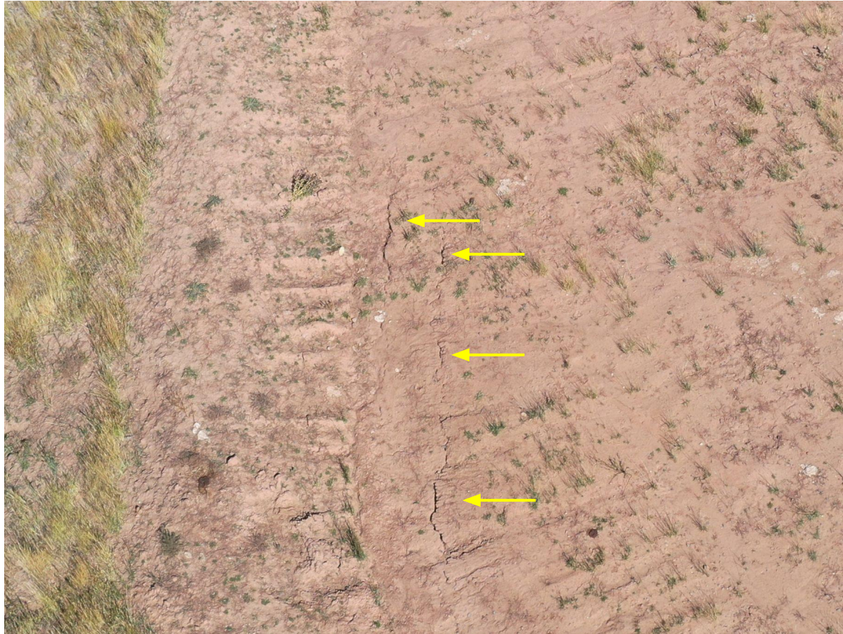
Photo 13: Photo taken with use of a sUAS. Photo example showing cracks forming on along the entire western perimeter of the working pad surface