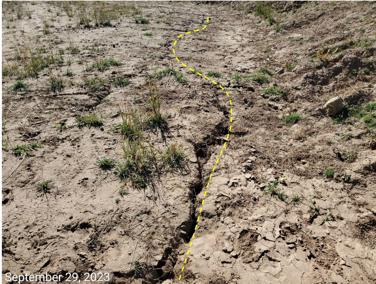
Photo 11: Photo taken from the perimeter of the working pad surface, on the central-west end of the Location, facing south. Photo shows long cracks (left of yellow line) forming on the Location; stabilization concerns exist