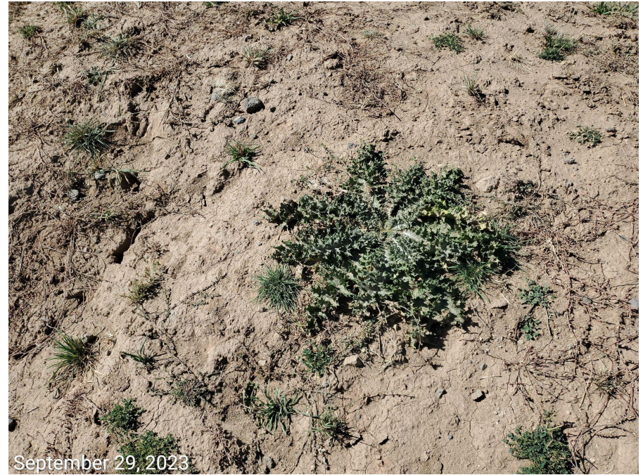
Photo 3: Photos left taken from the western areas of the WPS. Photos provide examples of Musk thistle (both mature, and rosette) establishing on the western ends of the Location.