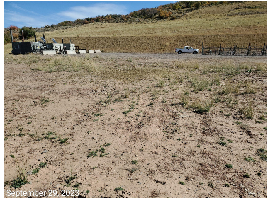
Photo 1: Photos 1-2 taken from the west end of the working pad surface. Photos provide an overview of the Location from north, northeast, southeast to south.