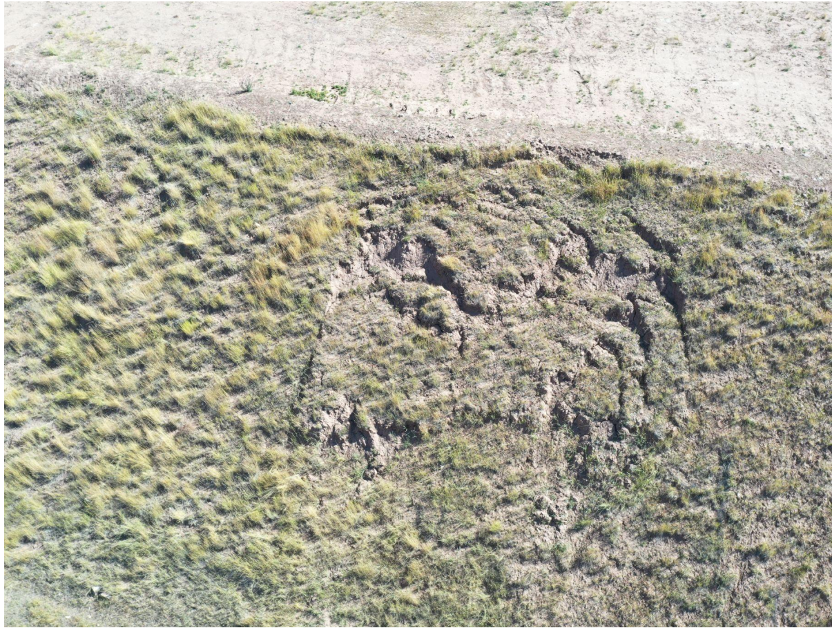
Photo 4: Photo taken with use of a sUAS. Photo shows areas on the fill slope (west end of the Location), where mass soil migration is apparent; stabilization concerns exist.