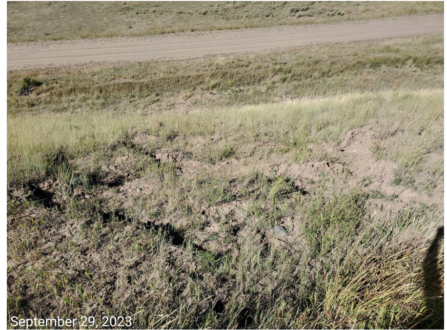
Photo 6: Continued from photo 4. Photo shows mass soil migration concerns on the fill slope of the Location.