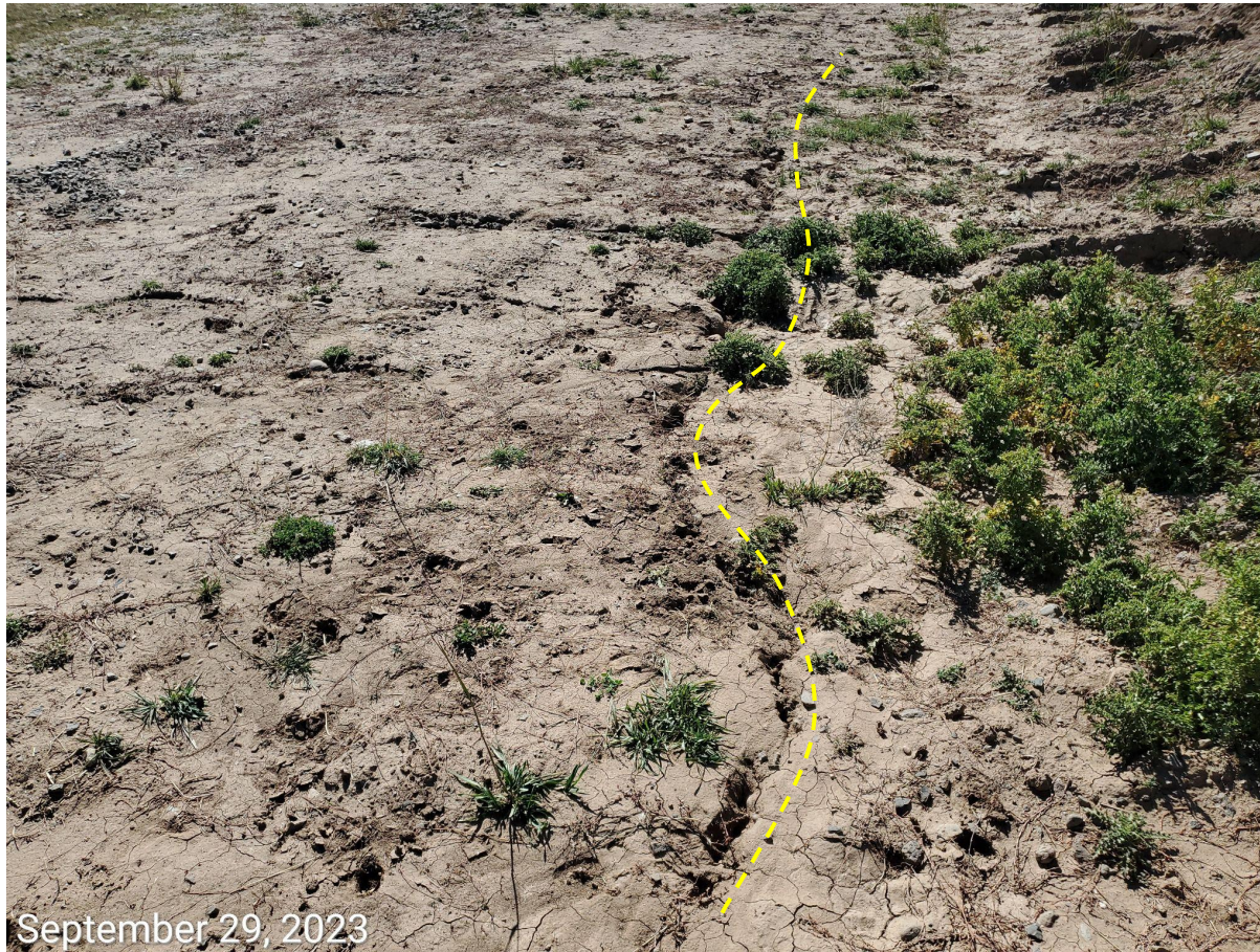
Photo 10: Photo taken from the perimeter of the working pad surface, on the northwest end of the Location, facing south. Photo shows long cracks (left of yellow line) forming on the Location; stabilization concerns exist.