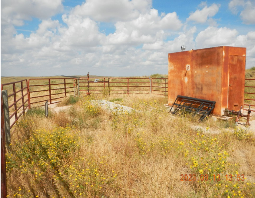
7. View inside fencing at well location. Note vegetation.