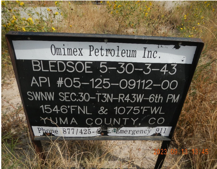
1. Well sign at well Location.