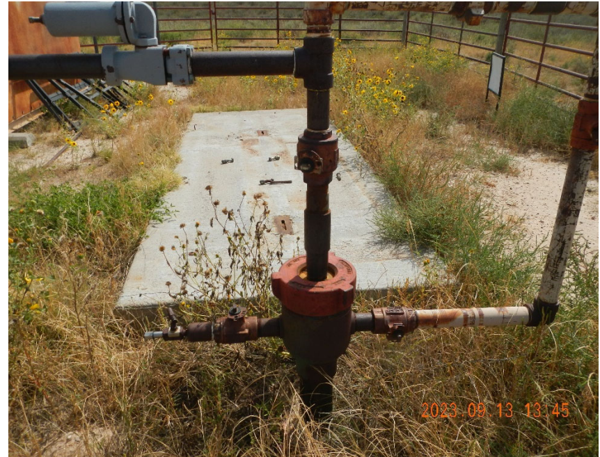
2. View of Wellhead. Note vegetation and cement pad.