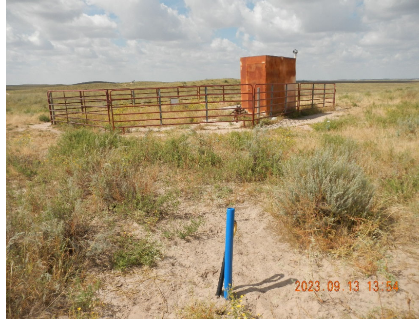
8. Location overview from 1 of 4 Deadman.