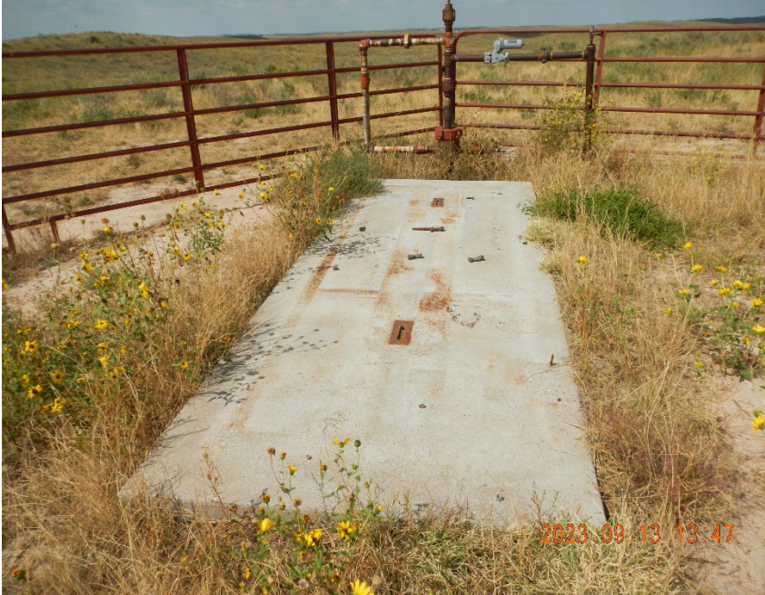
3. Pump Jack Cement Pad. Note vegetation.