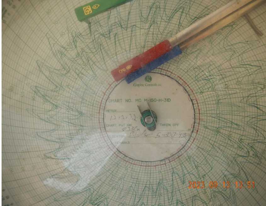
5. Chart in Meter Box at time of inspection.