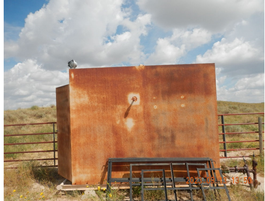
4. Meter Shed. Note Pump Jack barriers left on location after pumping unit removed.