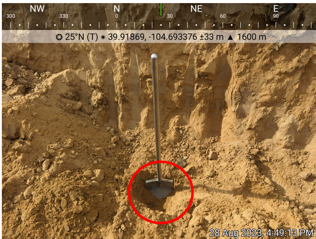
Photo 6: SS13 collected from the base of the pumping unit excavation area, 8/28/2023.