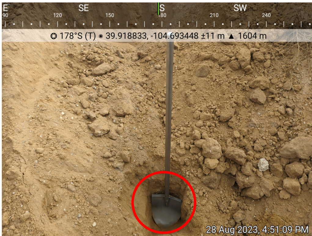
Photo 7: SS14 collected from the south sidewall of the pumping unit excavation area, 8/28/2023.