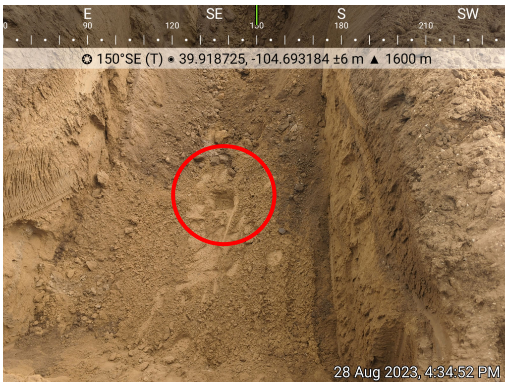
Photo 2: SS11 collected from the base of AST excavation area, 8/28/2023.