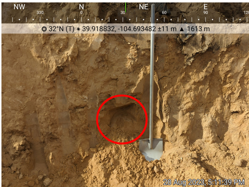
Photo 8: SS15 collected from the north sidewall of the pumping unit excavation area, 8/28/2023.