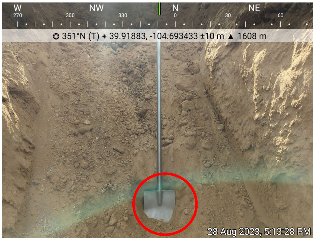
Photo 9: SS16 collected from the west sidewall of the pumping unit excavation area, 8/28/2023.