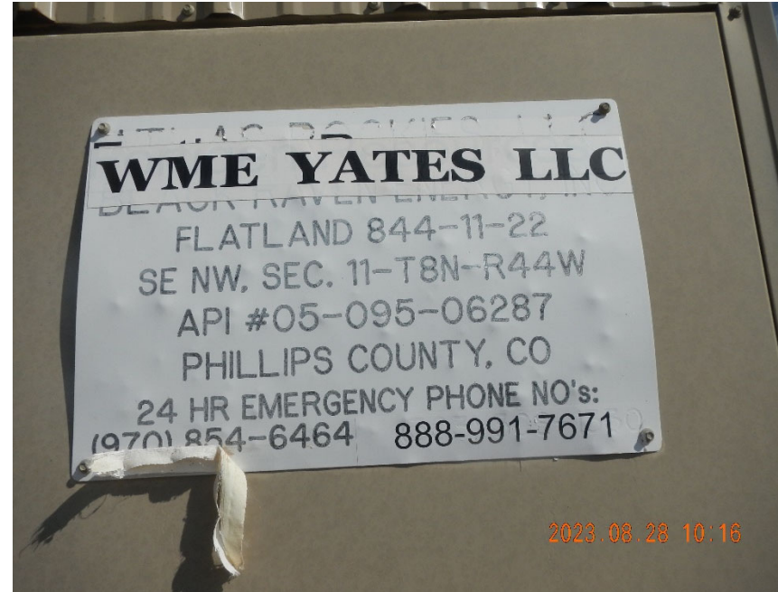
2. Sign posted on meter shed.