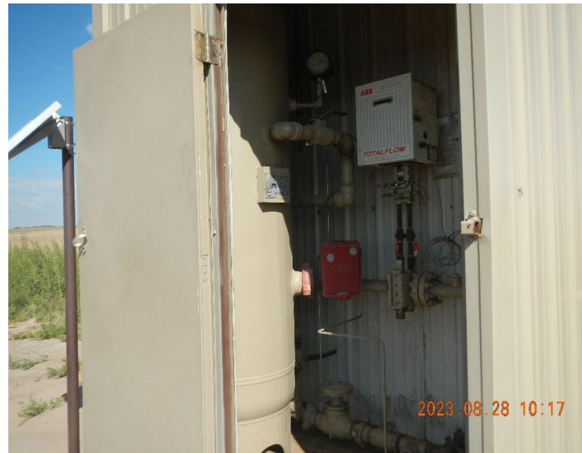
8. View of vertical separator and digital gas meter run.