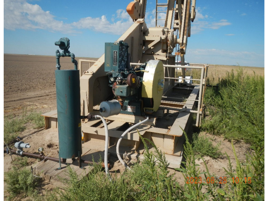
6. Prime mover and supply gas dryer vessel. Note vegetation.