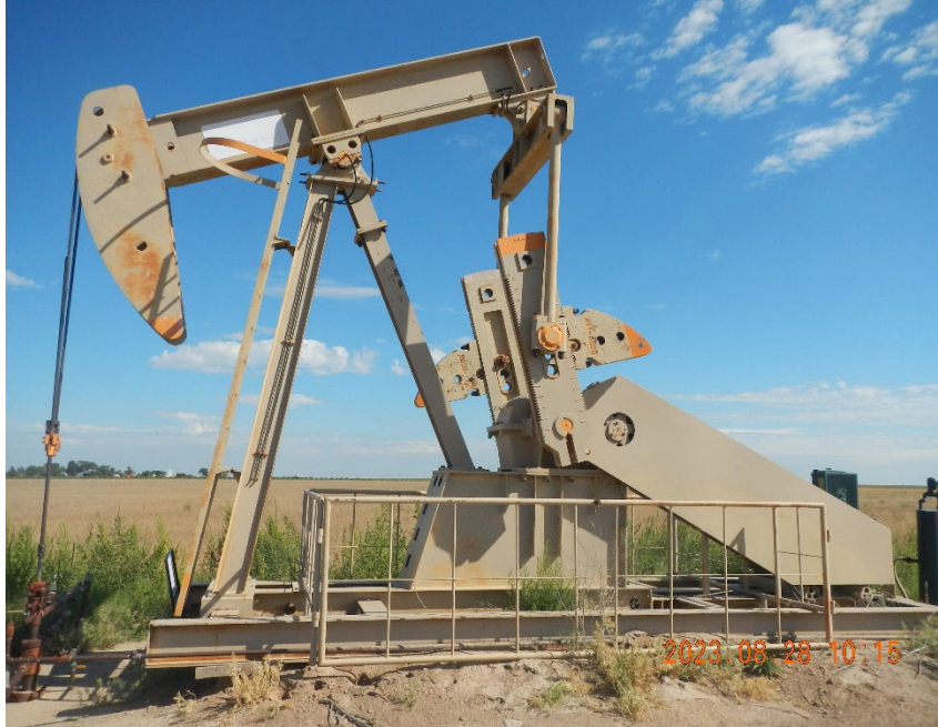
5. Pump Jack. Note vegetation.