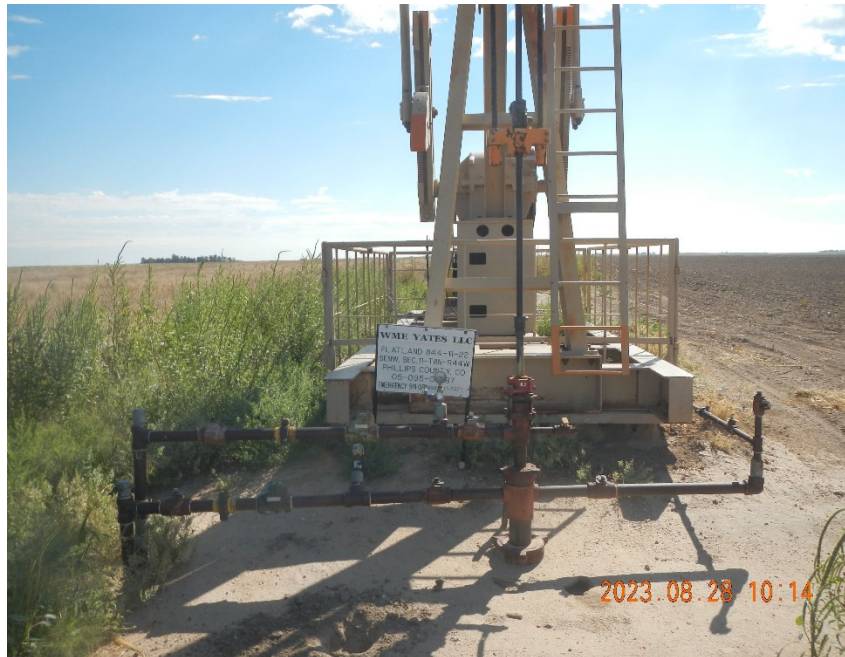
3. View of wellhead.