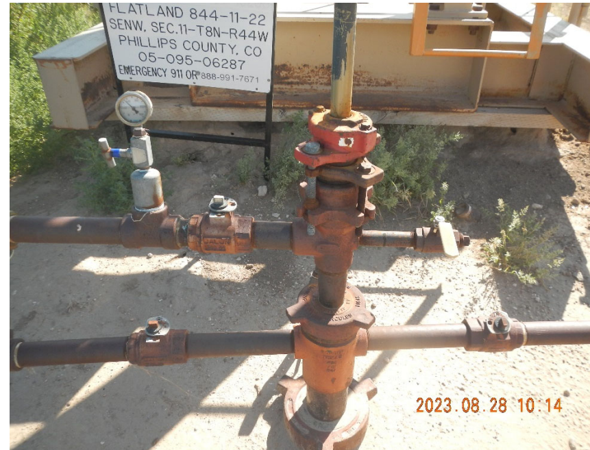
4. View of wellhead.