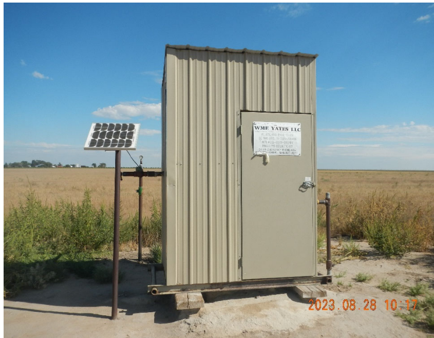
7. Meter Shed.