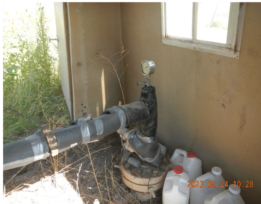
4. View of Wellhead inside Well House.