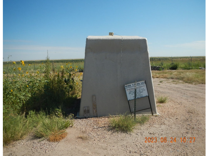
2. Fiberglass Well House.