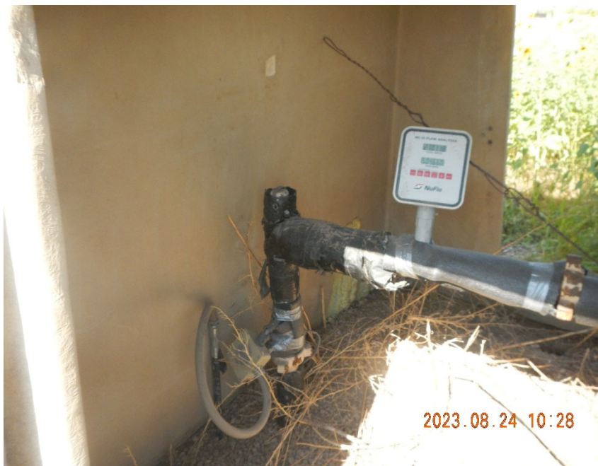
3. View of Flowline and Flow Meter inside Well House.