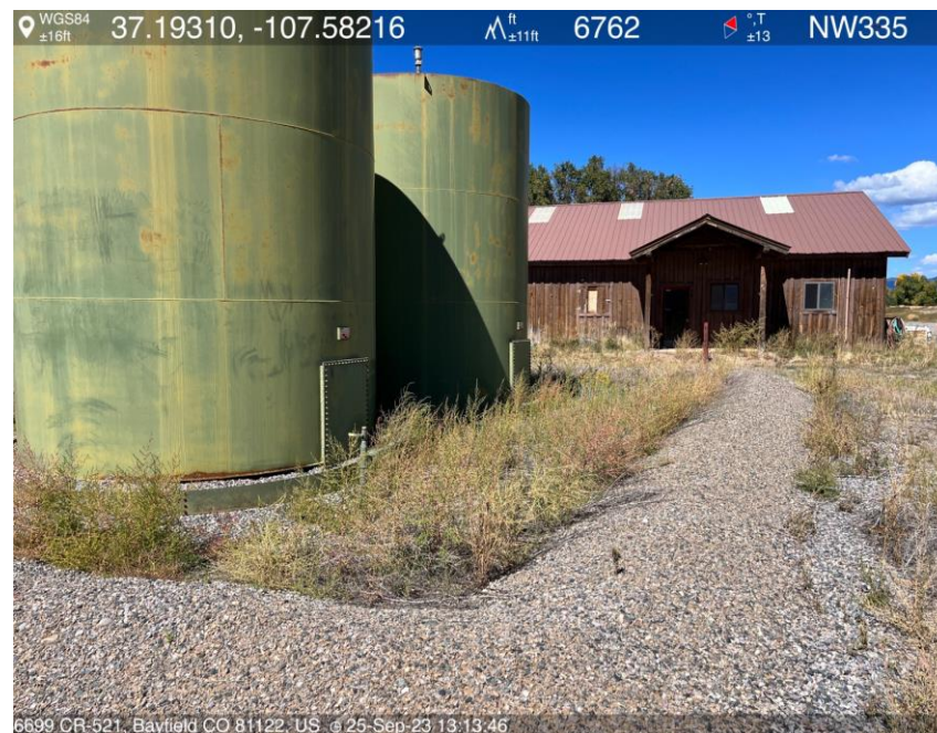
Photo #12. View of corrective action not completed. Weeds growing within tank battery berm.