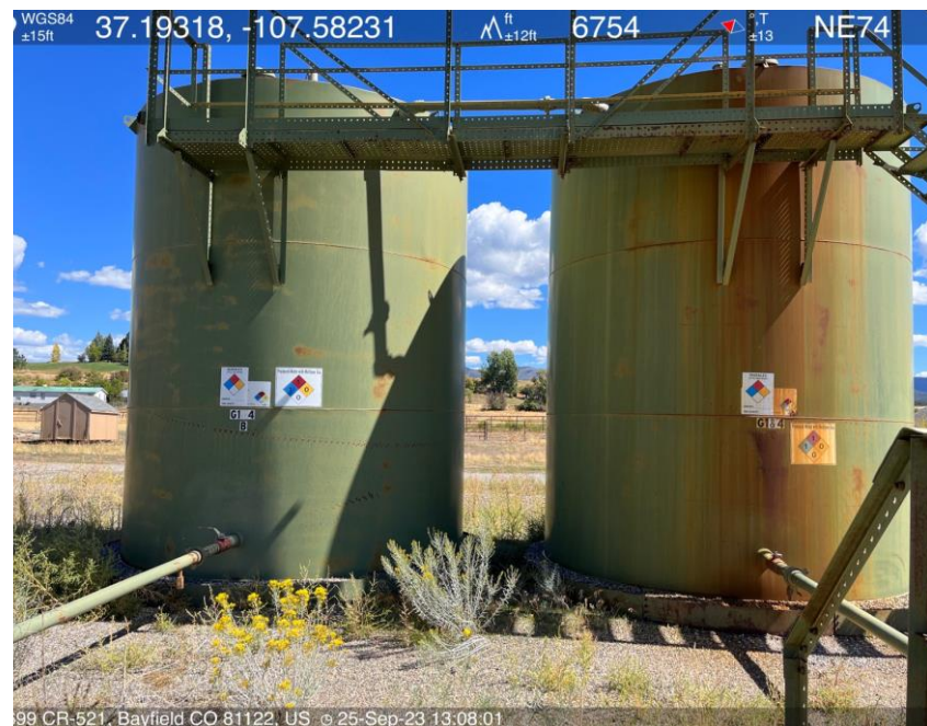
Photo #6. View of corrective action not completed. No tank volume posted.