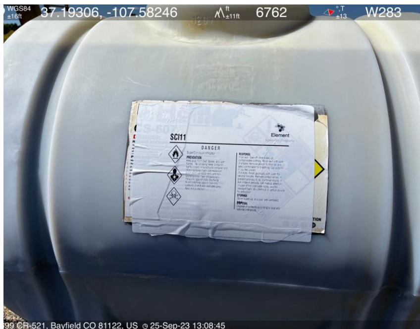
Photo #3. View of non-legible container labeling at the #1-A wellhead.