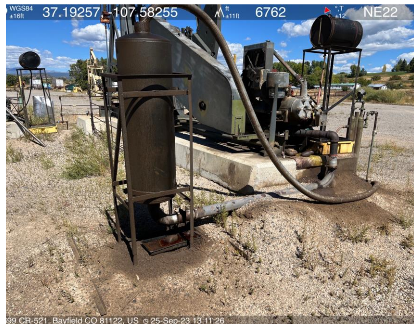
Photo #10. View of corrective action not completed. Impacted material on ground at the #2-A wellhead.