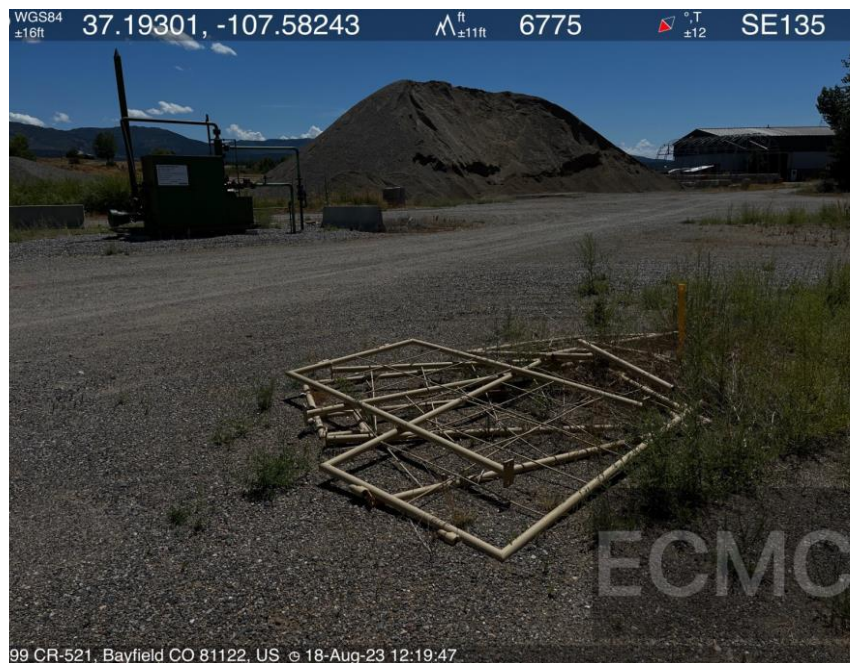
Photo #7. View of corrective action identified in FIR Doc.#712700542.