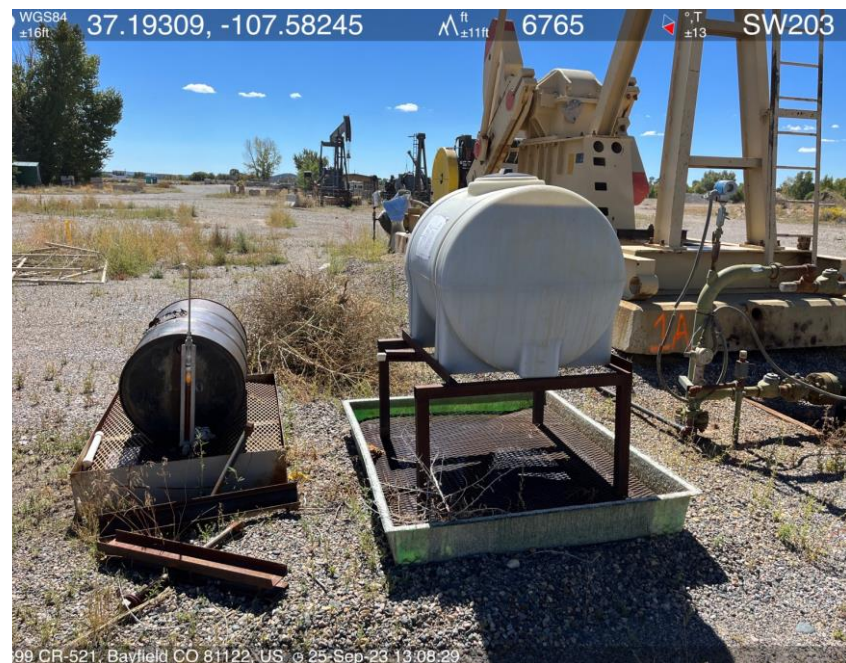
Photo #2. View of corrective action not completed at the #1-A wellhead, disconnected containers.