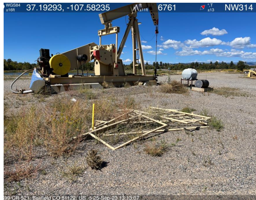
Photo #8. View of corrective action not completed. Sections of fencing on ground.